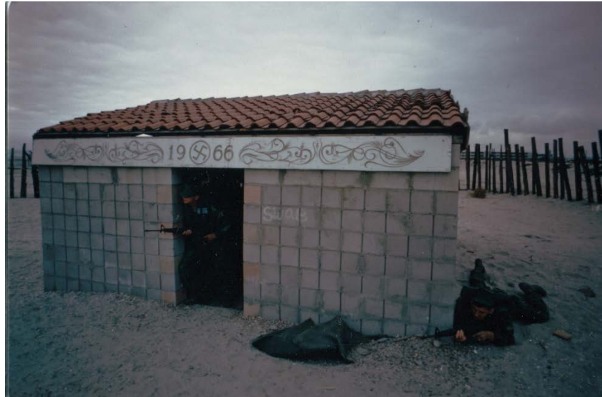
Figure 49. Concrete block structures were also part of Dragon Village. A Navy mock-up Vietnamese settlement used in SEAL team training exercises at Coronado, California, February 1968.