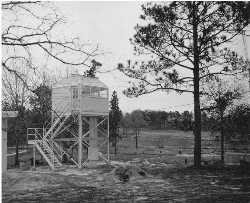
Figure 7. Range 34B was an example of one of the latest and most modern ranges on Fort Polk, Louisiana, January 1968 (NARA SC644399).

Training at outdoor ranges also included classroom work in reused buildings (Figure 8). However, classes were not always taught in classrooms; Figure 9 shows a machine gun class held outdoors. Outdoor range infrastructure also included bunkers and other shelters (Figure 10).