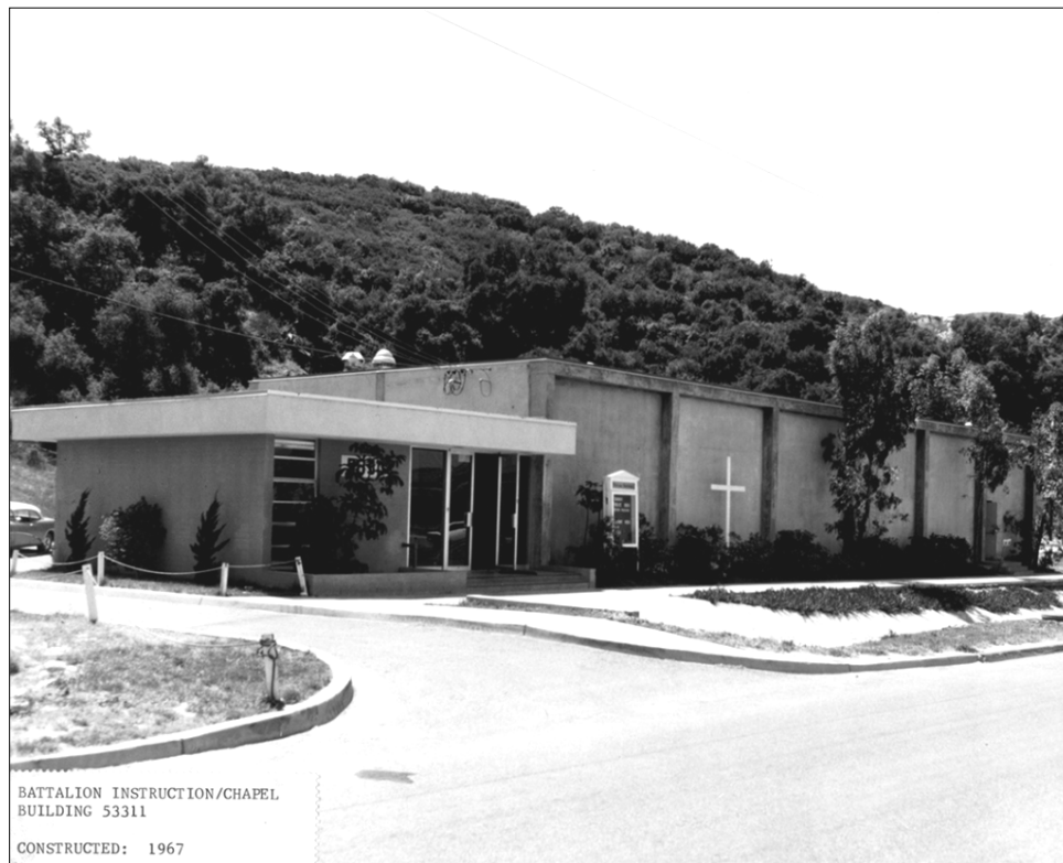
Figure 62. Chapel at Camp Pendleton, California, built in 1967 (Camp Pendleton Cultural Resources).