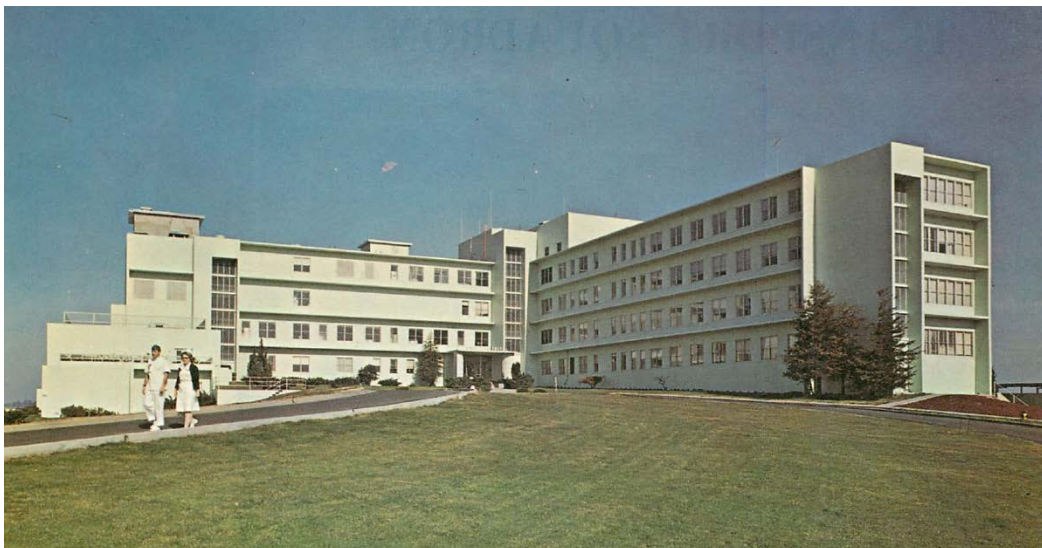
Figure 71. Travis Air Force Base hospital complex in 1966 (60 th AMW Historian).

100 more beds for the casualty staging unit adjacent to the main hospital building. 431