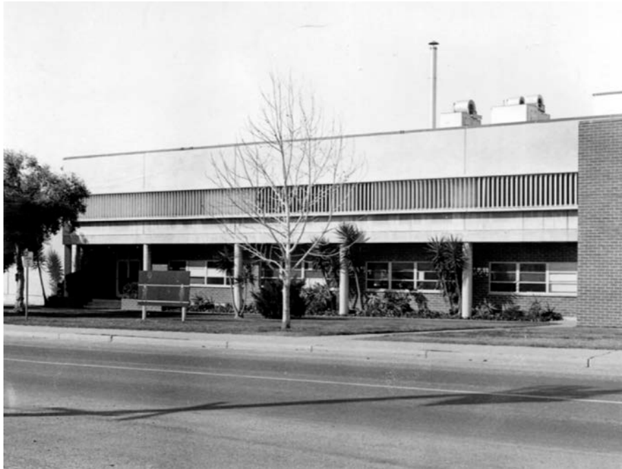
Figure 60. Station training building at Marine Corps Air Station El Toro, Santa Ana, California, 1972 (NARA MC 127-GG Box 1 A149698).

Marine Corps Air Station Yuma, Arizona, was operationalized by the Marines in 1962. The airfield featured aerial gunnery ranges spread over 3 million acres. It also had three bomb and rocket targets, three remote strafing targets, and eight banner strafing targets that were used for training by aviators from all services for missions in Vietnam. 347 Other air stations provided training as well, such as Air Station El Toro (Figure 60).