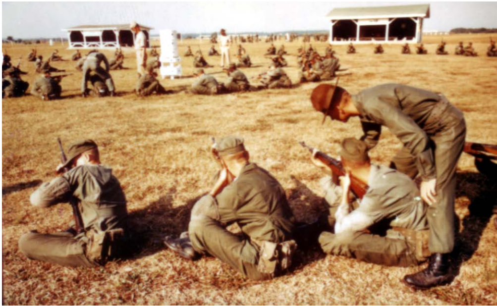
Figure 56. Recruits at Marine Corps Recruit Depot Parris Island, South Carolina, begin instruction on the rifle range, 1967 (NARA 127-GG-921-A601744).

Realignments in training took place for officers, as well. In 1966, the Marine Corps Basic School for newly commissioned officers was temporarily reduced from 26 to 21 weeks. The Amphibious Warfare School for majors and captains was also temporarily reduced from 42 to 21 weeks. The reductions were made by eliminating the subjects that were nontactical in nature. The reductions allowed an approximate doubling of professionally trained officers per year who were available for duties in the Fleet Marine Forces. 336