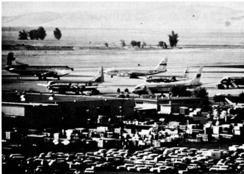
Figure 73. Travis AFB's crowded aerial port in 1967.

troops and 4,479 tons of equipment. 456 In the autumn of 1966, the Army's 1st Cavalry Division utilized the Travis AFB airlift capacity to transport approximately 9,000 replacement troops to Vietnam. This complex operation was facilitated by establishing an Army liaison team at Travis AFB to assist with scheduling. 457 While these large operations took place occasionally, there was a constant daily flow of personnel and materiel from Travis AFB to Southeast Asia. Between 1966 and 1970, over 5,579,000 passengers and 1,097,924 tons of cargo were processed at Travis AFB (Figure 73). 458