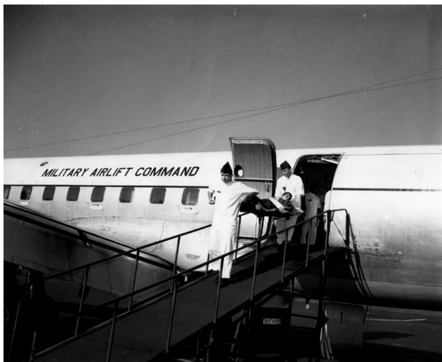
Figure 67. MAC returns a former POW of the Viet Cong to Fort Campbell, Kentucky, November 1969.

Air Force Nurse Corps personnel arrived in South Vietnam in early 1966 and were assigned to the 12 th U.S. Air Force Hospital in Cam Ranh Bay. Later arrivals saw duty serving within South Vietnam in aeromedical evacuation squadrons and in dispensaries throughout the area. Additionally, Air Force nurses served on the evacuation flights from South