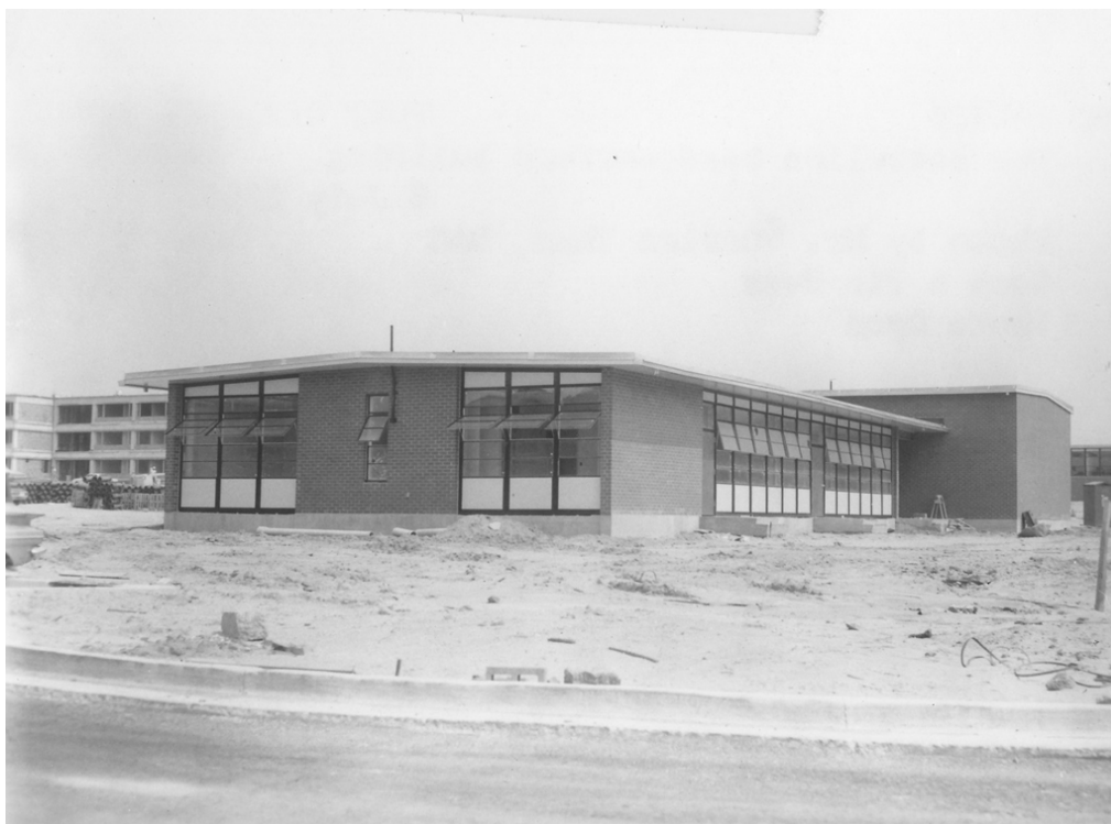
Figure 36. The new battalion headquarters building at Fort Dix, New Jersey [this standardized plan can be found at most Army installations], July 1968.

A then newly constructed battalion headquarters at Fort Dix is shown in Figure 36. Other headquarters were retrofitted into existing buildings, as at Fort Polk, LA (Figure 37) while others were new construction (Figure 38).