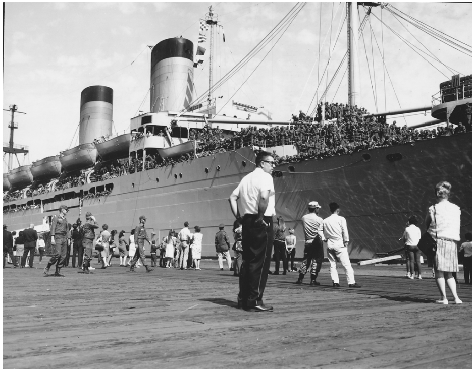
Figure 44. Troops of the 4 th Infantry Division, Fort Lewis, Washington, are shown onboard the military sea transport service troop ship—General George Pope, at Pier #1 at the Port of Tacoma, WA, September 1966 (NARA SC 633237).

Most cargo traveled to Vietnam by sea through the military sea transport service, which also transported personnel, although most traveled by air (Figure 44). Materiel was shipped from vendors or depots directly to U.S. West Coast military ports or airfields, or directly to commercial ports. From these locations cargo either traveled directly to South Vietnam or to Okinawa. The first stop in South Vietnam was either the port at Saigon or the Tan Son Nhut airport. 232 Delivery farther in-country was by water or air.