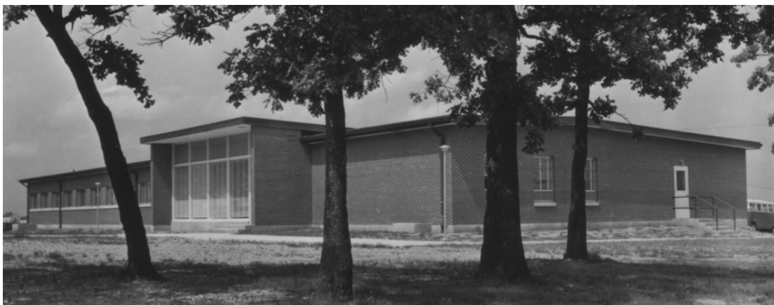
Figure 42. The newly constructed Boak Dental Clinic at Fort Leonard Wood, Missouri, 1965.

As mentioned previously, improved dental care was another initiative by the military to recruit and retain personnel during the Vietnam War period. Advanced dental research and new dental clinics were part of the modernization of the Army's dental care. As part of this effort, a new dental clinic was completed at Fort Leonard Wood in 1965, and another was completed at Fort Polk in 1972, constructed in an area of WWII temporary buildings still in use (Figure 42 and Figure 43).