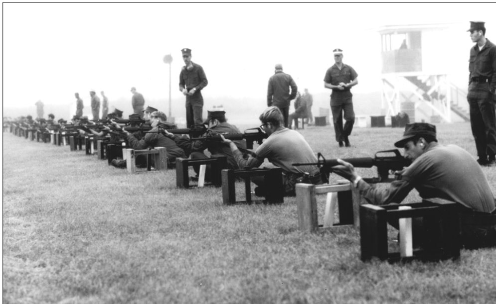
Figure 47. Naval trainees on the rifle range at the U.S. Naval Construction Battalion Center, Gulfport, Mississippi, 1970 (Loose Print file, Navy Photo Library, Washington Navy Yard).

In 1965, training in aviation and submarine programs remained a top priority for the Navy as the intensified demands of Vietnam were felt throughout the military. In support of these training programs, facilities for the second increment of construction at the Fleet Ballistic Missile (FBM) Submarine Training at Charleston, South Carolina, were almost