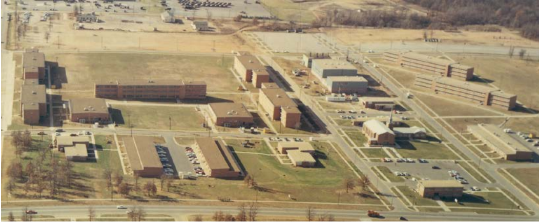
Figure 33. A portion of a typical Vietnam-era barracks complex at Fort Leonard Wood, Missouri, but also found on many Army posts throughout the country. This photo shows half of the complex with barracks, mess halls, battalion headquarters/classrooms, and company administration buildings on the left with gymnasium, branch post exchange, branch medical clinic, chapel, and brigade headquarters on the right. The other half of the complex is to the right off the photo.

In addition to WWII barracks, prefabricated buildings were quickly assembled to accommodate the increased troop levels (Figure 34 and Figure 35).