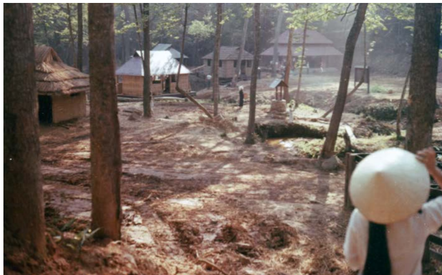
Figure 59. Overall view of the Southeast Asian Village constructed at the Basic School, Quantico, Virginia, June 1966 (NARA 127-GG-957-A556414).

The town included two gun pits, hidden demolitions, and a concrete-block tunnel with concealed entrances. The new layout provided students in the Infantry Training School an environment where they learned urban assault and combat in built-up areas. 344