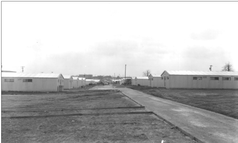
Figure 34. Prefabricated metal troop housing at Fort Leonard Wood, Missouri, November 1966 (NARA SC635541).

In addition to WWII barracks, prefabricated buildings were quickly assembled to accommodate the increased troop levels (Figure 34 and Figure 35).