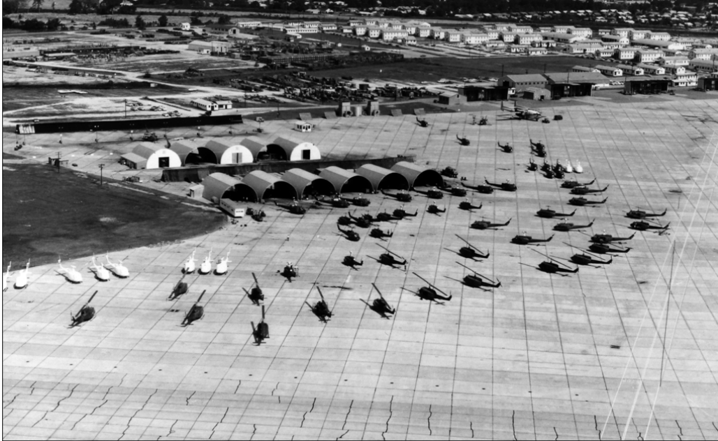
Figure 15. The First Cavalry (Airmobile) Division's helicopters sit on the ramp at Air Force Logistics Command's Mobile Air Material [sic] Area at Brookley AFB, Alabama. The helicopters have been sea-sprayed in the hangars in preparation for being loaded on ships headed for Vietnam, November 1965.