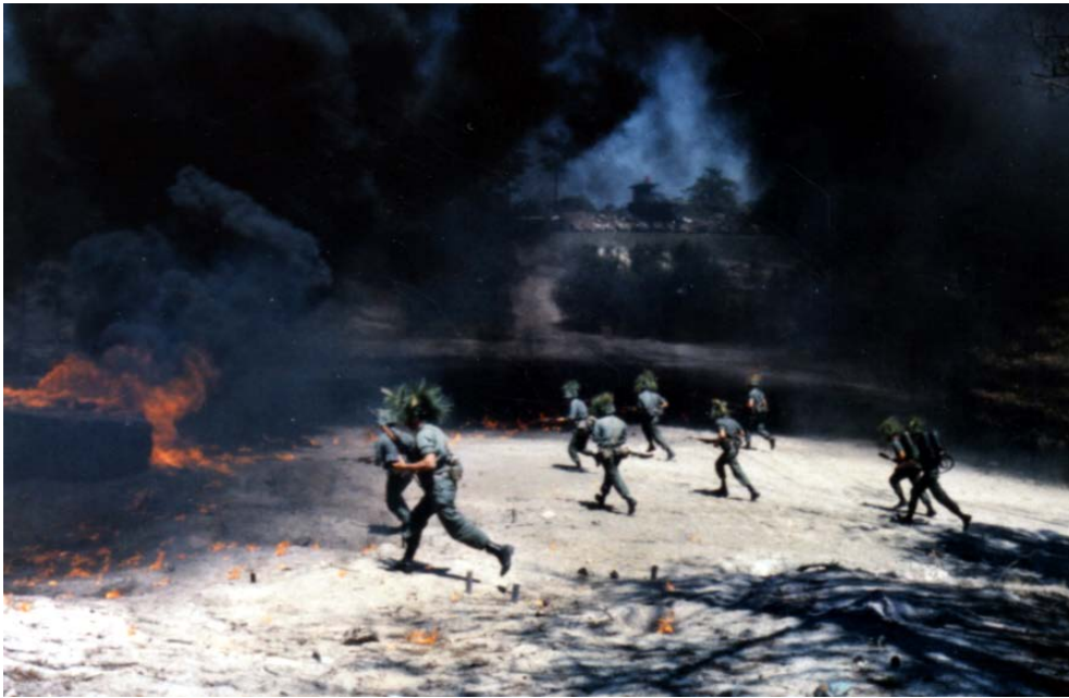
Figure 57. Marine Riflemen move in for the final phase of an assault demonstration at Camp Lejeune, North Carolina, 1969 (NARA 127-GG-601-A704412).

The majority of Marine training for Vietnam was conducted at Camp Pendleton, Camp Lejeune, or Quantico Marine Corps Base (MCB), however more specialized training was conducted at other Marine bases (Figure 58). For example, the Marine Corps Recruit Depot, San Diego, California, gained five new recruit barracks and a dining hall to more efficiently serve the trainees in 1967. In addition to recruit training, the Marine Corps Recruit Depot also offered formal courses in instructor and NCO leadership. 340