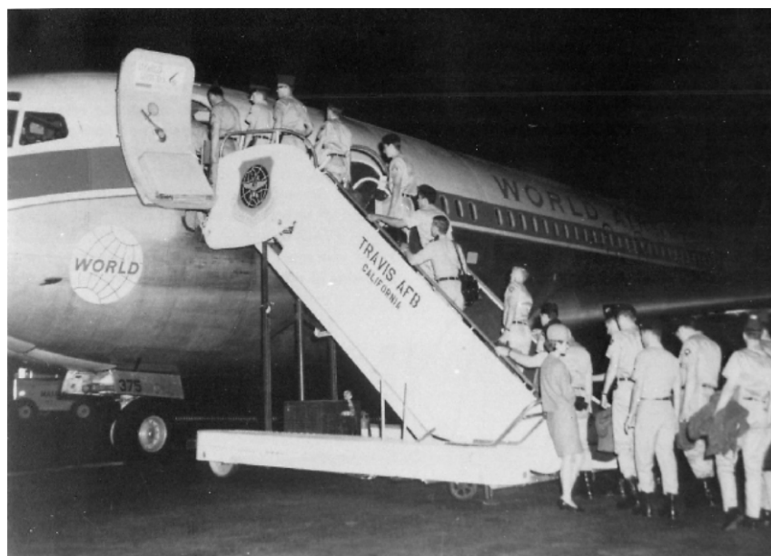
Figure 72. Army Troops board commercial flight from Travis AFB to Vietnam, ca. 1968 (60 th AMW Historian).

Travis AFB became the primary West Coast aerial port for troops and supplies heading west to support the war and for those returning to the United States. Between 1965 and 1975, Travis AFB would remain the DoD's busiest military port. Travis would provide facilities for virtually every aspect related to military airlift during conflict, including aircraft and associated maintenance structures, storage for all types of supplies in warehouses and in open areas, refueling operations, passenger facilities, cargo-handling capabilities, and the associated administrative offices. The refueling operations included support for moving fighter aircraft and B-52 bombers to the conflict zone. 453