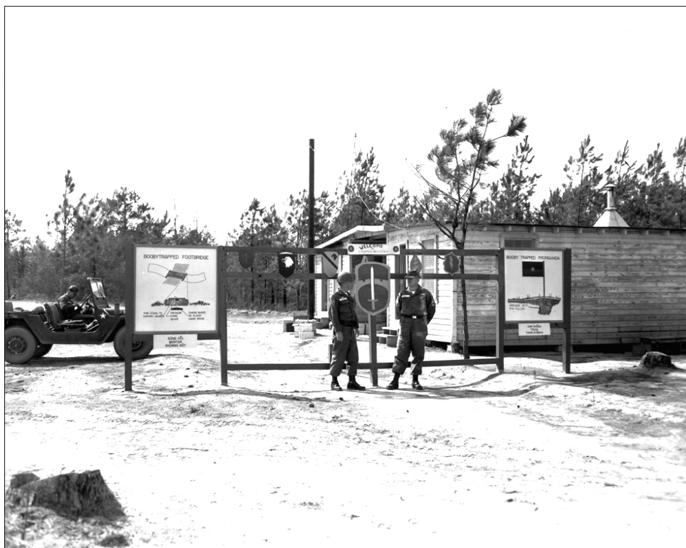
Figure 20. Counterinsurgency training at the COIN headquarters at Area 18, Fort Gordon, Georgia, March 1966.

The Civic Action Program was established as early as 1961 to encourage the utilization of indigenous forces to assist local populations with development projects that improved living conditions. Through such community building, the U.S. military developed support in localities, which helped prevent the development of insurgency. Military personnel involved with the Civic Action Program were trained at the U.S. Army Civil Affairs School at Fort Gordon. 182