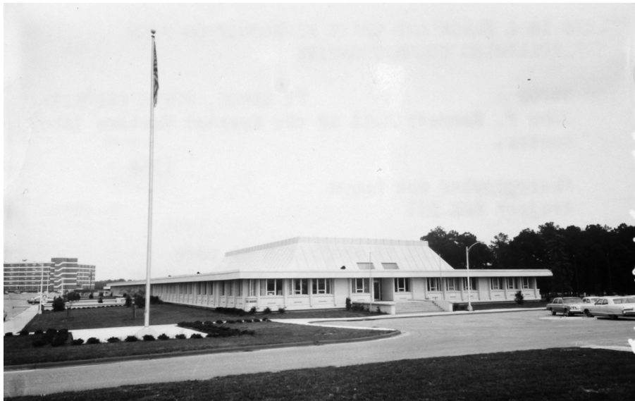
Figure 19. The newly constructed John F. Kennedy Hall at the Special Warfare Center, Fort Bragg, North Carolina, 1966.

The Special Warfare Center at Fort Bragg was expanded in 1965 to accommodate the expanded mission of the 5 th Special Forces Group (Airborne) that was activated in 1961. The headquarters and academic buildings that comprised the complex were COIN training facilities used to prepare troops to train the Republic of South Vietnam's government and military personnel to resist communist influences. 181 Figure 19 shows the John F. Kennedy Hall at the Special Warfare Center in 1966. Fort Gordon also conducted COIN training (Figure 20).