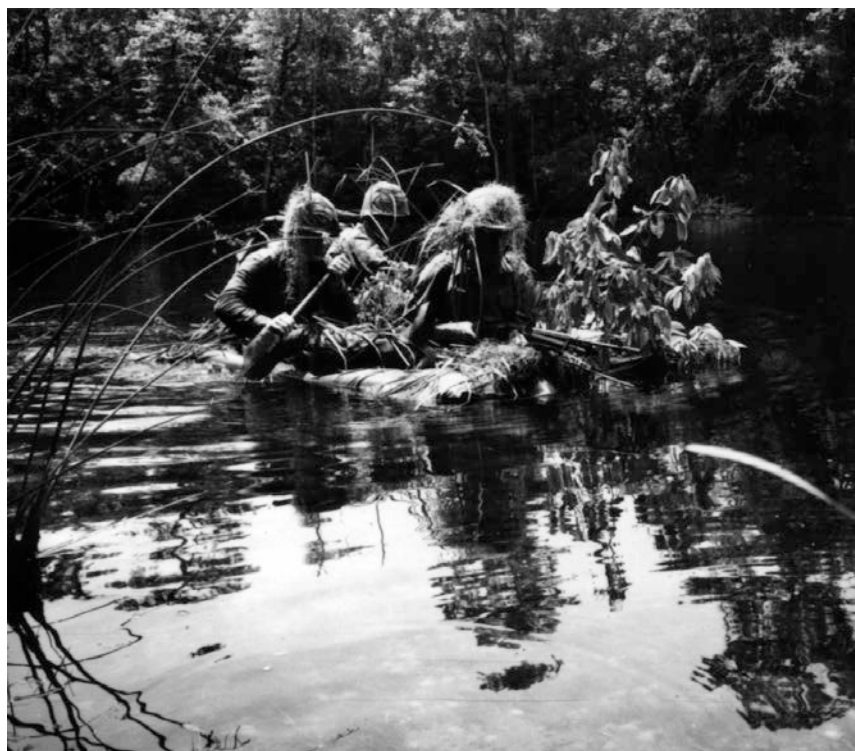
Figure 58. A reconnaissance element from “I” Company, Third Battalion, Sixth Marines crosses a stream on a raft constructed for recon type training, Camp Lejeune, North Carolina, undated.