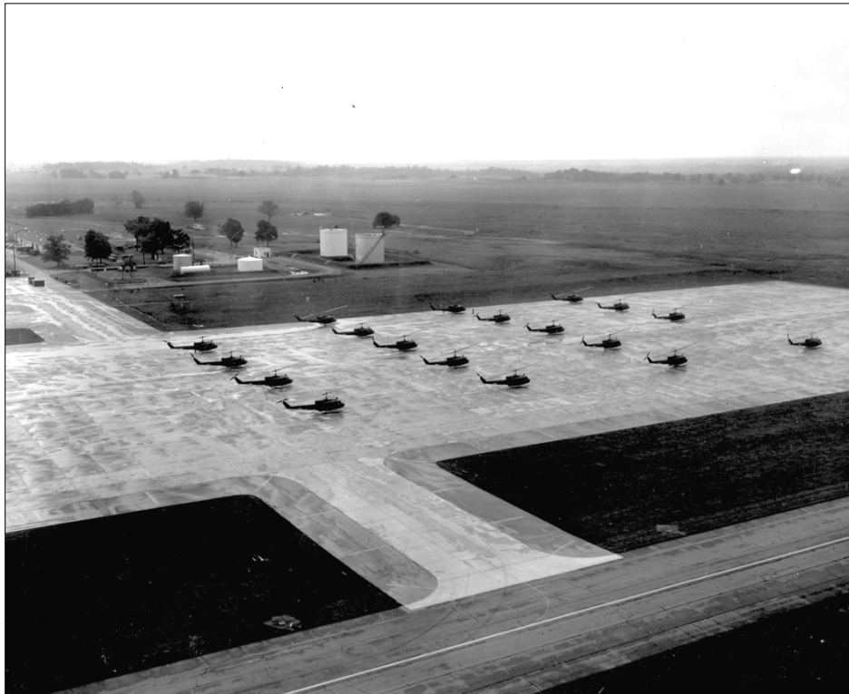
Figure 14. Apron at Campbell Army Air Field showing Model UH-1C helicopters prepared for training mission, August 1967 (NARA SC642134).

Of particular importance was the development of the helicopter schools that were part of the airmobility concept, a concept that fell under the Army's mission and not the Air Force's. The airmobility concept was the chief modification of the Army's force structure during Vietnam. Airmobility was developed as a solution to the guerilla warfare waged by the Viet Cong. Airmobility, in its broadest sense, envisaged the "use of aerial vehicles organic to the Army to assure the balance of mobility, firepower, intelligence, support—and command and control." 178 Figure 14 and Figure 15 show helicopters used in training and being prepared for shipment to Vietnam.