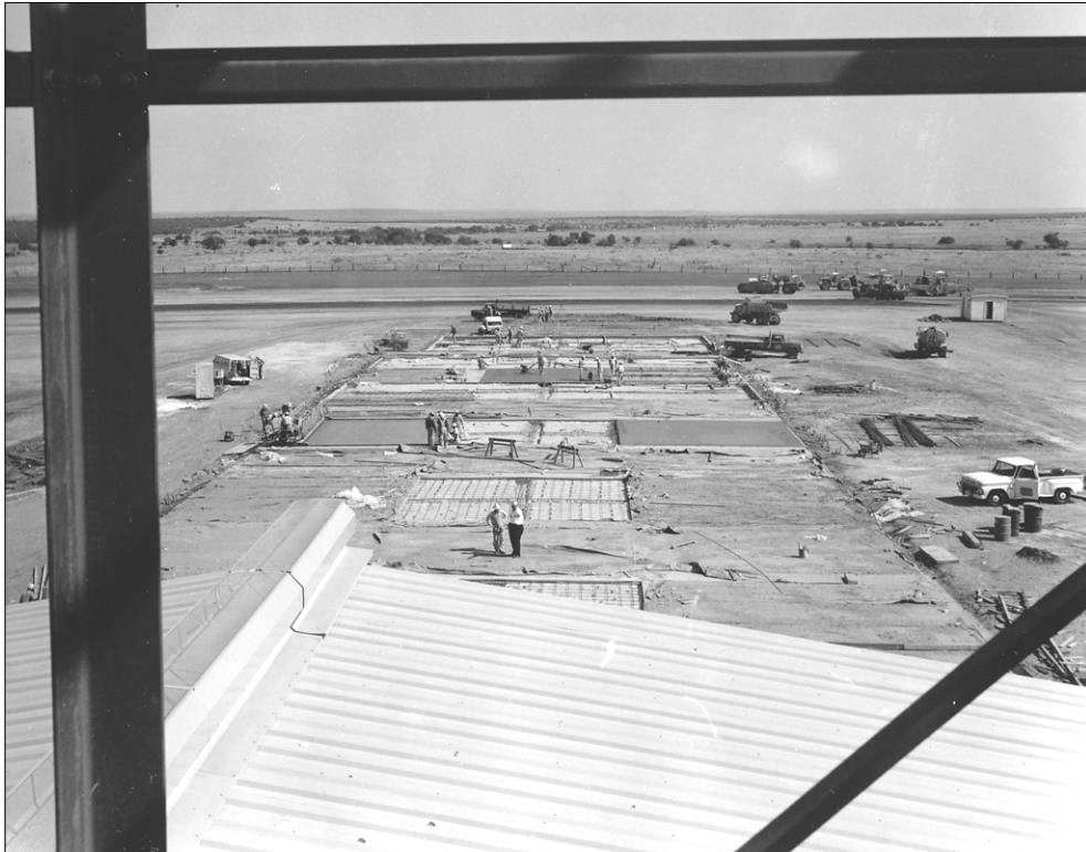
Figure 16. A view from the unfinished control tower above West Heliport's main hanger showing the construction of the north wing bay maintenance area at Fort Wolters, Texas, August 1967 (NARA SC642634).