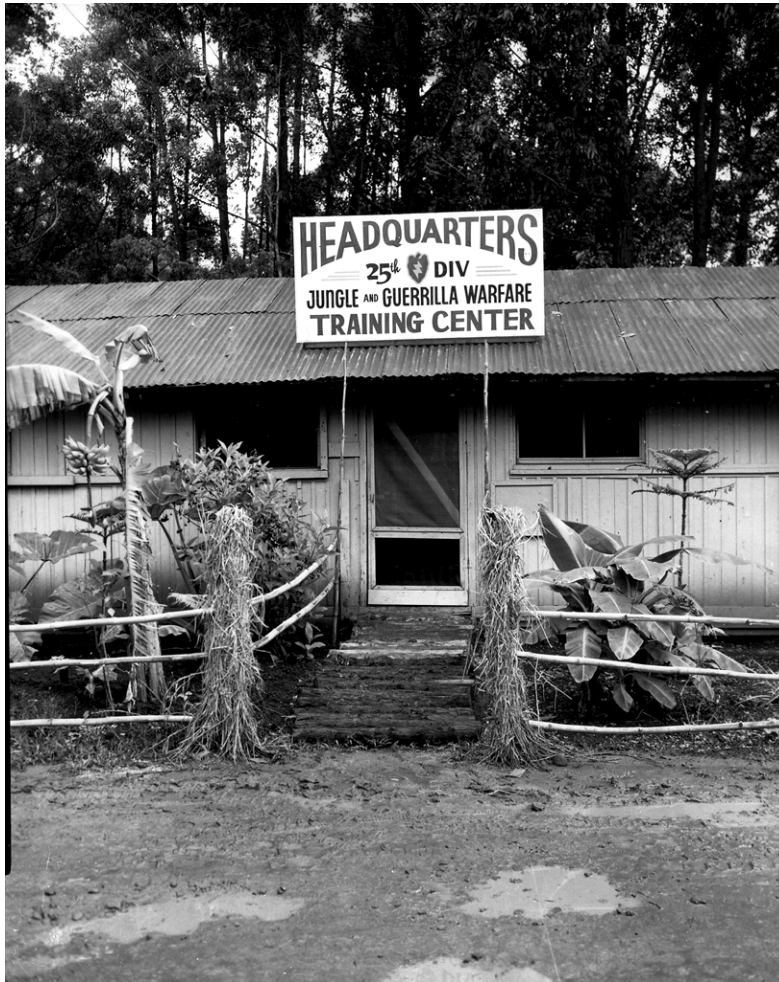
Figure 21. The Headquarters building of the Jungle and Guerrilla Warfare Training Center, 25 th Infantry Division at Schofield Barracks, Hawaii, May 1962 (NARA SC598158).

The Army's 25 th Division established a combat training center in 1941 at Schofield Barracks, Hawaii. By the early 1960s, it was the Army's premier counter-guerrilla training center where courses were taught on jungle survival, warfare, and military tactics including rappelling from helicopters and cliffs, and Asian languages. 184 The center had the appearance of many of the Army's other mock Vietnamese villages (Figure 21 and Figure 22).