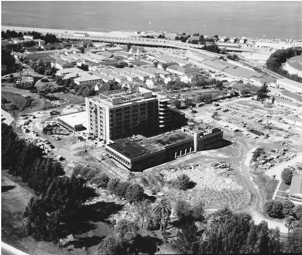
Figure 40. Aerial view of Letterman General Hospital while under construction, Presidio of San Francisco, California, March 1967 (NARA SC638361).

returning former POWs in February 1973 (Figure 41). 221 Letterman Army Medical Center was another of the centers, and it welcomed home nine former POWs in 1973. 222