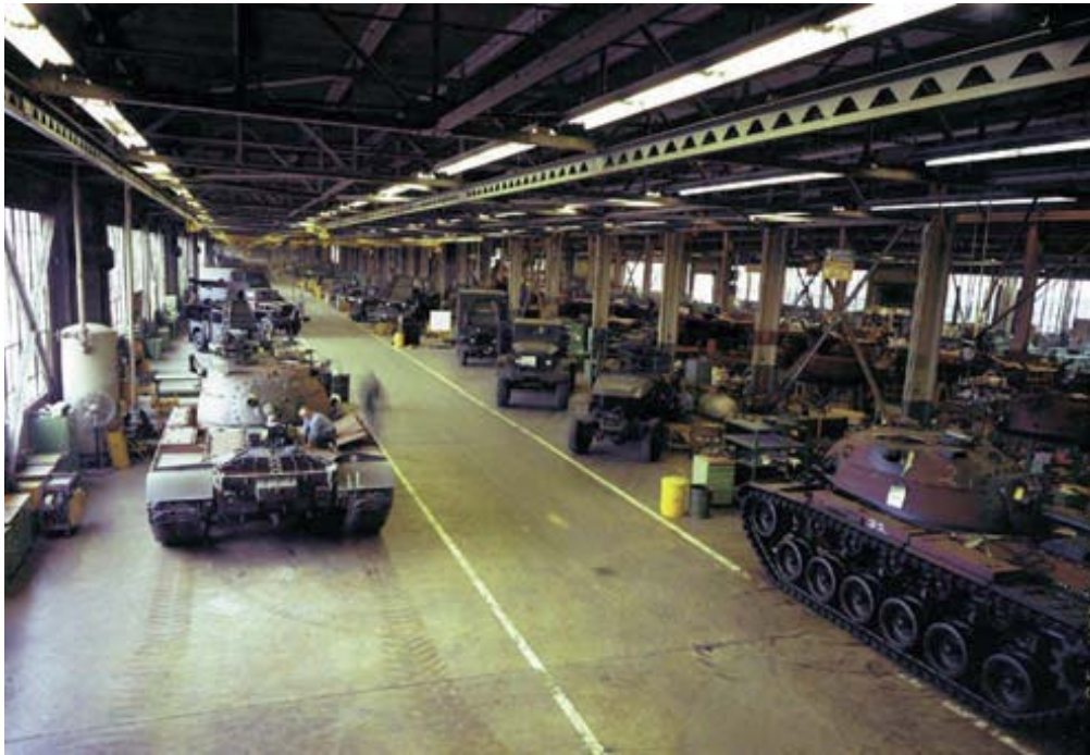
Figure 46. Tracked and wheeled vehicle refurbishment, Letterkenny Army Depot in Pennsylvania, 1960s.