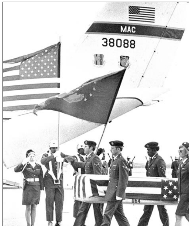
Figure 69. Return of Vietnam War dead to Travis AFB, c. 1973 (60th AMW Historian).

A grimmer duty also was conducted at Travis AFB during the war, as the base became the principal receiving station for war fatalities flown back for U.S. burial (Figure 69). According to records kept by the Travis Mortuary Affairs Office, 10,523 fallen servicemen passed through Travis AFB in 1968 alone. 428 Travis AFB served as the sole receiving station for Army war dead on the West Coast, accounting for 73 percent of the arrivals at the base. As of 1 July 1970, the Travis Mortuary Affairs Office was consolidated with those of other military services at the nearby Oakland Army Base, where all caskets arriving at Travis AFB were then transferred. 429