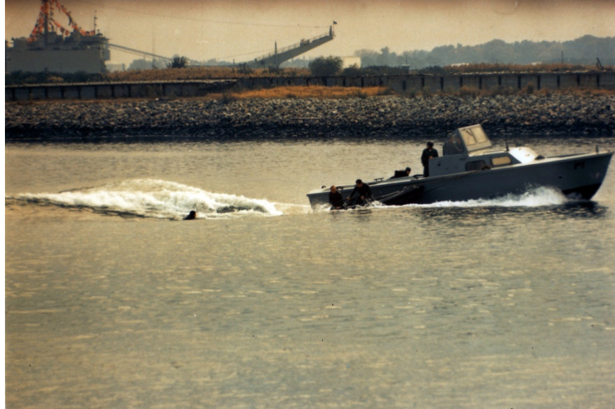
Figure 51. On Chesapeake Bay, a large personnel landing craft of Coastal River Squadron 2 tows an inflatable boat on the way to picking up a SEAL team member during riverine training, December 1973.