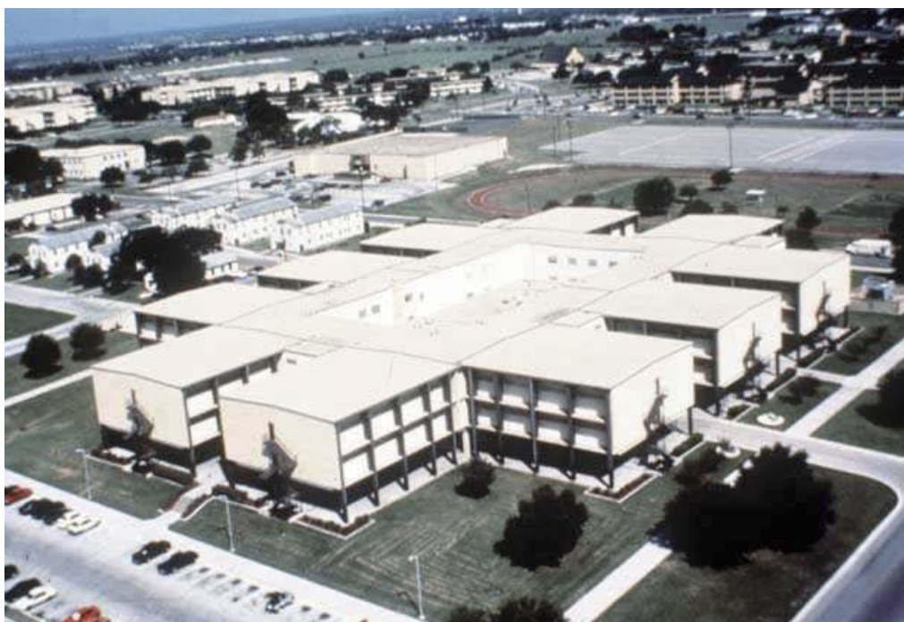
Figure 65. Recruit training and housing facility, Lackland AFB, early 1970s (37 th Training Wing).

Although not a technical training center, Lackland AFB saw nine similar recruit training and housing facilities constructed on base during the 1960s. Each building housed 1,000 personnel and included spaces for dining halls and classrooms. The buildings had 10 wings that each housed one squad of 100 recruits in open rooms with communal toilets (Figure 65). The buildings were constructed so that outdoor training could be conducted under the wings that were cantilevered over a concrete pad. 409 Even throughout the late-1960s, the Air Force continued to rely on common-room barracks because of the increase in troop levels (Figure 66).