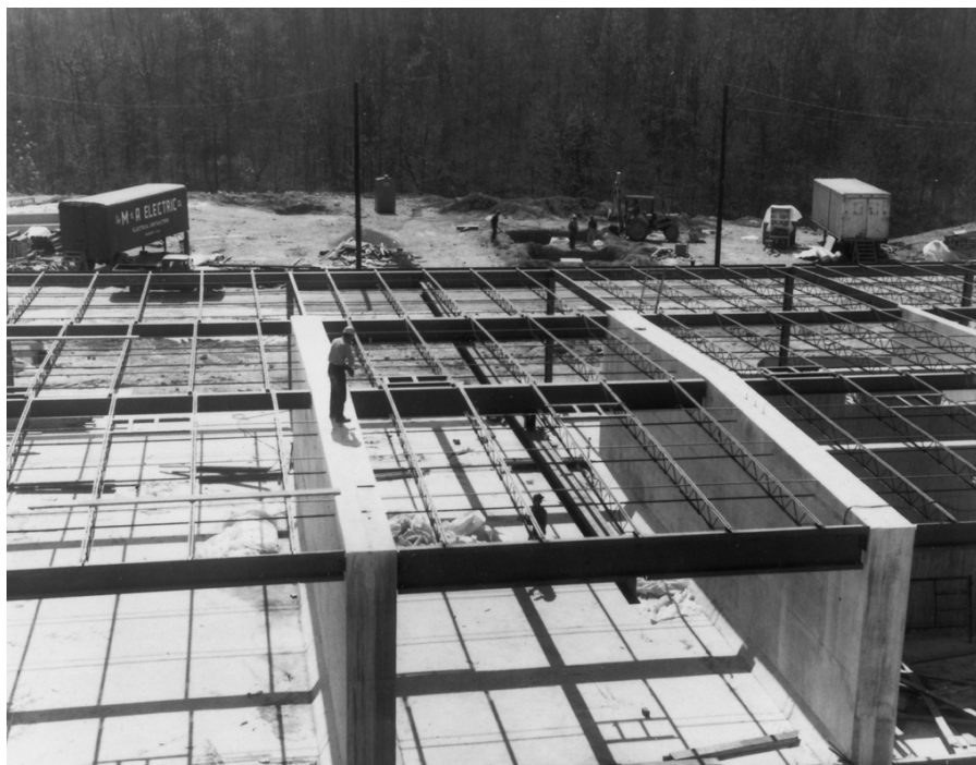
Figure 45. View of construction of Ammunition Maintenance Facility at Fort McClellan, Alabama, June 1975 (NARA SC671011).