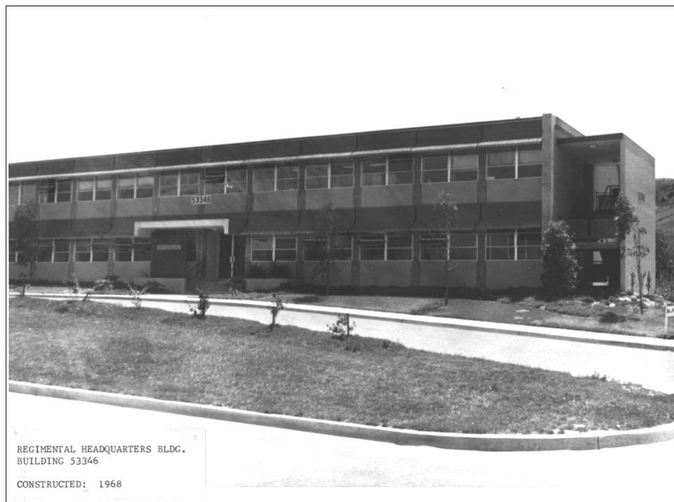
Figure 61. Regimental Headquarters-1 st Marines at Camp Pendleton, California, constructed in 1968 (Camp Pendleton Cultural Resources).

In the late 1960s, plans were approved at Camp Pendleton for a 64,000 square-foot, pre-cast concrete base headquarters building (Building 1160). Eventually costing $1.2 million, the building was located on Vandegrift Boulevard. 363 Other headquarters constructed at Camp Pendleton were the Regimental Headquarters (Figure 61).