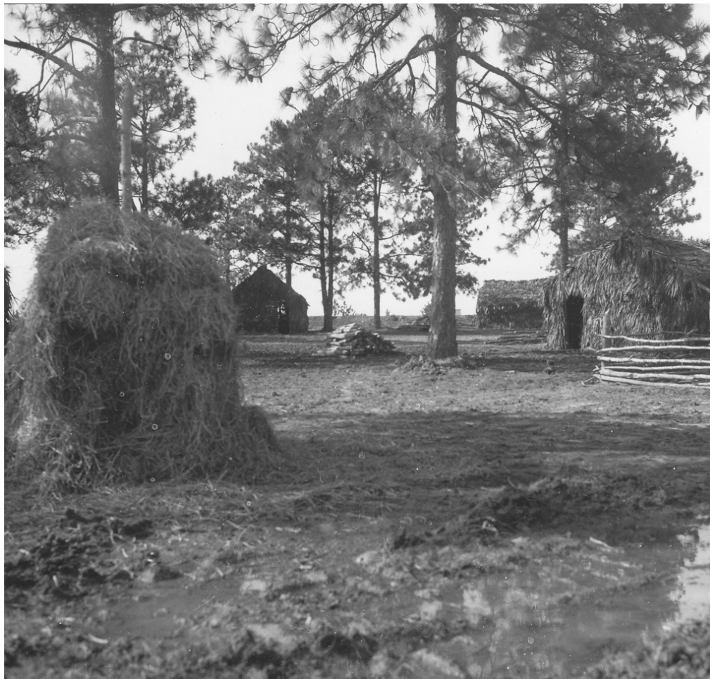
Figure 12. A purposely built mock village used in advanced infantry training at Fort Polk, Louisiana, January 1966 (NARA SC627760).

Mock villages were designed and constructed to be as realistic as possible for recruit training (Figure 12). The interiors of the mock village structures were as detailed as the exteriors. The mock village at Fort Riley also featured structures made of organic materials. Fort Lewis had a detailed mock village that featured a Vietnamese shrine along with structures clad in grass. The Fort Lewis mock village also featured hidden tunnels, wells made out of stone, and concrete and semi-permanent structures made of timbers and stone. Often, the village training area would include a mock POW camp for use by soldiers (Figure 13).