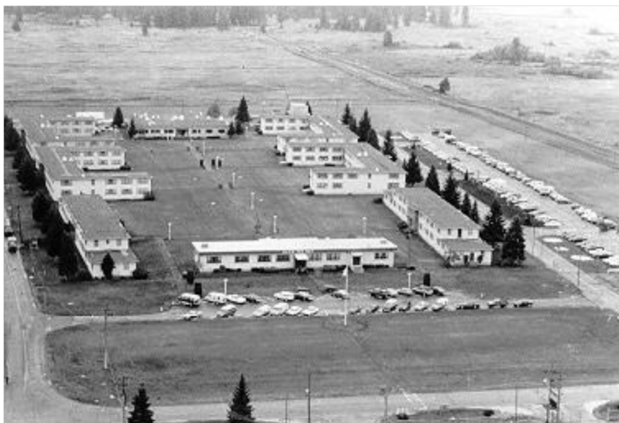
Figure 64. The USAF Survival School complex at Fairchild AFB, Washington, in 1966.

The Survival School was run by the 3636th Combat Crew Training Group (Survival) (CCTG) under the Air Training Command (ATC). The training unit was established on 1 March 1966 at Fairchild AFB (Figure 64). 399 At that time, training in survival techniques was spread over nearly 100 training schools in the Air Force. For example, in addition to the schools at Clark AFB and Albrook AFB, there was a TAC Sea Survival School at Homestead AFB, Florida. On 1 April 1971, all training was consolidated under the newly organized 3636 th Combat Crew Training Wing (Survival), ATC at Fairchild AFB, which was now responsible for the entire Air Force. 400 Curricula at the Fairchild AFB USAF Survival School included basic combat survival and survival instructor courses. A helicopter detachment was added in 1971, as the Air Force had determined that “85 percent of downed aircrews were rescued within six hours after bailout.” 401 The wing also played a role in debriefing the POWs returning from Vietnam. Once the U.S. military had left Vietnam, the ATC closed both the tropic and jungle survival schools in 1975. 402 Survival training is still conducted at Fairchild AFB.