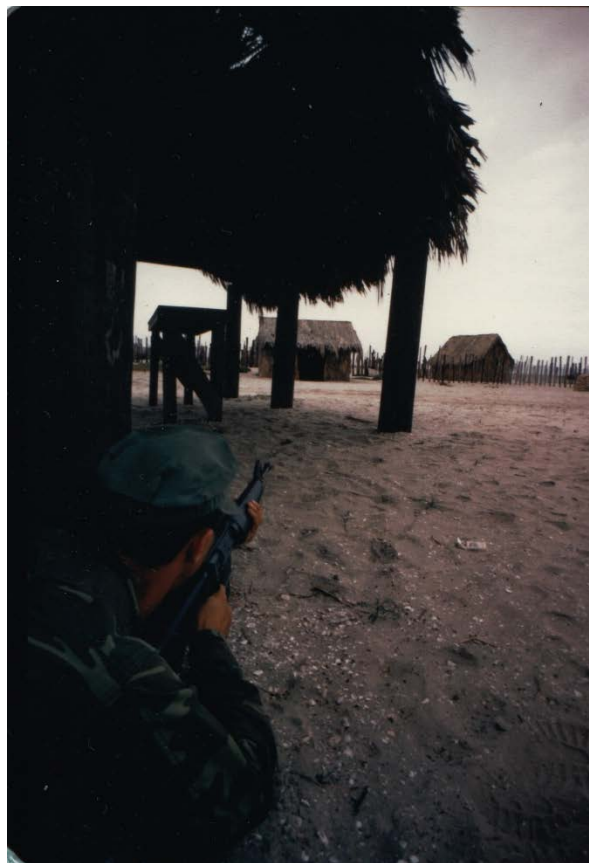
Figure 48. Thatched structures were part of Dragon Village, a Navy mock-up Vietnamese settlement used in SEAL team training exercises at Coronado, California, February 1968.

Like other military services, the Navy constructed a mock Vietnamese village for troop training. In the Navy, the mock village was used for advanced SEAL training rather than as a complement to infantry training as in the Army. Figure 48 and Figure 49 illustrate the Navy's mock village. Located on Naval Air Base Coronado, the mock village lacked the vegetated setting that the mock villages at Fort Polk featured. Nevertheless, the Navy's mock village featured permanent and semi-permanent structures made of concrete blocks or thatched grass.