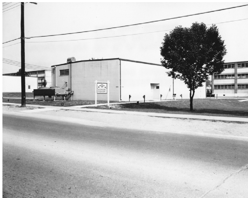
Figure 28. Exterior view of Building 6536, classroom in former barracks complex, First U.S. Army NCO Academy, Leader Preparation Course, Fort Knox, Kentucky, July 1967.

Other classrooms were located in smaller buildings within former barracks complexes (Figure 28). The U.S. Army Intelligence Center and School was moved to Fort Huachuca and located in existing buildings on the installation. As a result, the school has a variety of building types (Figure 29 and Figure 30).