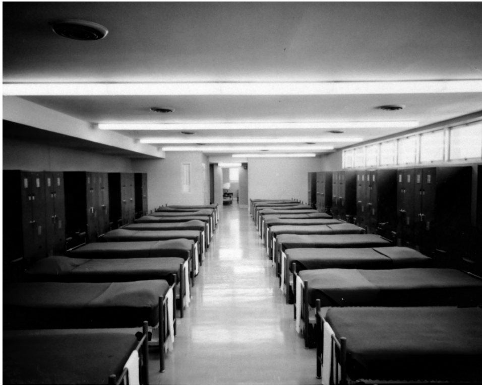
Figure 66. Interior of a common-room barracks at Lackland AFB, Texas, October 1968.

Additional construction on the east side of Lackland AFB was accomplished in 1971 when the main Base Exchange complex was built on an area where 109 WWII barracks had stood before being torn down between 1966 and 1971. On the west side of Lackland AFB, contractors built more facilities for recruit housing and training during that same time period. Gaining permanence had become a priority by 1976, as seen from the rapid removal of temporary buildings. 410