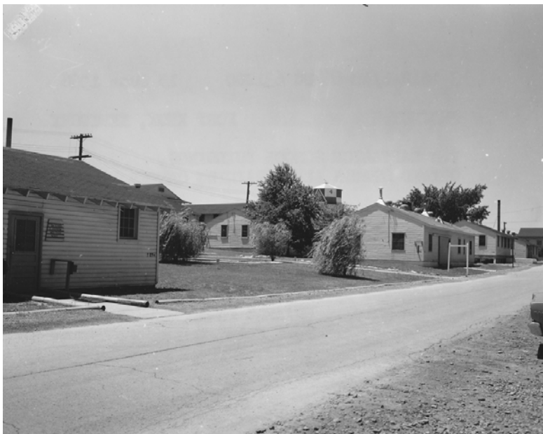
Figure 26. The 7 th Battalion School at the USATC, Armor, Fort Knox, Kentucky, utilized older buildings, June 1966.

Many schools and academic complexes were located in existing buildings even well into the 1970s. Figure 26 shows part of the complex of buildings that made up the campus of the 7 th Battalion School at the U.S. Army Training Center (USATC), Armor, on Fort Knox. Figure 27 shows a repurposed Hammerhead barracks as headquarters for the First U.S. Army Non-Commissioned Officer (NCO) Academy, also at Fort Knox.