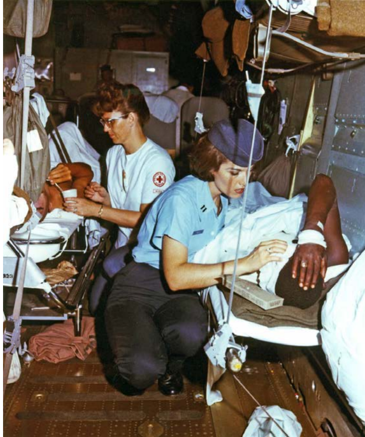
Figure 68. An Air Force nurse and a Red Cross nurse attend to patients aboard an Air Force C-141 for an evacuation flight from Vietnam to the U.S., 1967.

Throughout the war, many of these patients were either treated or transited through Travis AFB. During the Vietnam War, Travis assumed responsibility as the West Coast terminus for MAC aeromedical transports. In fact, throughout the Vietnam War, wounded troops were most often transported to Travis AFB. The spring of 1968 recorded increasing arrivals of wounded (sometimes over 5,000 per month), at Travis, with the David Grant USAF Hospital receiving an average of 4,070 patients a month throughout 1968. 425 At the height of this effort, over 9,000 patients (all injured during the February 1969 TET Offensive) were