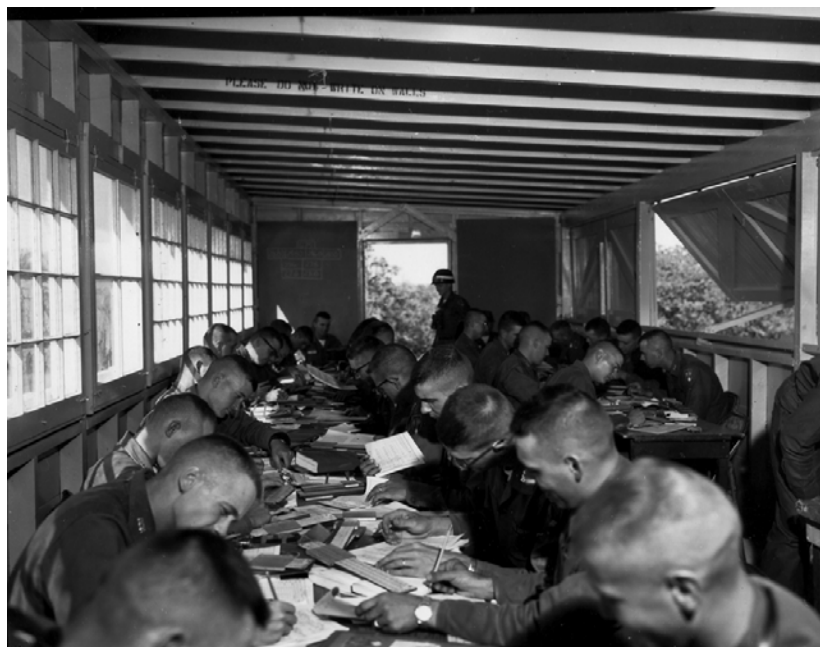
Figure 8. Soldiers trained in existing range classroom facilities at Fort Sill, Oklahoma, October 1966.

Training at outdoor ranges also included classroom work in reused buildings (Figure 8). However, classes were not always taught in classrooms; Figure 9 shows a machine gun class held outdoors. Outdoor range infrastructure also included bunkers and other shelters (Figure 10).