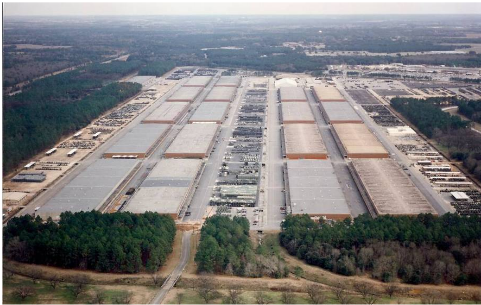
Figure 63. Aerial view of MCLB Albany warehouse area, ca. 1970 (Public Works Office, MCLB Albany).

same functions for the forces east of the Mississippi River and for the Fleet Marine Forces in the Atlantic (Figure 63). The Albany installation was commissioned in March 1952 as the Marine Corps Depot of Supplies. By 1954, construction was almost complete with the requisite warehouses and administration buildings, and supply duties began. In 1967, new activities were added—a Storage Activity and a Depot Maintenance Activity. The base played a role in professional education, training Marines in maintenance and supply tasks through formal courses. 373