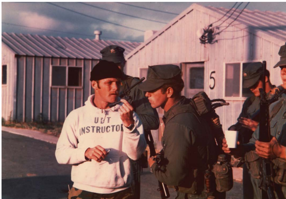
Figure 50. An instructor explains the method of firing the M-16 rifle to students of the basic underwater demolition SEAL training class at Naval Air Base Coronado, California [note prefabricated metal buildings in the background], March 1975 (NARA RG 428-GX Box 414 K108118).