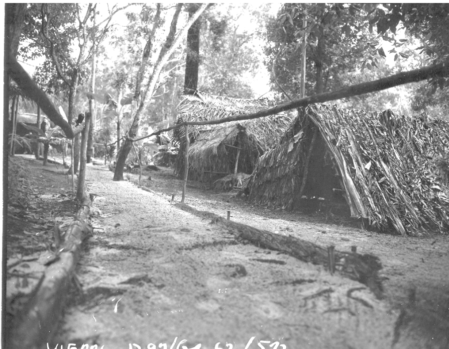
Figure 22. Station 3, Field craft and shelters at the Jungle and Guerrilla Warfare Training Center, Schofield Barracks, Hawaii, showing types of shelters, May 1962 (NARA SC598166).