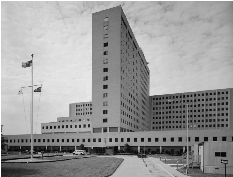
Figure 53. Portsmouth Naval Hospital, Virginia, 1960.

Navy hospitals were started at Long Beach and Oakland, California, and at Jacksonville, Florida. 305