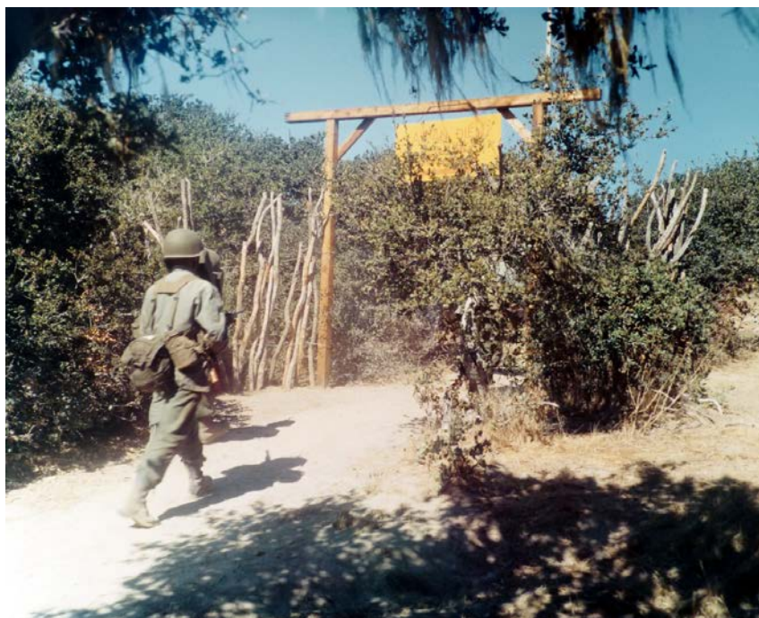
Figure 11. Training at the man-to-man training area at Fort Ord, California. The men used BB guns on the defense and on the attack, September 1969.

Fort Devens, Massachusetts, had a mock Viet Cong village for training that was integral in the training conducted there. The training focused on enemy tactics, booby traps, and the locations of weapons in the training area. The mock village was set up by the Army Security Agency.