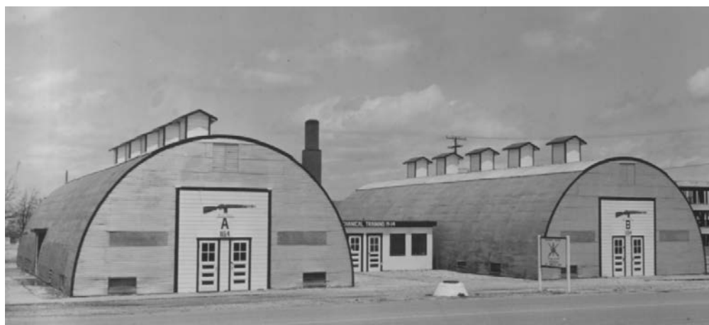
Figure 5. Early 1960s Mechanical Training building, utilized for classroom weapons training, Fort Leonard Wood, Missouri, April 1966 (NARA SC632484).

The increasing demand for troops in Vietnam led to rapid expansion of the Army's basic combat training infrastructure. Although there was a rapid