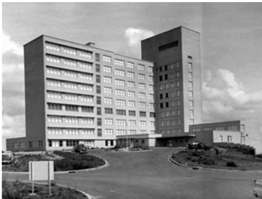
Figure 70. Wilford Hall Medical Center, Lackland AFB, Texas, 1957.

The 100-bed hospital at Travis AFB was opened in 1949, and it expanded during the Korean War with a new wing and 200 more beds. The Vietnam War brought more hospital expansion to the newly christened David Grant USAF Hospital at Travis (Figure 71), with another addition built during 1966–1967. This $700,000 project included a new dental clinic and about