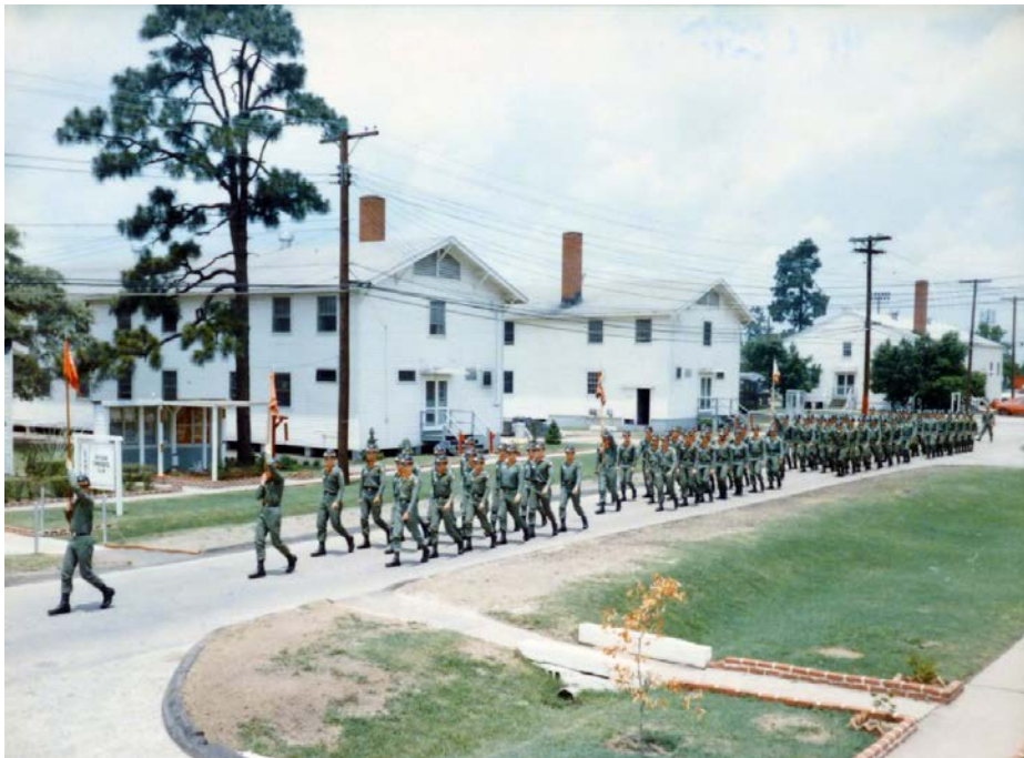
Figure 32. Training activities at Fort Gordon, Georgia, showing reused WWII temporary buildings in the background, June 1966.

The reuse of WWII barracks was common throughout the Army, even as barracks modernization campaigns were underway (Figure 32). These new barracks complexes usually included a brigade headquarters building, a battalion headquarters building, company administration buildings, barracks, classrooms, mess halls, a chapel, a branch PX, a branch medical clinic, and a gymnasium (Figure 33).