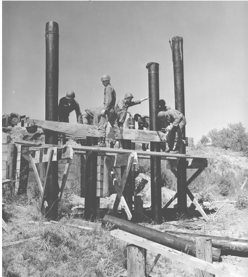
Figure 6. Men of the 7 th Engineering Battalion, 5 th Infantry Division at Fort Carson, Colorado, construct a wood bridge across a stream bed as part of their training exercises, June 1962 (NARA SC593621).

As stated previously, rifle marksmanship was adapted to train troops to rapidly shoot at objects in close proximity, instead of the distance approach previously utilized. Rifle ranges were reconfigured for this technique. Reconfigurations were reflected with construction of more-refined range control tower structures (Figure 7), and some featured wide-angle views.