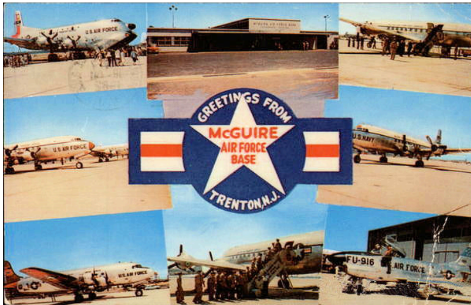
Figure 74. Early 1960s card showing MATS transport on the airfield at McGuire AFB, New Jersey.

McGuire AFB, New Jersey, was the East Coast partner to Travis AFB in terms of troop and supply transport roles during the Vietnam War, serving the 21st Air Force. 462 McGuire AFB transported troops and supplies to South Vietnam in vast quantities, and it was the largest air port on the East Coast (Figure 74). In 1973, POWs from North Vietnam were airlifted to McGuire AFB.