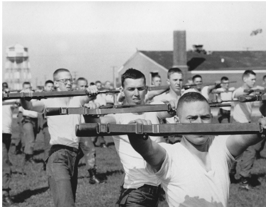
Figure 4. Trainees undergo physical training with a rifle at Fort Campbell, Kentucky, September 1968 (NARA SC646960).

The challenges presented by the conditions in Vietnam heavily influenced how the Army trained, equipped, and deployed its forces. For example, the emergence and reliance on aviation technology through the use of