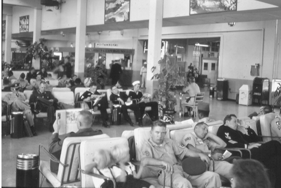
Figure 75. Passengers awaiting transport, air terminal, Travis AFB, California, 1960s

States made use of the facility. A 20,000 square foot addition was constructed in 1967, and the administrative and passenger check-in areas were remodeled that same year. A cafeteria was opened in the terminal in 1968, and a base exchange was opened across the corridor in 1970. 463