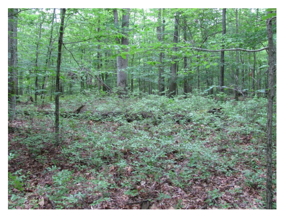
Blueberry in archaeological site in Training Area 6B (Quantico 2010); also a highly utilized species by Native Americans.

Late Woodland archaeological site in Training Area 6B on Quantico (2010); high importance of white oak in the forest canopy. This site is located on a hilltop which could have been a fortified settlement during a time of warfare.