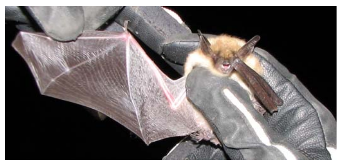
State Sensitive Fringed Myotis ( Myotis thysanodes) caught 12 miles from Dugway Proving Ground.

The DoD, as part of a collaborative partnership of 14 individual public, private, state, federal, and commercial organizations sought to identify the distribution, quantity, and quality of existing data on bats in Utah. That goal was a critical step in achieving the overarching objective of ensuring the conservation and management of bats in Utah. Currently no species of bat is considered threatened or endangered and it is hoped that through sound science and conservation measures federal listing can be precluded. Additionally, a firm understanding of occurrence on DoD lands augments sustainable range initiatives through DoD.