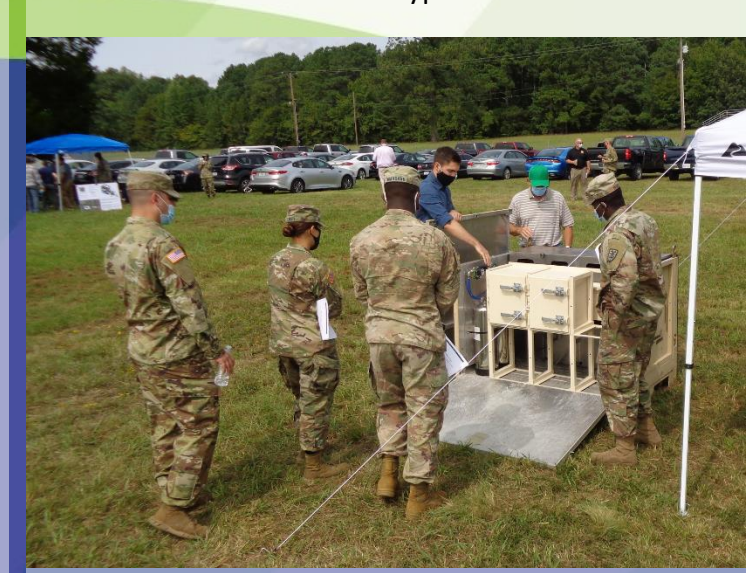
Soldiers being trained on the CLASSIC Prototype at the Army Maneuver Support Sustainment and Protection Integration Experiments (Blackstone Army Airfield, Sept. 2020)