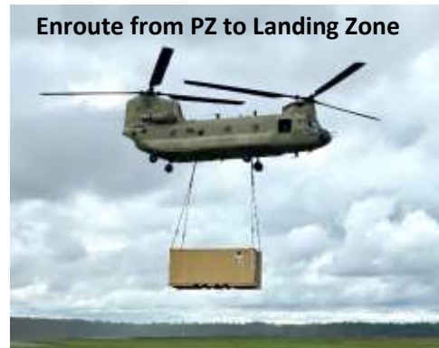
Figure 4. Emplacement modes demonstrated for AR3P (via PLS) and AR3P conex replica (via CH-47F)