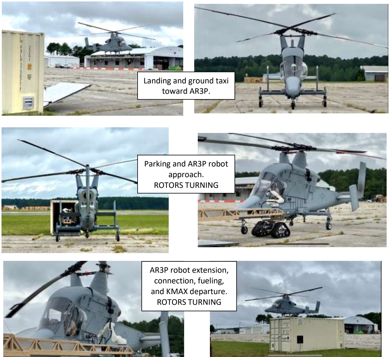
Figure 5. K-MAX Hot Refueling Sequence

Video (unlisted YouTube video): https://youtu.be/GJz3FbsH2lw .