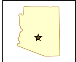
Figure 1-1 General Location of Papago Park Military Reservation