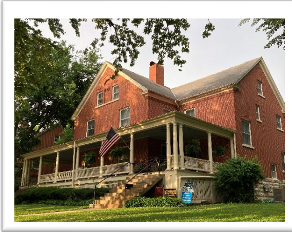
Fort Leavenworth, KS