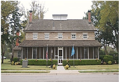
Fort Sill, OK