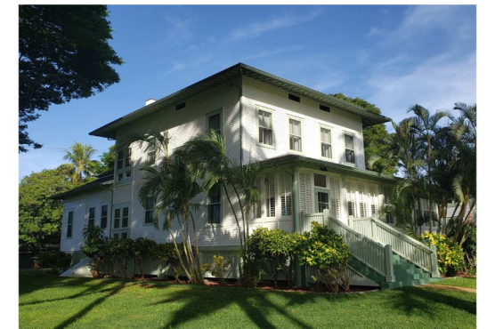
Fort Shafter, HI