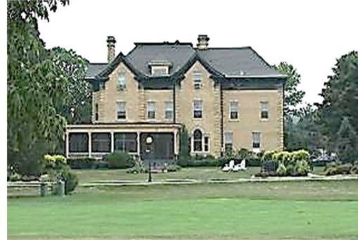
Rock Island Arsenal, IL