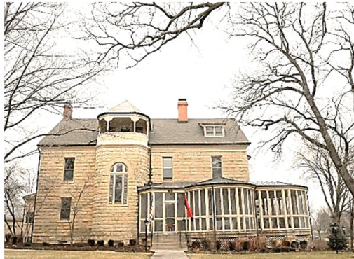
Fort Riley, KS