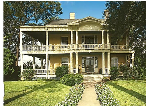
Fort Sam Houston, TX