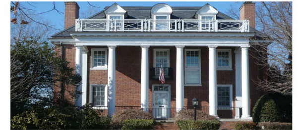
Fort McNair, DC