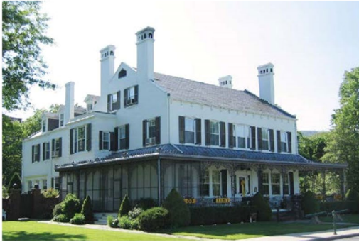
West Point, NY