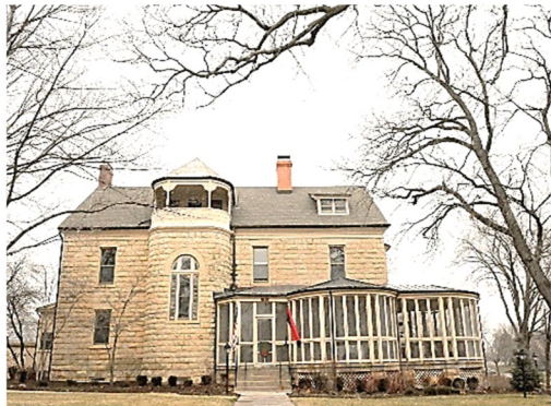
Fort Riley, KS