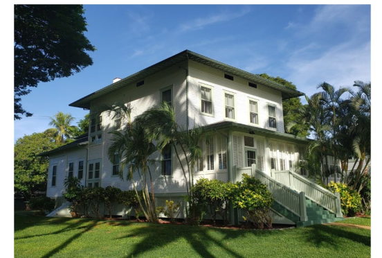
Fort Shafter, HI