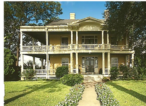
Fort Sam Houston, TX