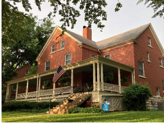
Fort Leavenworth, KS