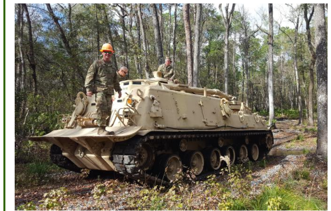
Effective military training and civilian hunting often requires the use of unpaved trails that cross watercourses. Camp Blanding receives 100% funding from Florida's state wildlife agency to support projects to armor sensitive creek crossings on unpaved trails throughout the installation. This collaborative project reduces erosion and negative water quality impacts to aquatic imperiled species from vehicles during water crossings by military trainers or civilian hunters.

applying the material to water crossings where off-road training and recreation occurs. In FY17, over 8200 tons of the material was provided to treat 55 stream crossings; in FY18, FWC provided 2968 tons to treat an additional 12 locations. The armoring has greatly improved these areas throughout the training site--water moves over the surface but does not displace the stone material, even under hurricane conditions. The success of these projects have led CBJTC to revamp armoring practices, opting to replace culverts with roads reinforced with railroad rock. The installation is working now with FWC to complete the FLARNG's portions of a nationwide bat survey along dedicated transects. NRC staff and FWC staff conducted cooperative surveys this summer, sharing equipment, and kicked off the statewide survey effort by inviting the neighboring state park staff to participate.