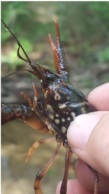
The declining black creek crayfish is found only in the clear streams of Camp Blanding and its immediate surrounding lands. One of the many species covered by the installation's CCAA, the crayfish is surveyed yearly as part of ongoing surface water quality monitoring. This monitoring is also used to assess stream and wetland health as part of Camp Blanding's requirements under the CCAA.

CBJTC is home to the Black Creek crayfish, a state-listed imperiled aquatic species known only to exist on post and its immediate vicinity. As part of conservation of the crayfish and the installation's roads and infrastructure, the NRC program has been working with FWC to armor roadways and water crossings, a task that is particularly important with the incidence of major storms and hurricanes. Washouts of roads, culverts, and bridges create high levels of sedimentation and turbidity in CBJTC's streams, and crayfish rely upon clear, highly oxygenated water. FWC has been supplying the installation with railroad rock, granite material that will not impact water pH; NRC staff have been