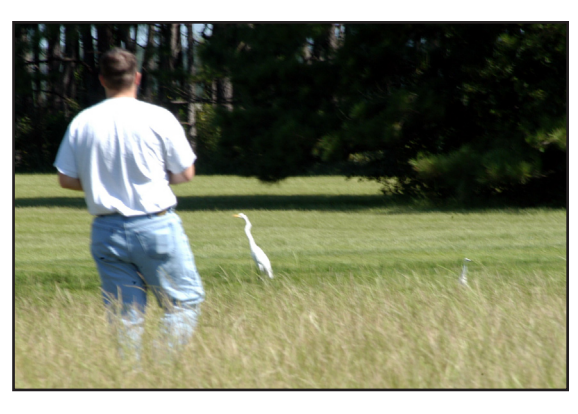
▲ The USDA Wildlife Biologist during a species survey.

The USDA wildlife biologist, in conjunction with Columbus natural resource personnel, conducted deer and avian wildlife surveys. A survey of species of concern (including federally listed, statelisted and special status species) and their habitats will be conducted by Mississippi State University in 2004. The surveys will facilitate proper protection and habitat management for these species and also provide indicators of the biodiversity that exist on Columbus AFB. A state-of-theart database is being developed to record species observations from these surveys and to calculate species per acre and total populations. The numbers obtained from the deer surveys will help manage deer herds to maintain viable populations