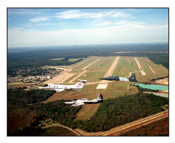
▲ T-37, T-38, and T-1 aircraft fly over Columbus AFB.