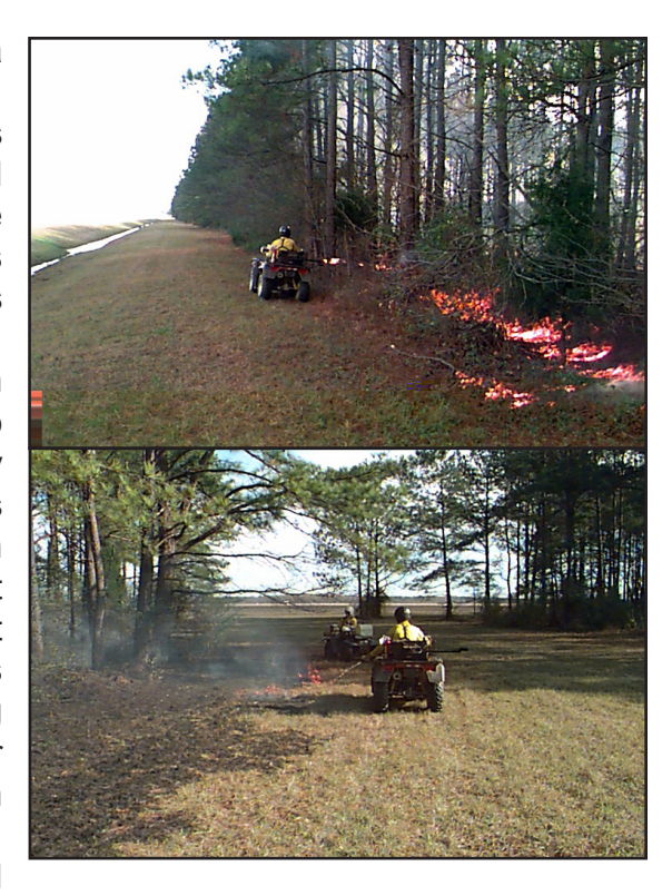
▲ The first prescribed burn was conducted at Columbus AFB in 2001.

repair, drought tolerant landscaping, water efficient boiler/steam systems and cooling tower management to minimize water loss. These practices resulted in a 21 percent decrease in water consumption between FY00 and FY02.