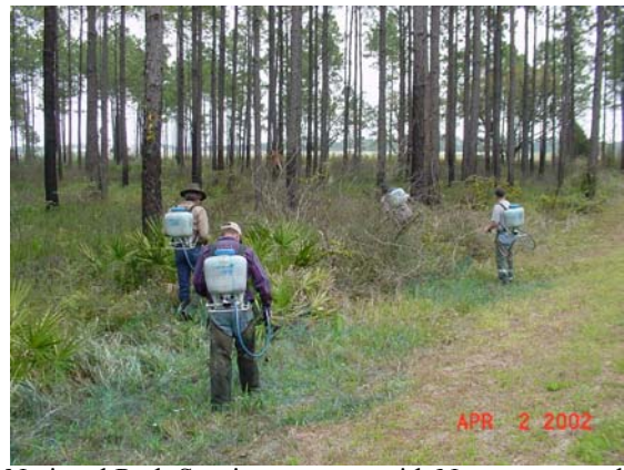
National Park Service partners with Navy to control cogongrass and other invasive species.