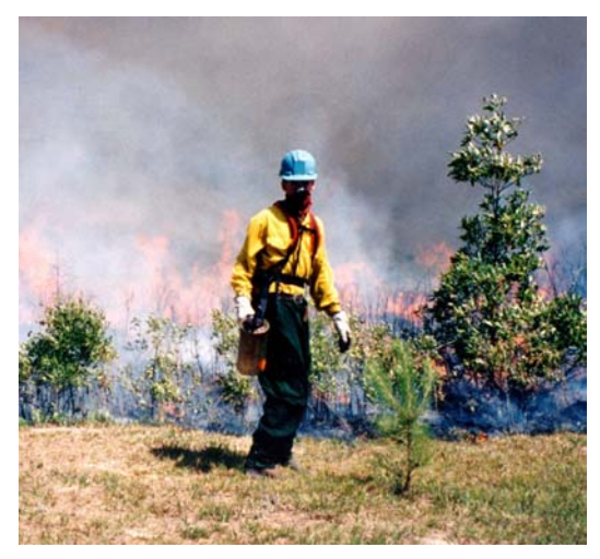
Navy SCA Student supporting Regional Ecosystem Restoration Prescribed Burn at Garcon Point Preserve.