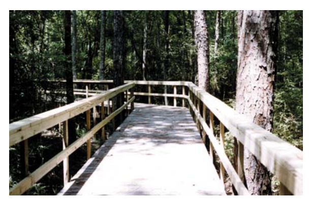
Constructed 300' Nature Trail Boardwalk for public-use NR Education and recreational fishing; designed by SCA students and built in-house using NR funding.