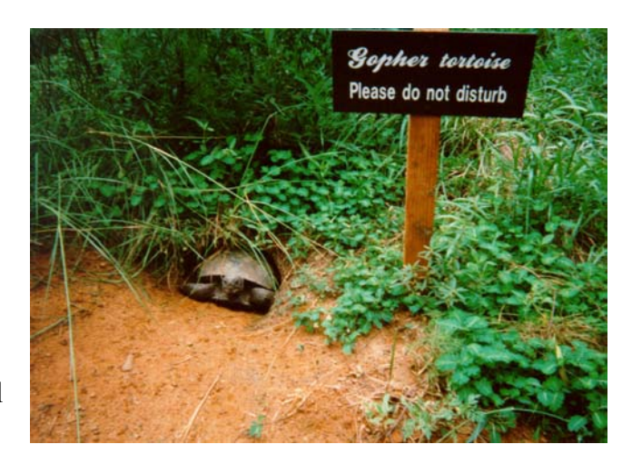
The Gopher Tortoise, a "keystone species" in the regional ecosystem, enjoys protection and exclusive habitat on Navy lands. Over 100 active burrows support a thriving population.