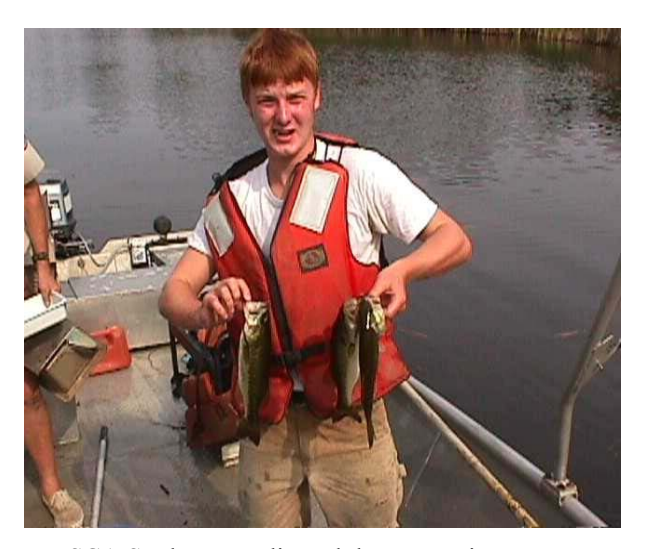
SCA Student coordinated the renovation and improvement of the Lake Frederic Freshwater Fishery.