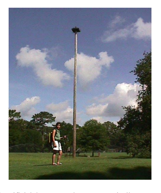
19 artificial Osprey nestboxes strategically located reduced BASH problems and significantly increased area Osprey population.

Honeybee Swarm Removal: 100+ swarms removed and saved from buildings and aircraft without using pesticides.