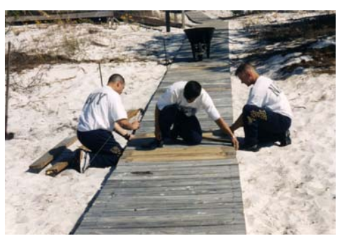
Navy Enlisted Students volunteering