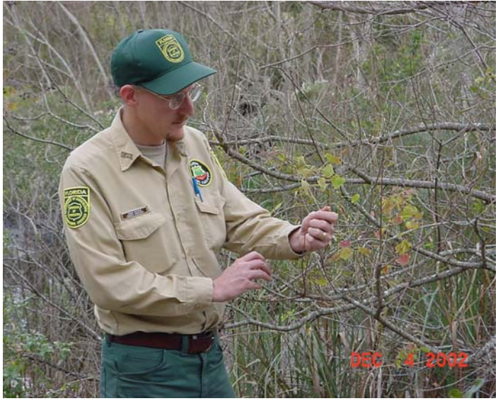
Florida Division of Forestry inspects effectiveness of Invasive Species Control for Chinese Tallowtree