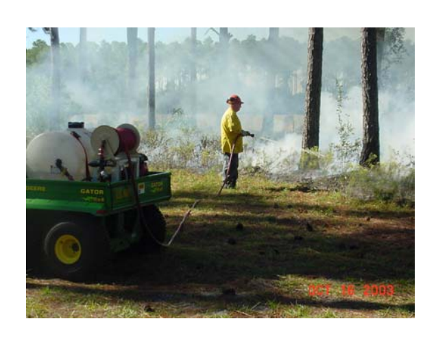
Prescribed Burn at Corry