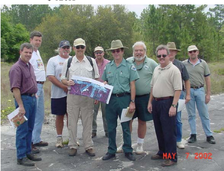
Navy, Florida Department of Environmental Protection, and Florida Park Service determine Land Management alternatives at NOLF Bronson, adjacent to the Pitcher Plant Prairie 7,000 acre preserve