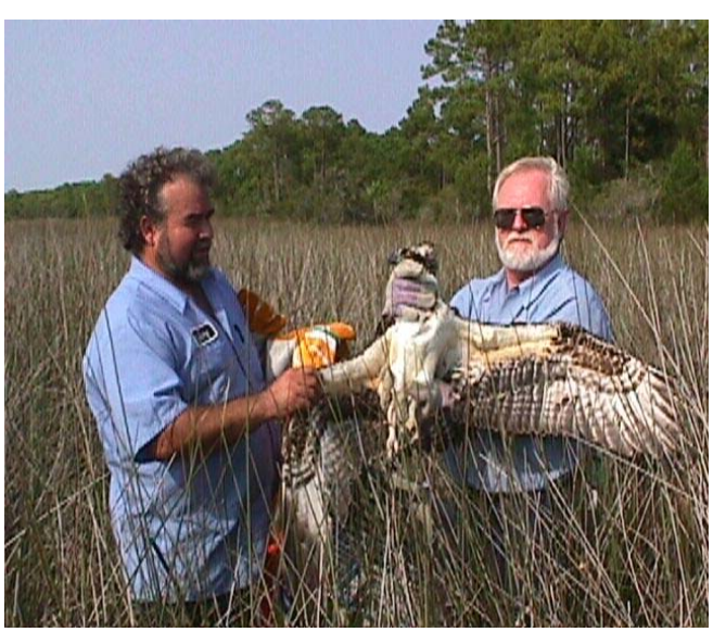
Osprey rescued by Navy Public Works Center from entangled fishing line (NAS Pensacola).