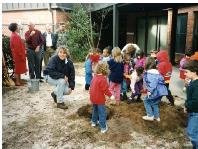
Tree Planting at Child Development Center