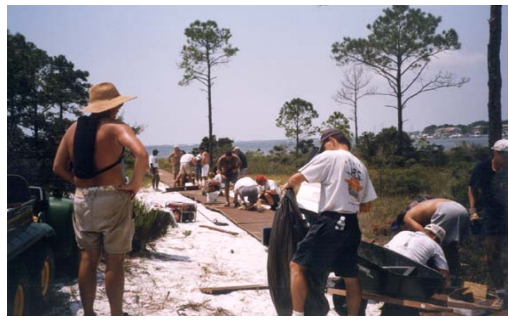
Navy Chiefs construct 500' extension to Trout Point Nature Trail; expanding public-use and handicapped access.