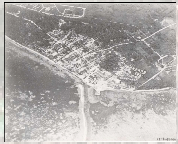
This aerial photo of Sumay was taken in April 1921.