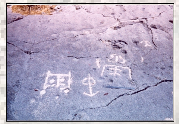
Pictographs at Dangkulo Unai, Tinian

The most significant contribution to the Navy's mission during the past three years has been the completion of numerous cultural resources surveys on the various Navy properties throughout the Mariana Islands. These surveys, and individual cultural resources management plans were conducted in association with the Environmental Impact Statement for Military Training in the Marianas . This EIS has allowed the military to carry out their vital training exercises without impact to the cultural, historic, and environmental resources in the islands.