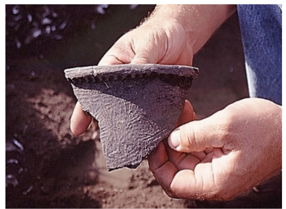
A Native American shard recovered during the rifle range survey.

utility lines, and the construction of storage sheds and range control rooms. All work was planned to avoid archaeological sites and was coordinated with the SCSHPO and interested American Indian tribes. The renovation greatly improved the efficiency of the range where permanent personnel re-qualify and where each year some 20,000 male and female recruits receive training on the M16A2 service rifle.