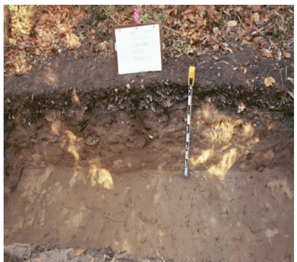
Test pit showing human habitation on Horse Island during the survey for the recycle center.

building that encroaches on an African-American cemetery. The removal of this building will then allow the Depot to more properly preserve and protect the cemetery.