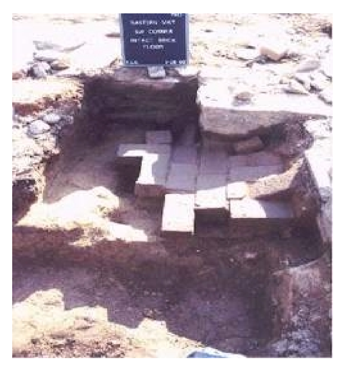
Sign Reads: Marine Barracks Eastern Market SW Corner Intact Brick Floor