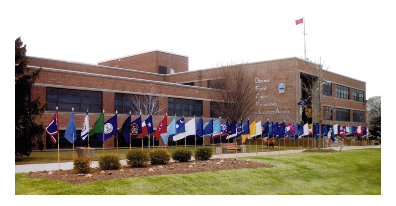
Defense Supply Center Philadelphia