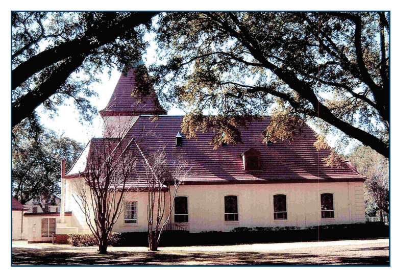
Chapel 1 in the Barksdale Field Historic District is a unique element with its French Village Chapel charm, has retained much of its original architecture from 1934.

Annual evaluations are performed by the CRM on both current NRHP registered historic facilities for maintenance and care and potentially eligible facilities as they reach the appropriate age for consideration. For this nomination period 24 structures have been evaluated for consideration; however, none have been deemed meeting the other eligibility requirements.