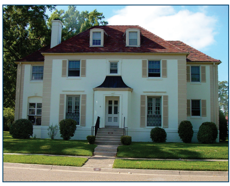
121 Shreveport Rd, typical of the historic housing units now owned by the privatized housing owner, have retained their original appearance since construction from 1933 to 1935.

The 11th Bomb Squadron HQ, originally built in 1934, has gone through several successful Section 106 consultations. These consultations resulted in the replacement of window and entryway details due to deterioration. Efforts were also made in the design and construction oversight to ensure that the new products reflected the original details.