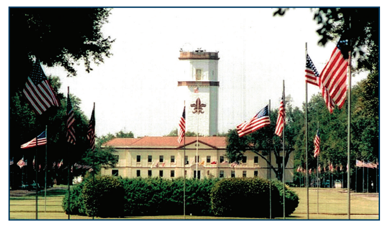
The base flag pole, HQ 2d Bomb Wing and the water tower in the background are key elements of the Barksdale Field Historic District. All three buildings were constructed in the 1933 timeframe and have had minimum modifications made to them over the years. Careful consideration of the historic nature of the structures and a close relationship with the SHPO through Section 106 consultations have ensured history is preserved.

Barksdale AFB has gone through significant changes over the last several years with the stand-up of AFGSC. Preserving the Barksdale Field Historic District has been the major forefront of all construction, renovation, and demolition initiatives, and new construction has largely been confined to areas adjacent to the large historic core. Six key historic facilities in the district have undergone major renovations to facilitate the beddown of the AFGSC. The scope of the renovations required bringing all of the buildings in compliance with the Americans with Disabilities Act, driving a requirement to construct the additions of elevator towers on all of the buildings. It also required bringing all of the buildings up to Anti-Terrorist/Force Protection standards. Both of these requirements