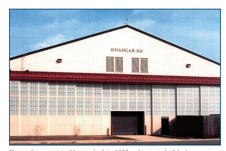
Hangar 9 is an original hangar built in 1933 and is typical of the hangars in the Barksdale Field Historic District.

Barksdale Field Historic District's Chapel 1 has retained much of its original 1934 architecture. Successful Section 106 consultations facilitated the replacement of the original clay tile roofing with new, better glazed clay tile to enhance the durability of the color and product. SHPO approved design upgrades were made for handicap accessibility with the installation of ramps to the main entrance.