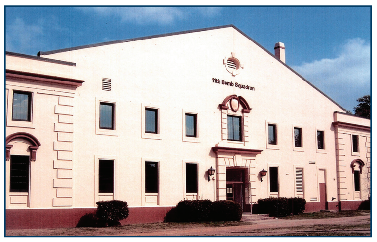
11th Bomb Squadron HQ was originally built in 1934 and is a key building along the primary axis of the historic district.

Cultural resource awareness and community relations is paramount to ensure the historic beauty of the base is maintained and all personnel involved are fully aware of the importance of being good stewards to the Barksdale Field Historic District. The CRM, through both group sessions as well as individually working with project managers and maintenance supervisors, ensures that all are aware of the requirements and provisions of the existing Barksdale Field Historic District programmatic agreement.