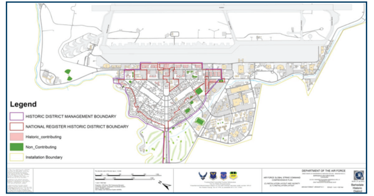
Barksdale Field Historic District Map. The majority of the main installation area consists of the Barksdale Field Historic District. Contained within this historic district are 229 housing units and 43 administrative and industrial facilities.

Barksdale AFB encompasses 21,945 acres of developed and forested land in the Bossier City-Parish Metropolitan Statistical area of Northwest Louisiana. It is supported by 16,424 civilian, contractor, and military personnel (active and reserve). Barksdale AFB also serves as a support base to more than 40,000 military retirees living within a 100-mile radius of the base