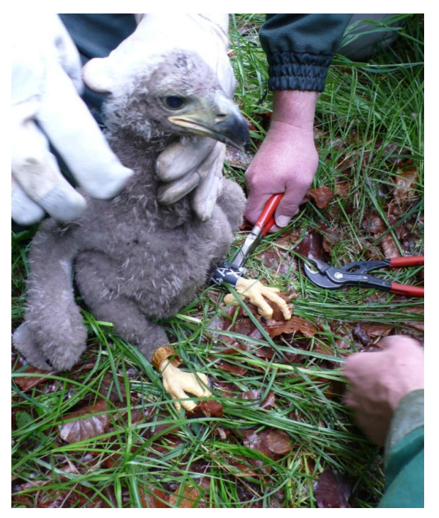
Workers band a white-tailed eagle thriving in Grafenwoehr. This is one of the rarest bird species in Bavaria; only six nestlings hedged in 2009.

This is mainly attributable to building a reliable and effective environmental team consisting of EMD personnel along with other garrison organizations, and U.S. and German stakeholders.