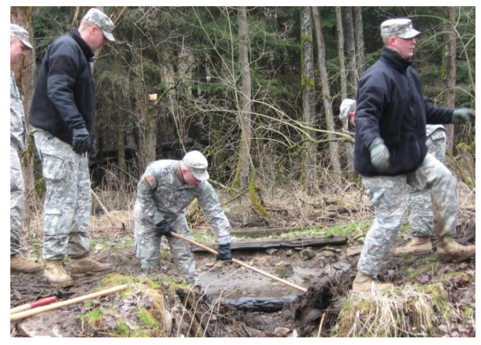
Soldiers preserve the wetlands and habitats of both beaver and kingfisher birds.

• Contributed to several TV reports on the white-tailed eagle and biodiversity