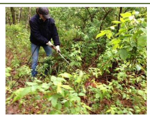
Camp Johnson has taken an aggressive approach to eliminating invasive plant species. Burning, shown here, is one method tried against invasive plants as well as manual cutting and applying herbicide and covering areas with plastic.