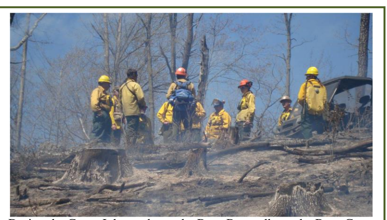
During the Camp Johnson burn, the Burn Boss talks to the Burn Crew as well as a Botanist from the State of Vermont Agency of Natural Resources and Consulting Ecologist monitoring the pitch pines. Regardless the size of the burn unit, once the burn is complete, the Burn Boss pauses and conducts a quick after-action review before moving on.

Forest Management and Prescribed Fire: Forest management has been the primary focus of the installation NRC program over the past two years, combining invasive species management, prescribed fire, wildlife protection, and habitat enhancement. The installation boasts approximately 175 acres of pitch pine forest, which supports 15 Vermont rare plants as well as many insect species associated only with this community type. Forest Management activities focus on this pine-oak-heath sandplain forest at Camp Johnson, and the open plain habitats conducive to large openings. The creation of large-scale early successional habitats as a part of the Camp will maintain or increase the level of biodiversity. Species identified as Vermont Species of Greatest Conservation Need will benefit from the creation, enhancement, promotion, and retention of early successional habitat. Techniques can include progressive clearcutting, brush hogging, burning, or other operations that increase habitat available to early successional species. Reintroduction of prescribed fire has been a cornerstone of the installation's NRC approach over the past two years.