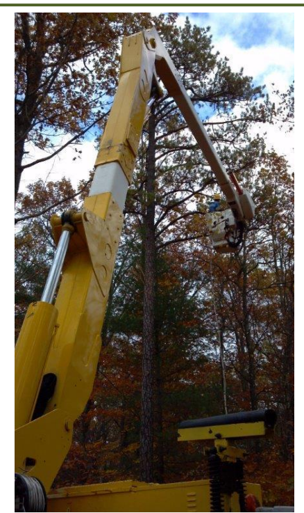
Green Mountain Power Company donated a bucket truck to assist in the collection of pitch pine seeds for the pitch pine nursery.

In total, seven acres were burned in 2013 with assistance from St. Michael's College and ANR; the College conducted pre- and post-fire analysis of effects on plant and insect species. Provided weather conditions are right, two more forest units are slated for fire management in FY14 according to the priority guidance of the installation forest management plan.