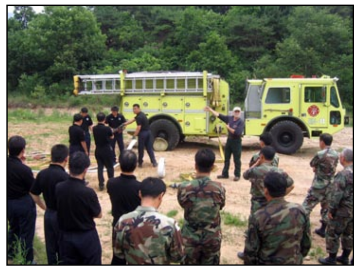
Fort Stewart/HAAF is a recognized leader in prescribed burning. Here, they pass on their expertise to Soldiers in Korea.

To share its strong abilities in forest management through prescribed burning, the team developed a Memorandum of Agreement (MOA) between Kings Bay Naval Base and Fort Stewart to conduct prescribed burning of 1,000 acres in FY 2005. The MOA exhibits the great partnership between the Army, Navy and Georgia Forestry Commission. The objective is to provide field assistance to the Kings Bay staff to facilitate prescribed burns at the Kings Bay Naval Base for the natural resource management program. The team also provided fire training to 60 Eighth US Army students stationed in Korea. The students consisted of Army Range Division contractors, Korean Service Corps and Korean structural firefighters.