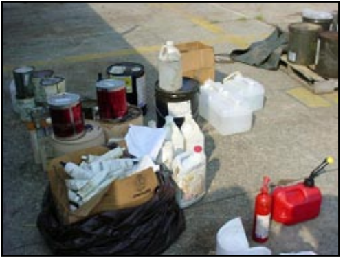
Materials recovered during Operation Clean Sweep

resources on those areas. Operation Clean Sweep led to a successful EPA inspection that identified only minor deficiencies in April 2005.