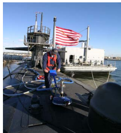
High Pressure Jet Blasting on non-skid coating on a submarine

Working with tenants, the environmental staff developed several new processes with Navy-wide application. For example, originally, non-skid coating was removed from the submarine topsides through physical grinding methods, which create large volumes of fugitive dust. Working cooperatively with submarine overhaul crews and Carolina Equipment Company conducted a pilot test of a High Pressure Water Jet Blasting system for non-skid surface removal. Initial testing showed no visible dust and reduced labor cost. For weapons cleaning, NSN began using Aqueous Weapons Cleaning units at the Police Precinct. The units are approved for all small arms and up to 50 caliber machine guns. This effort reduces labor by 80% while removing solvents from the workplace, reducing the Navy's air compliance burden, worker exposure and the volume of waste disposed.