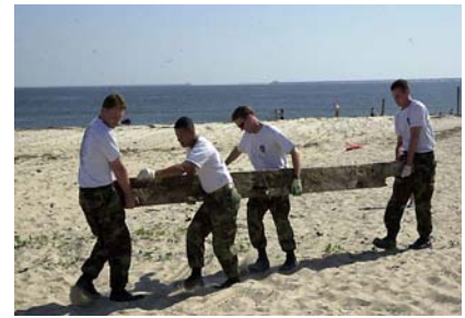
Sailors hauling away trash on Clean the Bay Day

NSN participates in many local and regional environmental outreach initiatives, including Earth Day celebrations, Clean City USA, Tree City USA (Arbor Day), Clean the (Chesapeake) Bay Day, and National Public Lands Day. NSN continually promotes responsible environmental stewardship and actively engages local government and community-based organizations to advance Chesapeake Bay restoration goals and initiatives. For example, Naval Station Norfolk is a Model-Level River Star in an award-winning program developed by the Elizabeth River Project to encourage pollution prevention and habitat restoration among businesses and industry. In addition, NSN, as part of the region, was recognized by the Environmental Protection Agency Chesapeake Bay Program Businesses for the Bay in 2003 and 2005 with an Outstanding Achievement Award for Federal Government for establishing regional partnerships and excellence in local P2 initiatives. NSN mentors and provide technical assistance to businesses in the region. In support of the Station's storm water phase II permit requirements, volunteers marked storm drains across the Station. NSN's outreach activities demonstrate its commitment to environmental stewardship, the Chesapeake Bay, and to being a good neighbor.