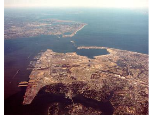
An aerial view of Naval Station, Norfolk

Naval Station Norfolk (NSN) is the world's largest Naval Station. Its mission is to support and improve the personnel and logistics readiness of the United States Atlantic Fleet. Situated on 4,631 acres, NSN is home to 69 ships, including aircraft carriers, cruisers, destroyers, large amphibious ships, submarines, and supply and logistic ships. Chambers Field, located in the center of the station, is home to 133 aircraft. Almost 54,000 military personnel and over 11,000 civilians work at NSN. Major tenant commands include: Commander, Naval Air Force, Atlantic Fleet; Commander, Second Fleet; Fleet Industrial Supply Center; Mid-Atlantic Regional Maintenance Center; Defense Distribution Depot, Norfolk; and Naval Facilities Engineering Command, Mid-Atlantic. NSN is one of nine major shore commands reporting to Commander Navy Region, Mid-Atlantic (CNRMA). The station is supported by a regionalized environmental staff that services bases in the Navy concentration area of southeast Virginia.