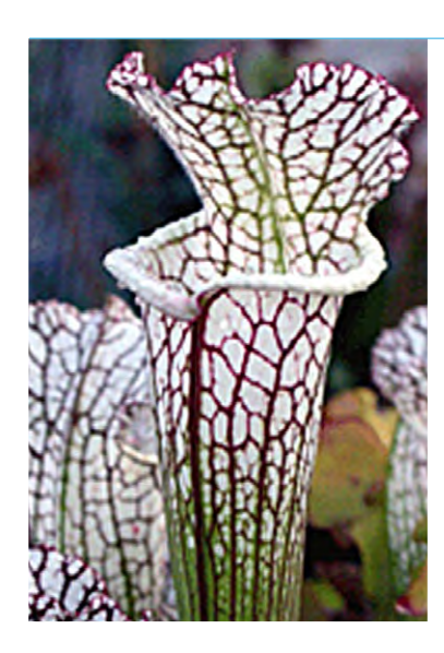
White-top Pitcher-Plant is a state listed endangered plant that is common in Hurlburt wetlands.

wetlands known as cypress dome swamps interspersed throughout, creating a mosaic of habitat types. This incredibly rich and biologically diverse area is home to many rare and sensitive species, including pitcher plants and the federally threatened flatwoods salamander.