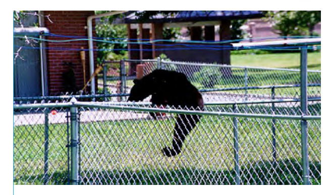
A young Florida black bear climbs a fence in base housing. Hurlburt's environmental flight responded to over 30 calls concerning bears during FY 06-07.

Hurlburt Field is located in an area with one of the highest concentrations of black bears in the state of Florida. During the award period, Hurlburt environmental personnel responded to over 30 calls concerning bears, resolving all situations without incident. In one instance, the base Natural Resources Manager met with adjacent property owners, to answer questions and quell concerns over frequent bear sightings in their neighborhood.