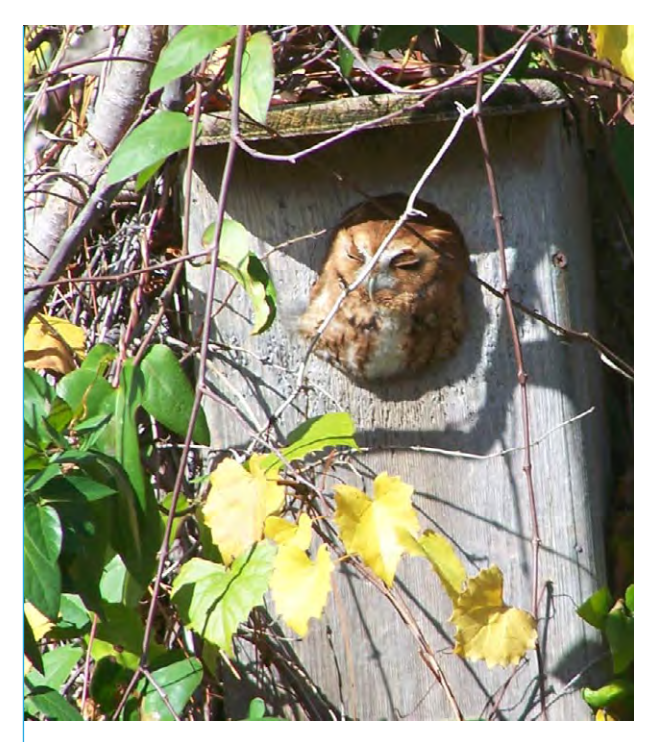
A screech owl sleepily peers out of an artificial cavity box outside Hurlburt's Child Development Center.

technics, the use of a trained border collie for wildlife harassment, and trapping resulted in a 100% reduction in lethal control measures.