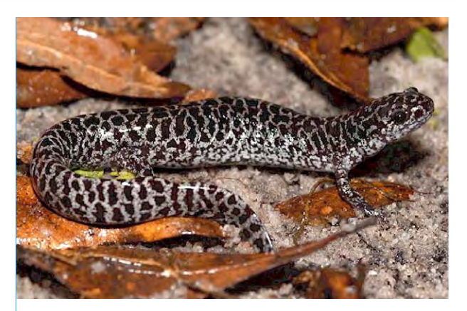
The Flatwoods Salamander is a federally threatened species found on Hurlburt Field. Prescribed fire is an important tool in the management and conservation of this species.

Rehabilitation removes the obstacle by returning contours to pre-disturbance grades and by restoring the natural hydrology of the area.