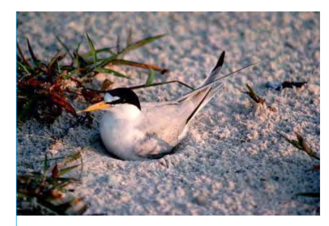
The Least Tern is a state listed threatened species. Every spring hundreds of the small birds nest on building roof tops on Hurlburt Field. The base takes special precautions to protect the birds and their nests and ensure they are not disturbed during this critical time.

In 2007, Hurlburt secured funding and partnered with Florida's State Heritage Organization in the creation of the Florida Natural Areas Inventory. Work began on a year long comprehensive survey of the entire 6,634 acre installation for rare, threatened and endangered species and their habitats. This updated inventory will provide the base natural resources manager with the best possible information to ensure the continued protection and proper management of rare flora and fauna on Hurlburt Field.