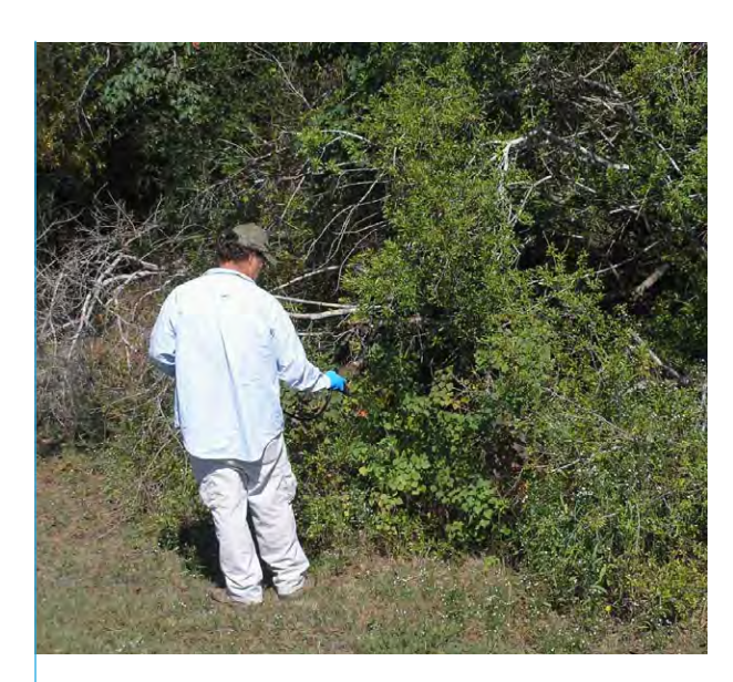
Young Chinese tallow saplings are treated with the herbicide Garlon. Chinese tallow is a highly invasive medium sized tree that out competes native vegetation and reduces bio-diversity.

During the award period Hurlburt worked with NRCS to remove 15,000 Chinese tallow, 3,400 Privet, Mimosa, and Camphor trees and 28 acres of Cogon grass. Permit requirements associated with a mitigation package submitted by the base to FDEP and the Corps of Engineers will ensure funding for invasive species management for years to come.