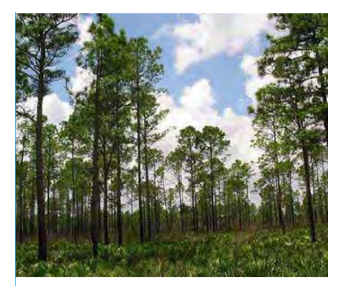
The pine flatwoods communities on Hurlburt Field are maintained in a healthy ecological state through regular prescribed burning.

Hurlburt Field recently received the National Arbor Day Foundation's Tree City USA Award for the 13th consecutive year. Hurlburt has also received the Tree City Growth Award for 6 of the last 10 years. In 2007, Hurlburt Field celebrated Arbor Day by creating an art display, planting trees, and presenting a tree preservation themed play featuring a cast of 105 children.