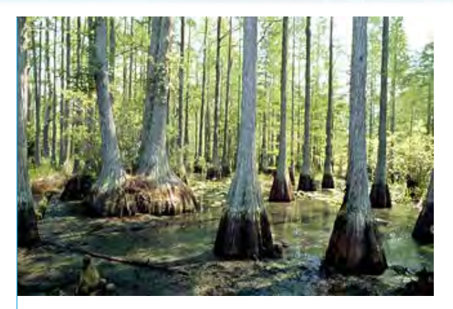
The vast East Bay River Swamp is the northern boundary of Hurlburt Field. The swamp's extreme inaccessibility and pristine condition provide the perfect combination of habitat for many species.

Hurlburt Field is bounded by Santa Rosa Sound to the south and the vast East Bay River Swamp to the north. Fifty-two percent or 3,431 acres of the base are jurisdictional wetlands. A 1,000 acre natural area on the western side of the installation is comprised of longleaf pine flatwoods with over two dozen small seasonally flooded