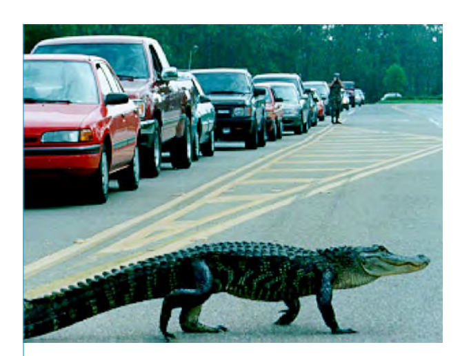
An alligator stops morning traffic at Hurlburt's back gate as it crosses the road. Education through newcomer's briefings and frequent articles in the base paper help to ensure alligators and Airmen continue to co-exist well.

Airmen and alligators co-exist very well on Hurlburt, but occasionally preemptive measures must be taken to ensure everyone's safety. In 2006 the FWC was contacted to assist in removal of four large and potentially dangerous alligators from a popular recreational pond after they began exhibiting behavior suggesting they had been fed and had lost their natural fear of humans. The relocated alligators ranged in length from eight feet to ten feet.