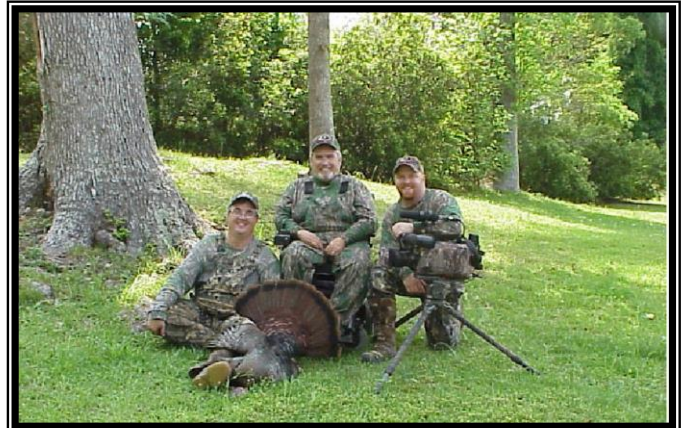
Camp Lejeune provides hunting opportunities on 102,000 acres of land. Each Spring, hunters on Base harvest an average of 25 gobblers.

Marine Corps Base, Camp Lejeune's revised Integrated Natural Resources Management Plan (INRMP) provides major program changes for various conservation related activities. Endorsed by State and Federal natural resource agencies the revised INRMP improves military training opportunities while also providing a greater level of protection for sensitive species. In 2004, Camp Lejeune formed a Conservation Working Group (CWG) to address the integration of natural resource conservation issues and military training. The CWG convenes every two months or as needed to facilitate INRMP implementation, address new issues, projects, and other topics as necessary. The CWG also serves as a Natural and Cultural Resources workgroup for Camp Lejeune's Environmental Management System implementation and tracking.