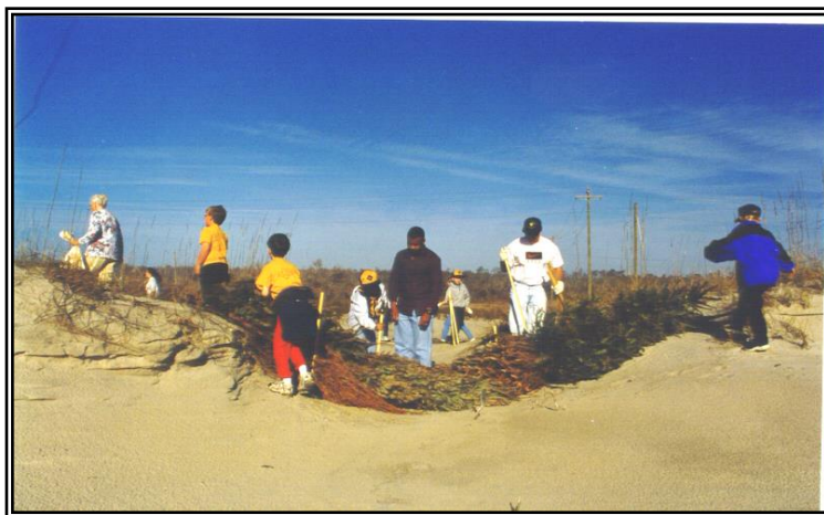
Local Boy Scout Troops and community members assist with dune restoration at Onslow Beach. Recycling of Christmas trees helps establish growth in the dunes while eliminating disposal at the landfill.

The diversity of this stakeholder group, with its broad connectivity to various mission components, provides vital INRMP integration and fosters focused communication among all aspects of the Camp Lejeune Community. The CWG and other Installation stakeholders have creatively developed changes to natural and cultural resources related programs which have had and will continue to have a positive effect on military readiness, sensitive natural and cultural resources, and will not affect the Installation's duty to conserve threatened and endangered species. With support from the command, the Conservation Working Group will continue to oversee the successful implementation of the INRMP while gaining the support of regulatory and non-regulatory stakeholders in the community interested in the goal of enhanced land use planning, training area sustainability, fire prioritization on the landscape, and regional initiatives aimed at conservation.