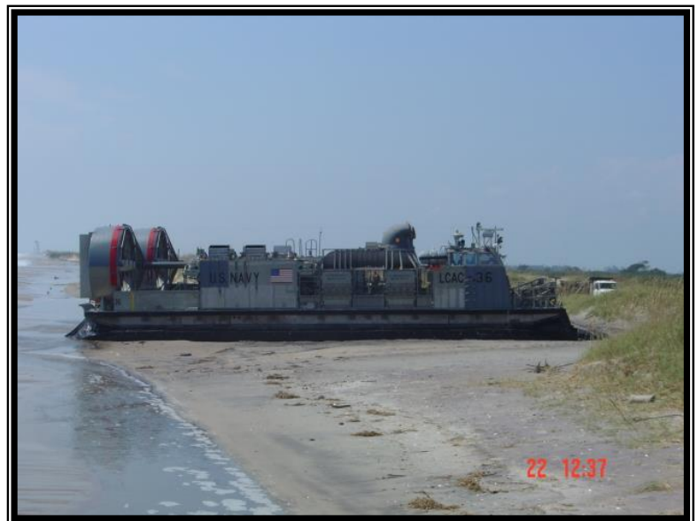
Camp Lejeune's Onslow Beach provides the most diverse amphibious training opportunity within the Armed Forces. The sustainability of Onslow Beach is critical to the Marine Corps and the future of expeditionary forces.

The Environmental Conservation Branch (ECON) is charged with INRMP development, implementation and revision, continues to evaluate and analyze long-range planning, project implementation, along with other emerging requirements. The ECON Branch, with a combined staff of 40 professional and technical personnel (consisting of civilian employees, interns, and contract support) is well structured to lead INRMP implementation. ECON includes professional wildlife biologists, professional foresters, National Environmental Policy Act staff, an archeologist, and conservation law enforcement staff.