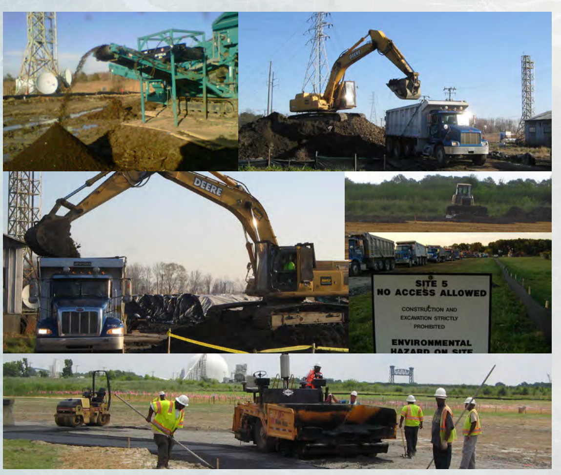
Site 5 Removal Action Activities