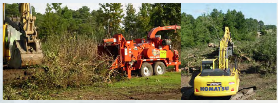
Site 2 Remedial Action Activities