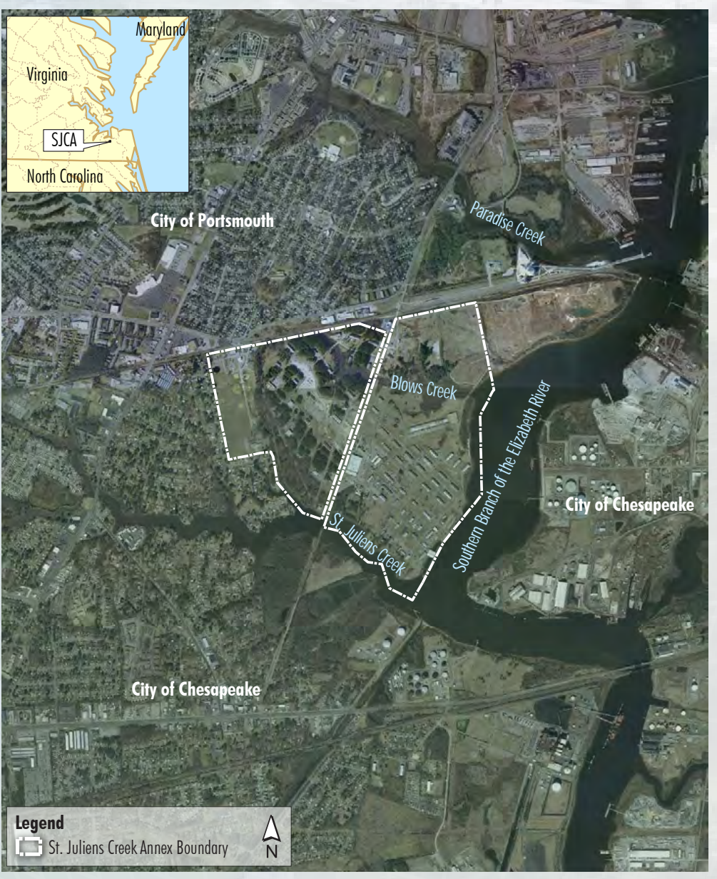
Figure 1 – St. Juliens Creek Annex Location

SJCA is in the 4th congressional district of Virginia. The facility is within the independent City of Chesapeake and is bounded on the north by the City of Portsmouth.