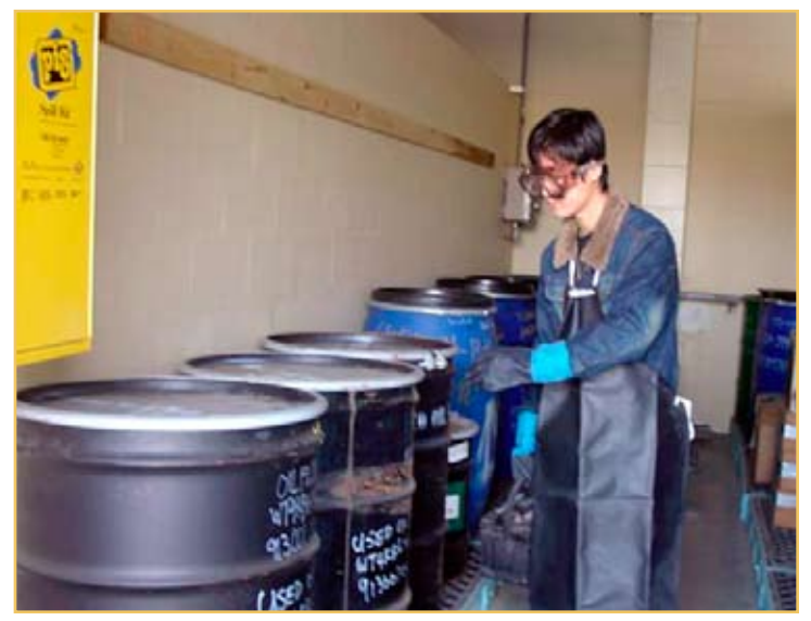
Kyung Pook National University student intern works in the Camp Walker Hazardous Waste Storage Area. Six student interns were able to earn college credit while volunteering a total of 1,990 hours with the environmental staff.

USAG Daegu's Environmental Quality Team is committed to improving environmental quality not only for the benefit of the garrison's mission, but also to prove that the installation and the U.S. Department of the Army is a good steward of the host nation's land. In FY 2006 and FY 2007, implementing the Qualitative Recycling Program, upgrading the garrison storage tank system, installing a new vehicle painting system and managing hazardous wastes more efficiently garnered significant savings, both in terms of financial costs and mitigating harmful impacts to the environment. Hands-on environmental initiatives are bolstered by training and education across the garrison that extends out into the community. Through the efforts of its Environmental Quality Team, U.S. Army Garrison Daegu is demonstrating to its host nation that the Army is a good neighbor and a valuable asset in sustaining the environment in Korea.