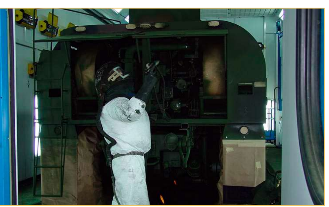
US Army Material Support Center Korea Korean National employee uses the new water-based CARC paint application system.

In keeping with the installation's mission, the Environmental Quality Team helped one of its major units at Camp Carroll, the Material Support Center Korea, replace their chemical agent resistant coating