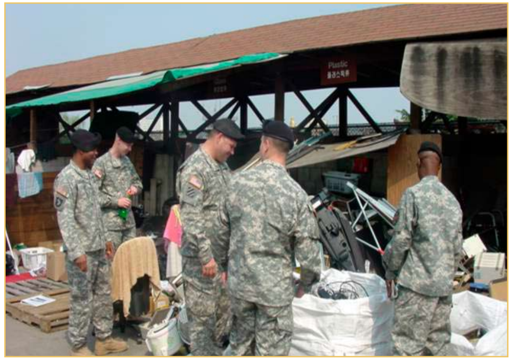
Soldiers attending the Environmental Compliance Officer Course visit the Camp Walker recycle point.

USAG Daegu, headquartered at Camp Henry, Korea in the city of Daegu and part of the Installation Management Command Korea, is an integral player in Army Transformation and directly supports the 8th United States Army. It was activated on March 28, 2007. USAG Daegu is a subordinate unit to the Installation Management Command-Korea Region located at Yongsan Garrison in Seoul, which was activated on Oct. 7, 2002. USAG Daegu assumed the base operations mission from the 20th Area Support Group (subsequently relocated to Camp Carroll and deactivated in June 2006). Area