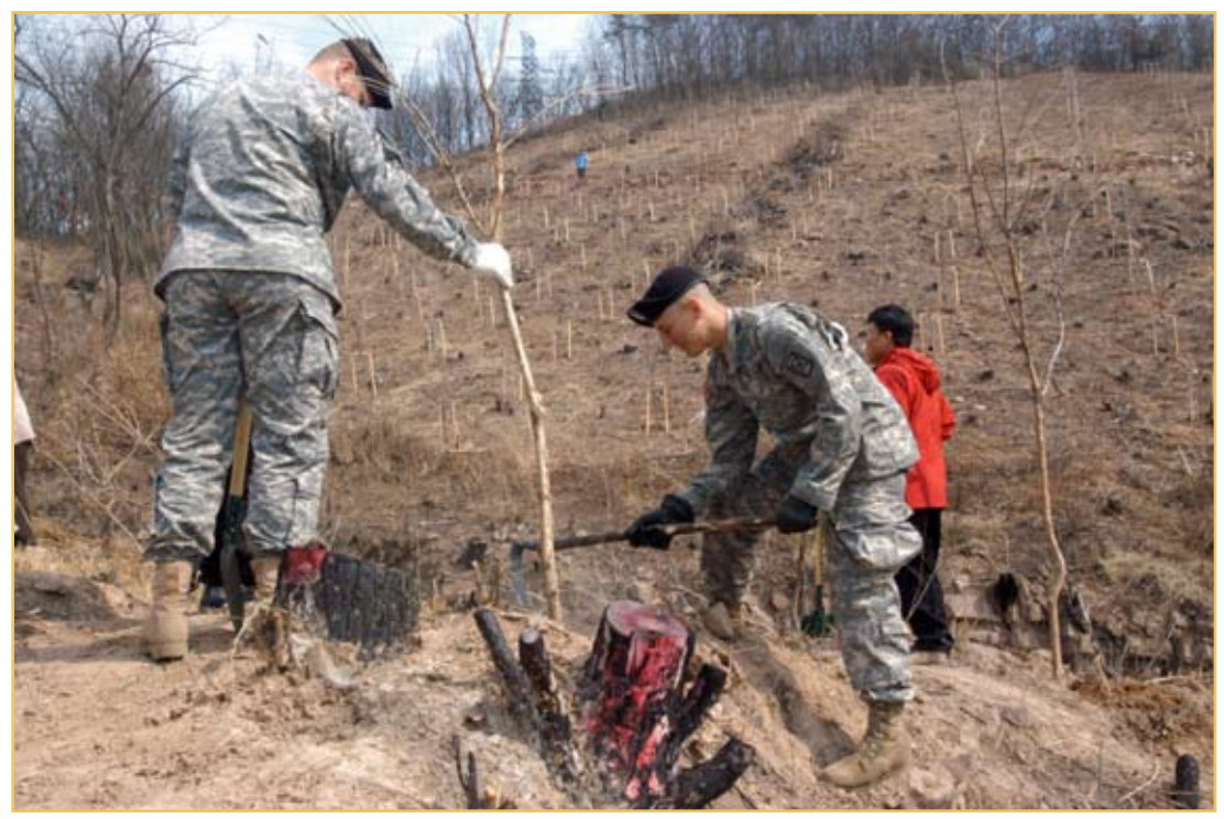
Soldiers, Civilian workers and family members from throughout USAG Daegu participate in a mass tree planting event on Waryong Mountain in Daegu Korea celebrating Arbor Day.

members, civilian employees and the and Boy Scouts. Weeklong Earth Day events included partnering with the Army Community Services Youth Center to provide field trips of the Camp Carroll Wastewater Treatment Plant. Information kiosks were set up and staffed at the Camp Walker Post Exchange and the Camp Carroll Community Activities Center. Inclassroom instruction was also provided to the School Age Services program discussing the importance of recycling and caring for the natural environment.