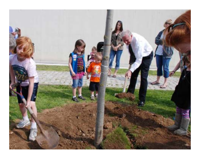
USAG Vicenza Deputy Garrison Commander plants a tree with the DoDDS students