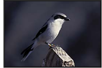
San Clemente Loggerhead Shrike

NBC's conservation program is comprehensive however the primary focus is the management of federally listed species and their habitats. NBC supports 25 federally listed species, which is more than 27 states and the District of Columbia. The sustained increases in population numbers, of three species, the federally endangered San Clemente Loggerhead Shrike, the federally endangered California least tern and the federally threatened western snowy plover, while supporting training requirements has been the keystone of our program.