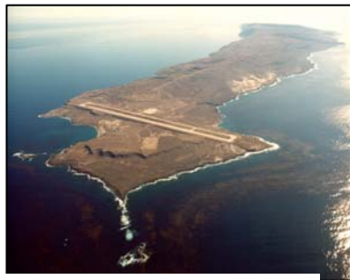
San Clemente Island

In addition to the wetlands there are 135 acres of unique natural areas. Native trees are not common in southern California, therefore there is not a forestry program on NBC. Due to the proximity to local communities and the sensitive operational requirements hunting is not authorized on NBC. Portions of leased land that are used for military training are used for grazing and hunting, but these programs are managed by U.S. Forest Service and/or the Bureau of Land Management.