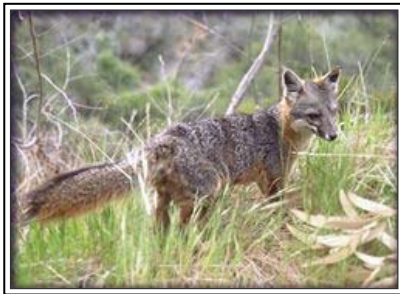
San Clemente Island Fox

There are many aspects of the program that deserve recognition, but three exceptional efforts stand out. First, the San Clemente Island fox was recently listed by the U.S. Fish and Wildlife Service (USFWS) on four of the eight Channel Islands, but it was not listed on SCI due to proactive management by the Navy. Due to these efforts the mortality rate over the last two years had decreased approximately 33% to 50%.