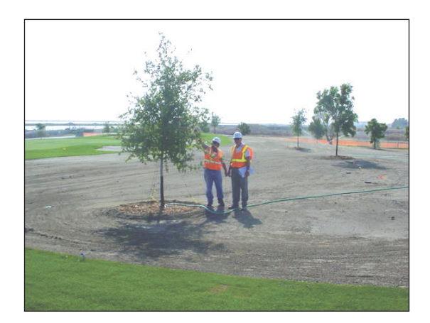
The Site 22 Golf Course Landfill is covered with a biotic barrier and restored. Rodentproof casings protect trees that are aesthetically pleasing to the public and enticing to local birds of prey. The new trees are monitored and cared for regularly.

Environmental Setting – Located one mile from San Francisco Bay, Moffett Field includes 220 acres of wetlands. The southern portion of the bay was originally covered by tidal salt marsh and mud flats – most of which have been eliminated or altered through land use