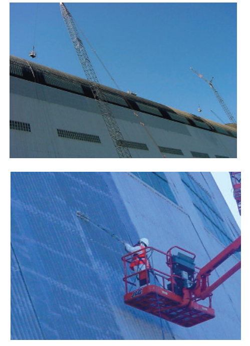
Contractors employed a number of innovative methods to seal Hangar 1's decaying surface quickly and safely.

While working on a cleanup remedy for Site 25 (Eastern Diked Marsh), NASA staff discovered a continuing release of PCBs from Hangar 1. Because potential ecological receptors at Site 25 had to be protected, Site 25 cleanup plans were halted to address the release from Hangar 1. The Navy held multiagency meetings to analyze alternatives ranging from limited access to tearing down the structure. To immediately reduce risk, an interim action was completed.