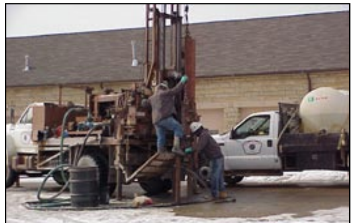
▲ Workers plug an existing monitoring well on Fort Riley (pre-treatment).

“I am proud of Fort Riley and its continuing efforts to preserve our environment by improving the quality of water, air and natural resources through sensible and meaningful actions.”