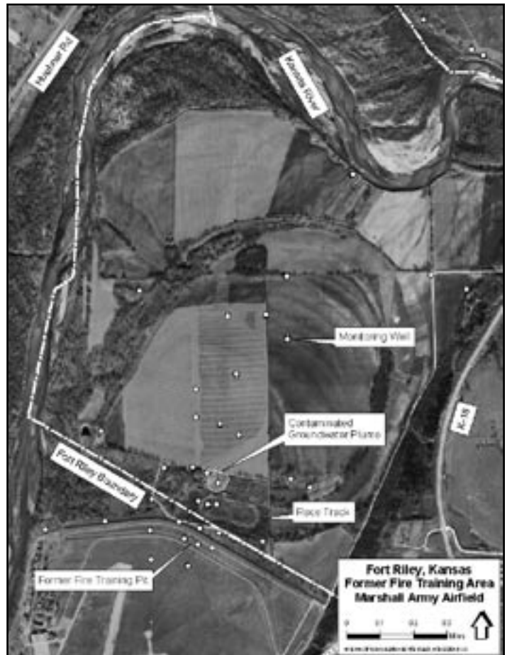
▲ This map shows the former fire-training area where Fort Riley has conducted soil vapor extraction bioventing to treat contamination.

Fort Riley’s IRP has achieved success by testing innovative technologies, reducing risks to human health and the environment, collaborating with small and disadvantaged businesses and working hand-in-hand with regulators to reduce environmental restoration costs and the time required to complete restoration projects. Moving forward, the IRP team will continue to support military readiness by providing Fort Riley and the surrounding community with an unparalleled level of excellence as it fulfills its objectives.