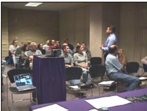
▲ Fort Riley RAB meetings are held quarterly and serve as a primary mechanism through which the Army communicates with the public about the IRP.

Since 1997, Fort Riley has involved surrounding communities in environmental restoration activities through the Restoration Advisory Board (RAB). In July 2002, RAB members reduced their meeting frequency from bimonthly to quarterly because they agreed the IRP was accomplishing its goals in a timely manner and needed less oversight. Between meetings, Fort Riley keeps RAB members informed through a quarterly newsletter and updates to the Fort Riley Web site. Additionally, the RAB Community Co-Chair actively participates in the annual Installation Action Plan workshop. RAB outreach initiatives have included open houses, off-post meetings at convenient locations (including a local university) and personal invitations to adjacent landowners. Fort Riley is currently updating its community involvement plan, which was first developed in 1992.