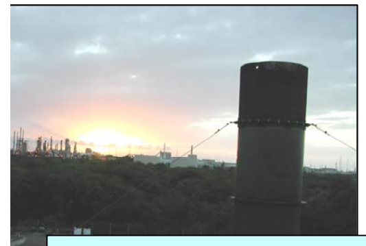
End of a day at the temporary thermal desorption facility.