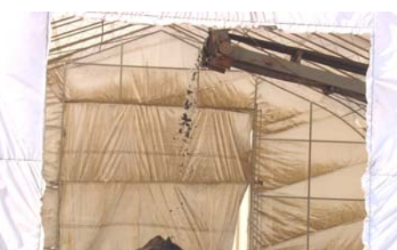
Treated soil in a shelter off of the treatment system.