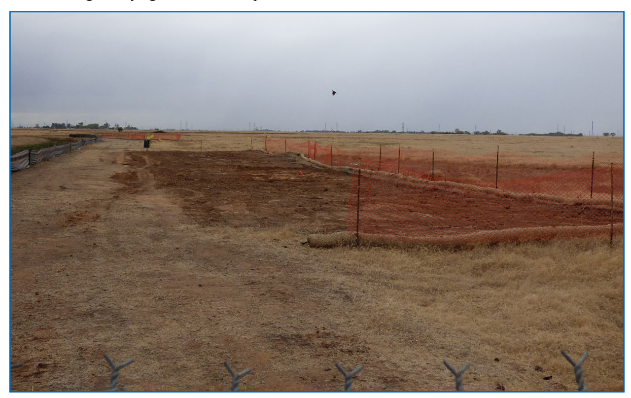
Flightline Westside Drainage Outfall

Through its collaborative partnership with state regulatory agencies and installation leadership, Beale AFB created and implemented a streamlined process for obtaining concurrent signatures on decision documents from the Air Force, California Department of Toxic Substances