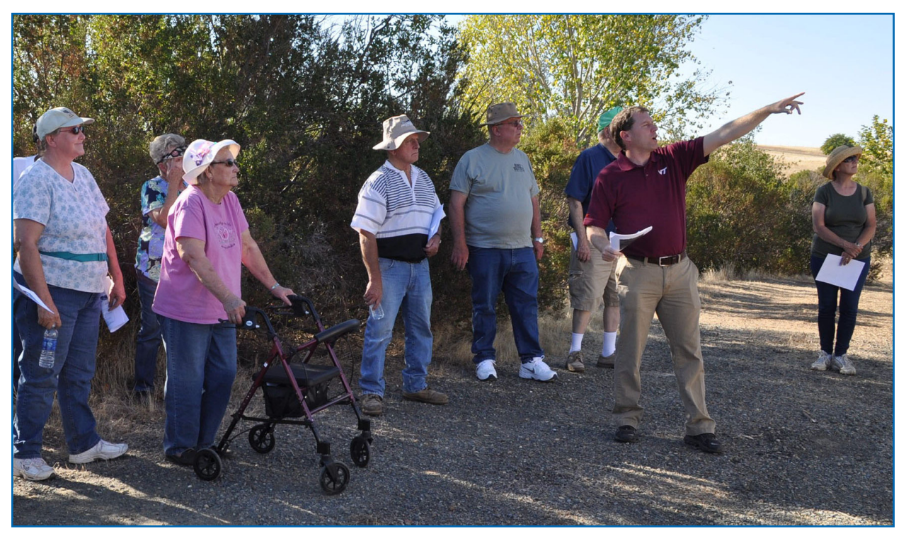
Restoration Advisory Board Tour

Beale AFB conducts RAB tours twice a year, focused on an installation mission and restoration site visit. Participation includes concerned community members, Board members, Beale AFB residents, and civic leaders.