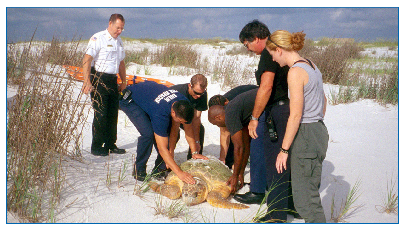
Sea Turtle Rescue Team Eglin's Fire Rescue assist EQ Team members in rescuing a disoriented loggerhead sea turtle. Eglin volunteers contribute over 2,000 hours to sea turtle monitoring annually.

enhance the resources of the nation's coastal zone. Eglin AFB lies within the coastal zone; therefore all growth on Eglin must be regulated accordingly. In 2015, the EQ Team revised Eglin's General Negative Determination Agreement (GNDA) under the CZMA with the State of Florida and obtained approval to double the area under which Eglin infrastructure improvements could be covered. Moreover, Eglin Natural Resources secured an additional three years of coverage under the GNDA for such projects to be developed moving forward. This GNDA expansion will cover countless Eglin infrastructure improvements that previously would have required over 1,000 man hours of processing.