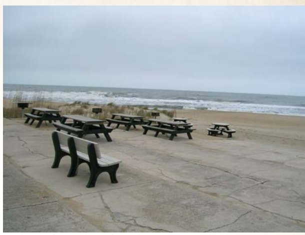
A view of the beachfront incorporated in the Camp Pendleton cultural landscape. The viewing platform dates to the 1960s.

relationship essential to cultural landscape designation. Today, the beach with its high dunes functions to help protect Camp Pendleton from incoming storms, including winds and rising water.