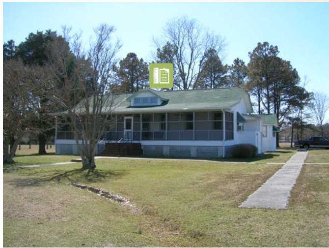
The entirety of Camp Pendleton is listed as an historic district and features several notable structures. The Governor's cottage, built in 1912, initially served as the commandant's cottage, then began to be used by Virginia governors after WWII. It has been updated with a new roof, new HVAC system, and insulation, using roofing materials consistent with historic appearance and installing ductwork without interruption to interior spaces.

refuge and resource for Virginia governors dating from the mid-20th century. Since then, the cottage has been the location for state visits, vacations, meetings and entertainment events. Elsewhere on the installation, the structures reflect the evolution of Virginia's military history, from World War I through the present.