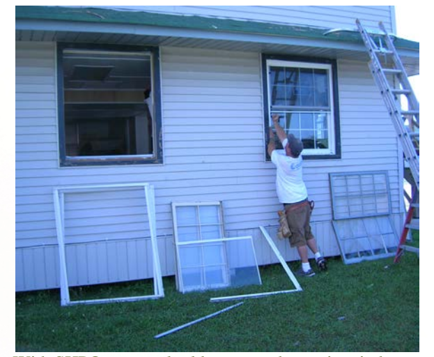
With SHPO approval, old expressed-muntin windows are replaced with integrated-muntin alternatives. This replacement preserves the historic aesthetic while conserving costs and increasing the efficiency and function of the buildings.

Throughout the installation, electrical and HVAC systems were upgraded to high-efficiency, energyconserving systems. In many cases inefficient window-box air conditioning units, detracting from the buildings' historic appearance, were removed with the introduction of central air conditioning systems, and original chimney and stovepipe heating systems were replaced while character-defining detached chimney stacks were retained. Over the past few years, roofs have been replaced throughout the district using historically representative green asphalt shingles. Other envelope upgrades, particularly doors and windows, required more consideration. The CRM program successfully negotiated a solution to these costly rehabilitations with the SHPO. The divided light, double-hung sash wood windows with expressed muntins originally used in Camp Pendleton's construction proved to be incredibly costly to replicate today. Non-historic window replacements, however, had been made in earlier decades, and these changes had not adversely impacted the district's NRHP eligibility. As a compromise, the CRM program proposed installing historically accurate muntin-style windows on buildings that bordered main roadways on post, while