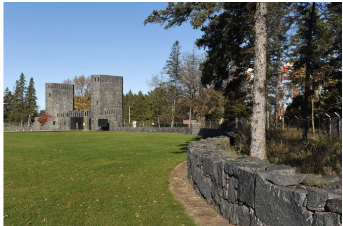
Camp Ripley's main entrance including portions of shared responsibility with the MN DOT. The wall has been restored in past years with input, funding and manpower from both agencies.

Externally, the CRM program consults with the SHPO, the Minnesota State Archaeologist, 11 Federally recognized Tribes and several interested party Tribes,