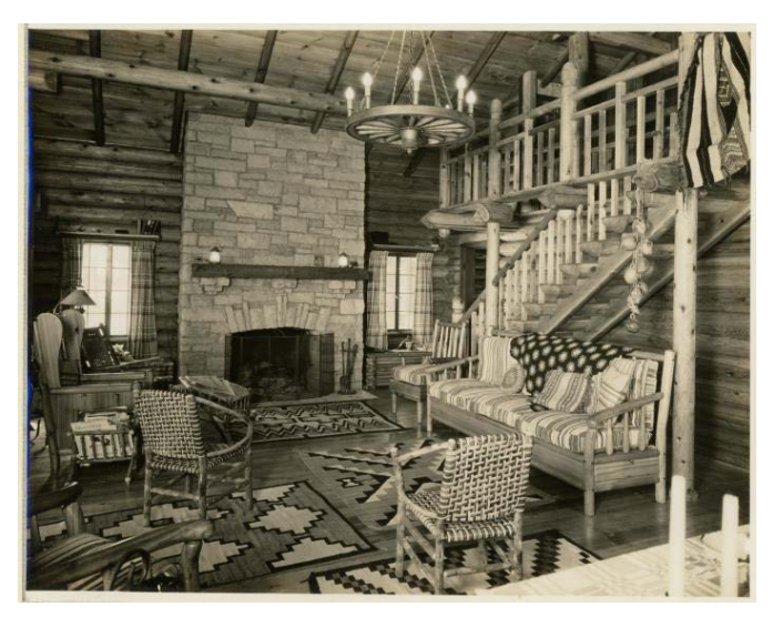
A photo of the Governor's lodge retrieved from the archives for use during it's recent restoration. Using hints in the photo such as the cover of the magazine in the rack, we were able to determine the age of this photo to be from shortly after construction of the building, allowing us to restore it as accurately as possible.

ineligible for NRHP listing; SHPO consultation has also determined the Cold War era structures are not eligible. Two facilities, however, the Camp Ripley chapel and the ammunition supply bunkers were assessed under different criteria. The bunkers were found to be eligible though addressed under an Advisory Council for Historic Preservation program comment, in which MNARNG's responsibilities for preservation have been completed. Due to its near original state of preservation and unique design features, it is recommended that the chapel will be eligible upon reaching the 50-year requirement for the National Register.