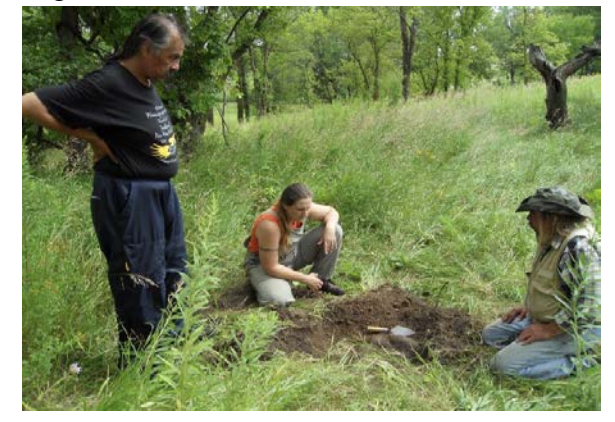
A phase 2 test unit excavated by Heritage sites, a survey company wned by the Leech Lake Tribe. Heritage sites was instrumental in completing a large portion of the Camp Ripley survey inventory.

The CRM program protects around 70 eligible or potentially eligible archaeological sites. The full picture of Camp Ripley's archaeological landscape, however, has become truly clear over the past 2 years as the Section 110 inventory of the entire 54,000-acre installation was completed. The multi-year effort achieves a modernization and standardization of all survey data, minimizing need for any further future survey efforts. MNARNG now has full, data-driven confidence in its project siting and avoidance of impacts. This survey effort incorporated 300 acres set aside in 1986 for high probability of archaeological sites. Further evaluation required for this parcel has now been completed with majority cleared for training access.