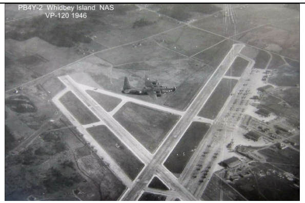
Ault Field, Naval Air Station Whidbey Island. Early Euro-American Context Study. 1946 photo of historic farms visible around periphery of the airfield. Historic Hangar 1 in lower right foreground. (Photographer unknown, 460101-N- KQ701-001)

In further support of the Navy's Section 110 NHPA program obligations, in FY 2017 the installation's CRM developed a pilot project aimed to efficiently and economically re-evaluate archaeological sites at NAS Whidbey Island and establish a comprehensive monitoring program. The program consists of reevaluating the resources as opposed to a specific project area for recurring projects, allowing more flexibility. NAS Whidbey Island has numerous previously recorded archaeological sites covering large areas of the installation. Most of these sites were recorded over thirty years ago and contain burials and other sensitive cultural materials, but only a few have been formally determined eligible for listing in the NRHP. With a solid knowledge base of site location, content, and integrity of identified sites, the installation can more effectively integrate mission critical activities in these areas while giving the CR program the ability to better direct resources to manage National Register eligible properties.