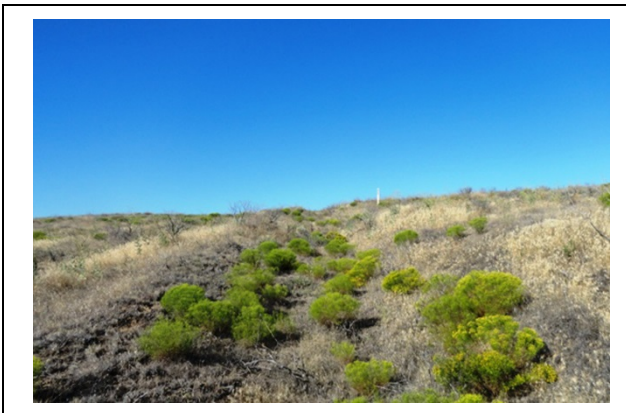
A 10-mile segment of the Oregon Trail runs through NWSTF Boardman. An Oregon Trail Management Plan is in development incorporating tribal input. Oregon Trail ruts located in the left foreground of trail marker. (Photo by Stephen Beckham, Lewis and Clark College. 120730-N-KQ701-001)

In FY 2016 and in support of an Oregon Trail Management plan for NWSTF Boardman, the CR program entered into a Cooperative Agreement (CA) with the CTUIR to provide the tribal perspective on management of the Oregon Trail. Like many stretches of the Oregon Trail, the 10-mile segment managed at NWSTF Boardman followed a pre-existing Native American trail. Under the CA, the CTUIR arranged for tribal elders to visit NWSTF Boardman focusing on segments of the Oregon Trail and associated archaeological sites, including a late-Pleistocene/early-Holocene site. The oral histories taken during these site visits contributed to a report on the tribal history and significance of the Oregon Trail from an indigenous perspective. The Tribe suggested management approaches for parts of the Trail that have significance to them, which will be incorporated into the Management Plan as well as the ICRMP, facilitating more expedient and efficient planning for future projects and changes to training requirements.