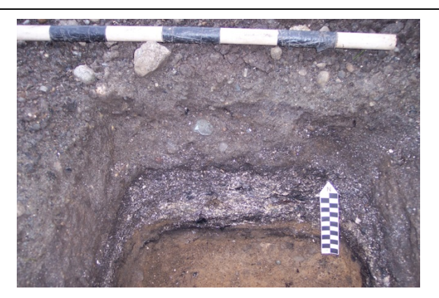
Seaplane Base, Naval Air Station Whidbey Island. Pilot program for archaeological site reevaluation (Section 110). Example of shell midden deposit. Midden deposits date up to 500 years ago. (Photo by Teresa Trost, Cascadia Archaeology. 131014-N- KQ701-001)