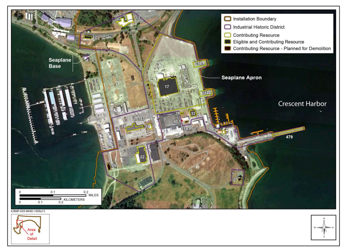
Map of NAS Whidbey Island Seaplane Base Historic District

Both ICRMPs are due for revision in FY2020. There are 13 federally recognized tribes with interests, affiliation and/or treaty rights at the facilities managed by NAS Whidbey Island and over 56 with interests in Navy activities.