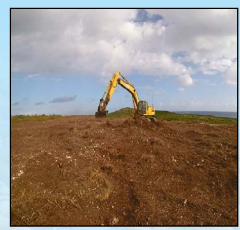
Figure 4. Remotely-operated equipment cutting and raking vegetation into piles.

Accelerating Risk Reduction in the Most Dangerous Area – The former bombing range contains a 75-acre area where tens of thousands of submunitions from cluster bombs were dropped over decades of military training. Many types of submunitions are laying on the ground surface, hidden by vegetation. This situation poses a very high risk to anyone who may enter the area, including local residents, tourists, Wildlife Refuge managers, and cleanup workers. In 2017, an innovative time-critical removal action (TCRA) was implemented to safely and effectively clear the submunitions from the ground surface. The innovative approach includes using remotely-operated equipment to remove large bombs (using a magnetic attachment) and to cut and rake the vegetation into piles (using mower and rake attachments). This