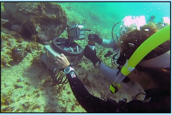
Figure 8. POCIS and grab water sample collection adjacent to an underwater munition.

Groundbreaking Technology to Measure Trace Munitions Contaminants Underwater – Hundreds of munitions have been observed on the sea floor around Vieques, and tens of thousands more are believed to be buried in the shallow sand offshore. Regulatory agencies and the general public have significant concerns about the potential human health and ecological risks posed by munitions constituents that may leak from these underwater munitions. In 2016, the Vieques team supported a research project funded by the Department of Defense