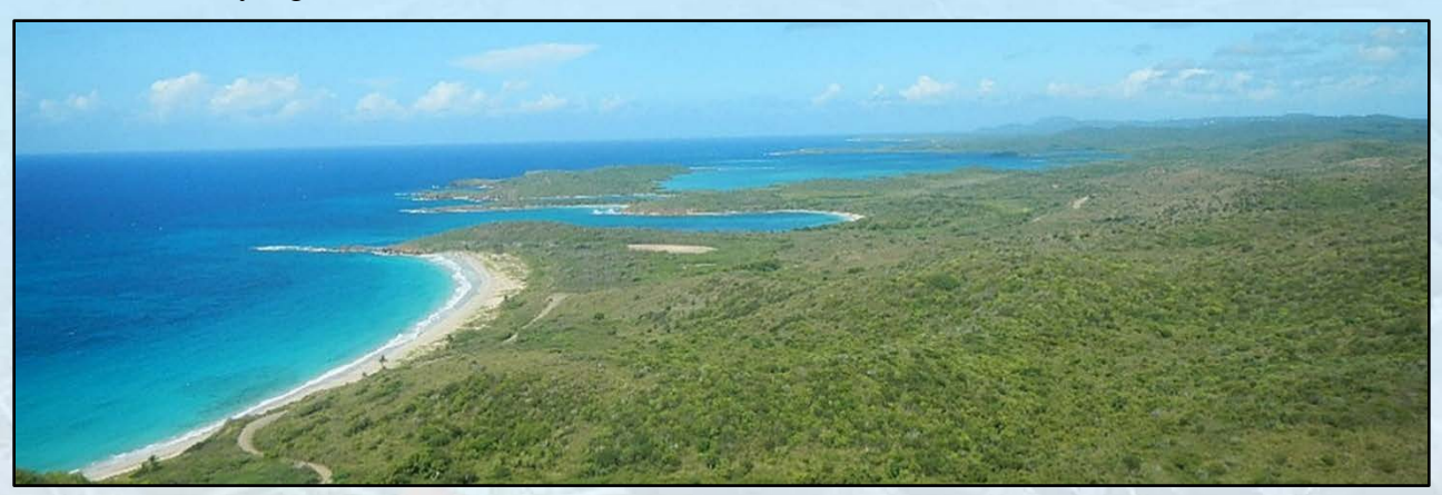
Figure 1. The former Vieques Naval Installation is 23,000 acres, with another 12,000 acres of surrounding waters.

Today, the former installation has been transferred to federal and local agencies, mostly for conservation as part of the Vieques National Wildlife Refuge. The refuge houses a variety of natural resources, including sensitive habitats such as mangroves, subtropical dry forests, lagoons, and coral reefs, and endangered species such as sea turtles, manatees, and brown pelicans. Portions of the former installation are open to the general public for recreation and for access to culturally significant areas.