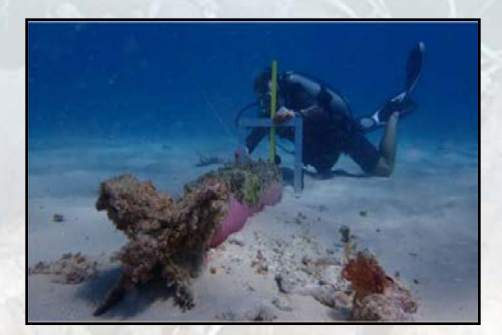
Figure 10. Diver measuring the movement and burial of a munitions surrogate.

• Tracking Underwater Munitions Mobility – Understanding the movement of munitions in the underwater environment and their interaction with beaches is of critical importance because beaches are the most sought-after destinations by the public. Throughout 2016 and 2017, the mobility of 61 munitions surrogates, deployed just offshore of 9 beaches, was monitored under the effect of beach changes and variable sea conditions. The data gathered during this study will be used to make long-term predictions of beach changes and burial and