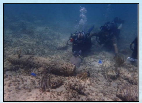
Figure 9. Divers collecting sediment pore water samples adjacent to an underwater munition.

Environmental Security Technology Certification Program (ESTCP) to study munitions constituent concentrations underwater. The study utilized Polar Organic Chemical Integrative Samplers (POCIS), which are designed to detect munitions constituents in seawater down to ultra-trace levels. An integrated team of munitions and science divers