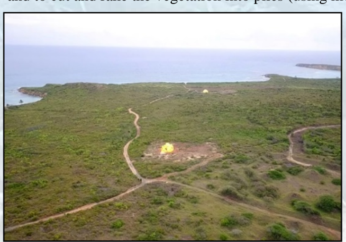
Figure 5. UAV monitoring controlled burning of cut vegetation that allows workers safe access to remove submunitions.

allows munitions-clearance workers to safely access the area to burn the vegetation piles and remove the submunitions made readily visible on the ground surface. Air monitoring is performed during the controlled burns to ensure there are no effects on air quality in the community and a UAV is used to determine when it is safe for workers to return to the area following the controlled burns. Without using these innovative technologies, the "Submunitions Area" would have remained indefinitely a significant source of explosive risk.