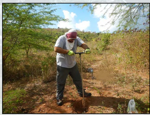
Figure 7. Advanced Geophysical Classification used to rapidly identify sampling locations, expedite Remedial Investigation, and lower costs.

Advanced Geophysical Classification to Expedite Remedial Investigation —As part of a 2,000-acre Remedial Investigation, the nature and extent of subsurface munitions and associated contamination must be delineated. In order to streamline logistics and reduce