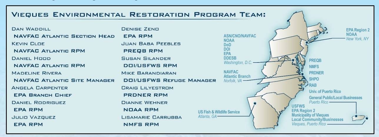
Figure 2. Due to unique regulatory, environmental, and natural and cultural resource conditions associated with Vieques, NAVFAC Atlantic teams with over a dozen Federal and Commonwealth agencies throughout the East Coast and Puerto Rico. To promote effective communications, the Vieques Environmental Restoration Team meets frequently among themselves and with the many other stakeholders, including the local community, academia, and scientific organizations.