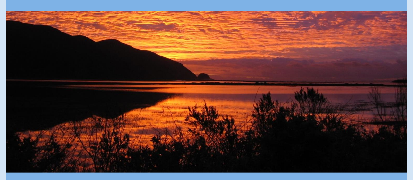
2019 Secretary of Defense Environmental Award: Installation Restoration