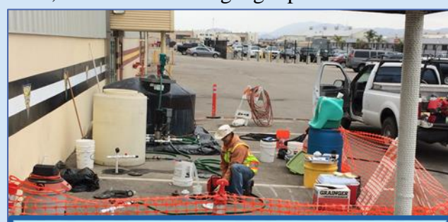
Reducing risk using an in-situ chemical oxidation system at NBVC Point Mugu

are underway with the California regulatory community to transition this treatability study into an interim removal action. The NBVC Environmental Restoration Program performed interim removal action (IRAs) at 14 sites at NBVC Port Hueneme in 2016. Upon successful completion of these IRAs, with concurrence from the California regulatory community, these sites were fast tracked for Records of Decision with three being completed in 2017, another three in 2018, with the remaining eight planned for 2019.