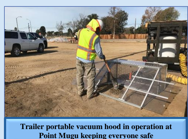
The NBVC Environmental Restoration Program has a long been a leader in innovation in the field of remediation of chlorinated solvents. Specific remediation technologies used have included anaerobic bioremediation via the addition of and optimization electron of donors. bioaugmentation with engineered microorganisms, and in-situ chemical oxidation (ISCO) as a companion to bioremediation in contaminant source zones. ISCO was successfully implemented at Point Mugu Site

residents for 18 months looked unavoidable. The innovative solution was a purpose built mobile chemical agent containment hood, which reduced the exclusion zone diameter to zero feet, allowing military families to safely stay in their homes for the duration of the projects. The hood is trailer mounted for mobility with vacuum blowers and filters, allowing it to be deployed over excavations to create a negative pressure containment shroud over a buried CAIS kit. An additional benefit is that site personnel do not require any supplemental respiratory or skin personnel protective equipment when working around the hood. The hood's filter agent can be modified to work at any installation restoration site that presents a respiratory hazard during subsurface work.