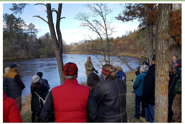
Camp Ripley's ACUB program has protected more than 28,000 acres from incompatible development since 2005. In 2018, Camp Ripley Senior Commander, Brigadier General Lowell Kruse, participated in the dedication ceremony of 200 acres along the Mississippi River that was protected from development through the ACUB and Sentinel Landscape program.

While all of the team's undertakings are designed to enhance both conservation and training lands, consistently demonstrating the compatibility of stewardship and mission, they have also launched several new initiatives over the past two years with immediate benefits to the MNARNG's training capabilities. One example is the team's mutual goals of erosion control and infrastructure protection. Historically, DPW installed culverts as flooding, saturated roadbeds, or washouts transpired, but now, as DPW is integrated into the team, they coordinate with ITAM and Environmental Team members prior to culvert installation. The team conducts a wetland delineation and watershed analysis to determine appropriate culvert size, type, location, elevation, flow rate, and BMPs are evaluated and applied. Today all culverts are installed by the team to ensure proper inlet/outlet protection, elevation, and upstream/downstream stabilization,