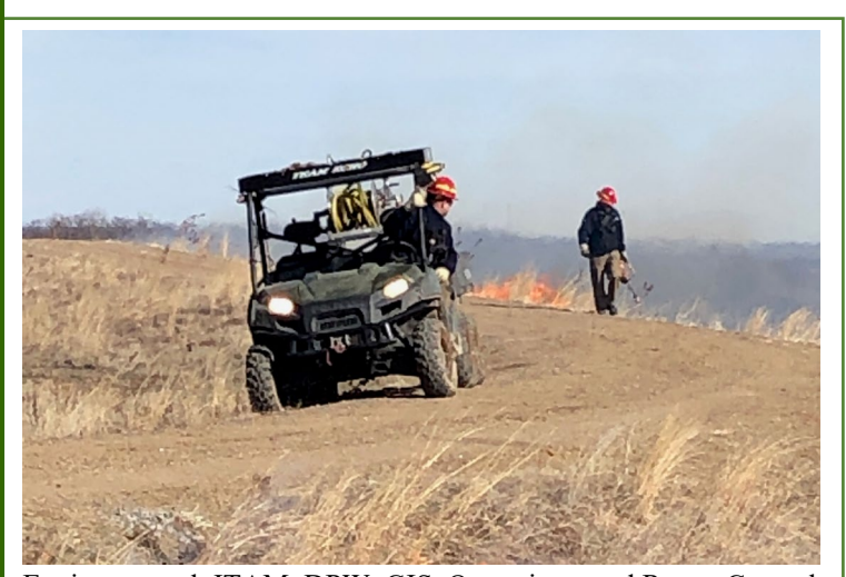
Environmental, ITAM, DPW, GIS, Operations, and Range Control staff all work collectively on various projects throughout the year. Planning and implementation of prescribed fire is an annual event at Camp Ripley. Planning is carried out by Environmental and ITAM to meet shared needs, while on-the-ground support is implemented by DPW.

The team is also supported by several GIS specialists. In fact, the MNARNG's GIS manager is directly assigned to the Environmental Office while also overseeing the GIS specialists for ITAM and Facilities Management. This organizational structure integrates GIS support automatically for the team across their respective departments. Recently developed GIS tools include a dashboard utilized by Environmental, Operations and Range Control staff to monitor planning and implementation of prescribed fire. It also includes an Army Compatible Use Buffer