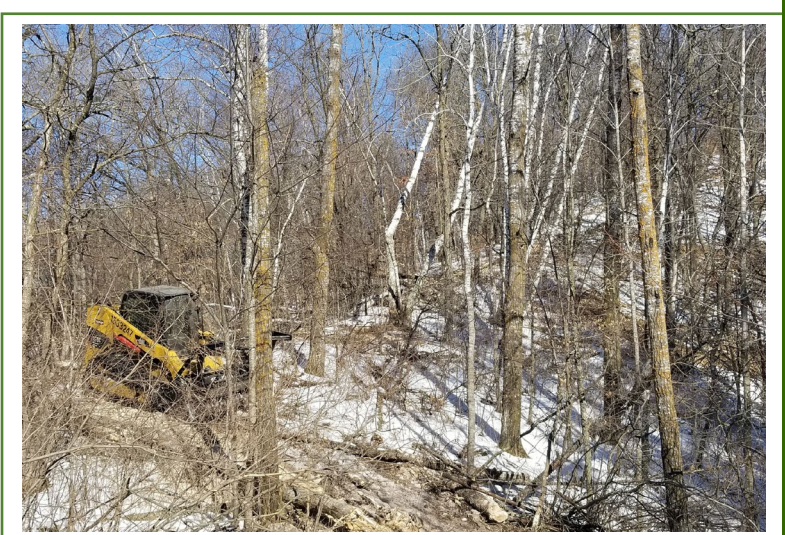
The team developed and implemented a new forestry management plan, which defines short-term (10-year) management goals based on the combination of natural resources and military training objectives. The team collaborated to develop a GIS viewer for forestry practices that includes military training layers, wildlife, threatened and endangered species habitat, sensitive habitats, and past and proposed forest management activities. They also work to concurrently achieve the Environmental office goal of mature forest growth to specific for native plant communities in a manner that supports mature interior forest wildlife.

The team works to achieve ITAM priorities for land navigation training areas that have a mature growth stage forest with at least a non-optimal training condition of 50% visibility at 35 meters, with snags in no more than two transects. They also work to concurrently achieve the environmental goal of mature forest growth specific for