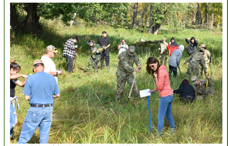
Team-led prairie planting event. Soldiers, citizens, community groups, and school groups visit Camp Ripley for educational and recreational activities headed up by the NRC team. Through these projects, the team demonstrates an ongoing commitment to fostering environmental conservation throughout the community.

For the first time since 1994, the team initiated monarch surveys in 2018 in support of the species status assessment. The survey includes vegetation assessments along survey tracts, documenting monarch activities, and