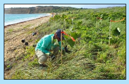
Figure 9. Sea grape restoration on an important sea turtle nesting beach.