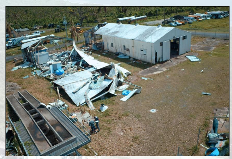
Figure 3. Hurricane Maria damaged or destroyed much of the Navy's Environmental Restoration Program and island's infrastructure.

ensure public safety, Navy UXO technicians acted immediately after the storm to inspect over 50 beaches and all roads where munitions might have become exposed. Other members of the Vieques Restoration Team volunteered their time to distribute emergency supplies, set up satellite telephone communications, disseminate munitions safety information, and assist the local community with removal of fallen trees and scattered debris.