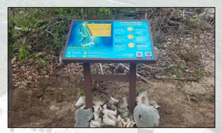
Figure 8. Educational kiosk at trail entrance on Cayo La Chiva.

by an estimated 3 years, preserved natural resources, and saved an estimated $2.5 million. The remedial action involved performing munitions clearance in all areas accessible to the public while preserving the islandwide vegetation, with primary focus on planned trails and picnic and overlook areas. Additionally, an educational kiosk was installed to guide visitors to access planned public use areas and discourage access to other areas.