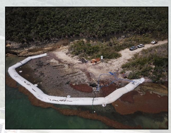
Figure 11. Innovative use of a temporary, waterfilled cofferdam significantly enhanced the safety and efficiency of removing munitions located just offshore.

Innovative Cofferdam Reduces Site Worker Risk -Munitions removal is an inherently dangerous operation and using divers to perform removals underwater significantly increases that risk. To address munitions located offshore, the Navy deployed a temporary, water-filled cofferdam to isolate and dewater the removal area. This innovative approach allowed UXO technicians to successfully conduct the munitions removal without the need for UXO divers. The cofferdam provided for more effective visual and physical access by exposing the formerly underwater environment and munitions, thus accelerating the cleanup while increasing the safety of the operation. Of particular note, the cofferdam exposed many large, heavily encrusted munitions that could be safely removed