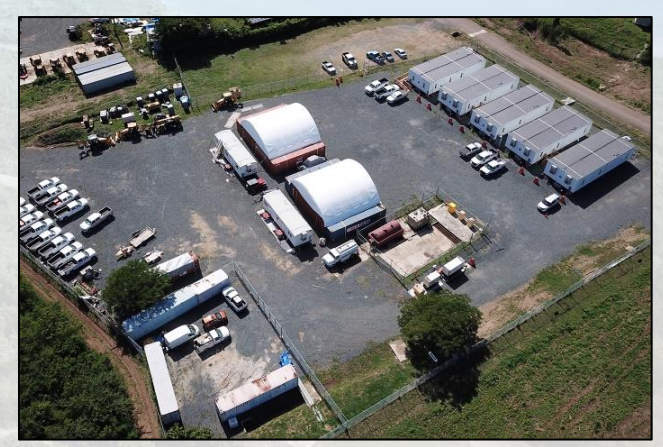
Figure 6. The new Environmental Restoration Program base of operations constructed using green and sustainable practices.