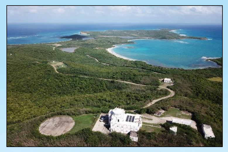
Figure 1. The former Vieques Naval Installation is 23,000 acres, with another 12,000 acres of surrounding waters.

The former installation was transferred to federal and local agencies, mostly for conservation as part of the Vieques National Wildlife Refuge. The refuge houses a variety of natural resources,