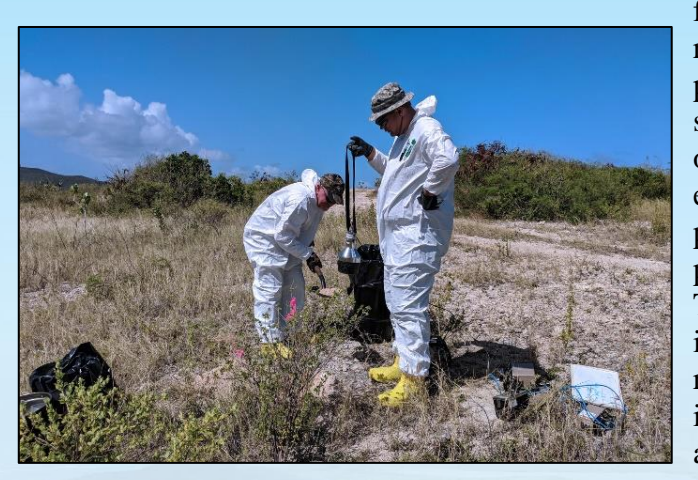
Figure 7. Team comprising radiological and UXO specialists locate and remove depleted uranium projectiles and collect soil samples.

Radiological Investigation Addresses Significant Public Concern – In 1999, depleted uranium (DU) armor-penetrating projectiles were accidentally fired during military training exercises on Vieques. The Nuclear Regulatory Commission and the Navy immediately implemented a cleanup effort, but not all DU projectiles were recovered. In January 2018, working closely with EPA and the Navy's Radiological Affairs Support Office (RASO), a combined radiological and munitions response team performed a position-correlated gamma scan across the DU area,