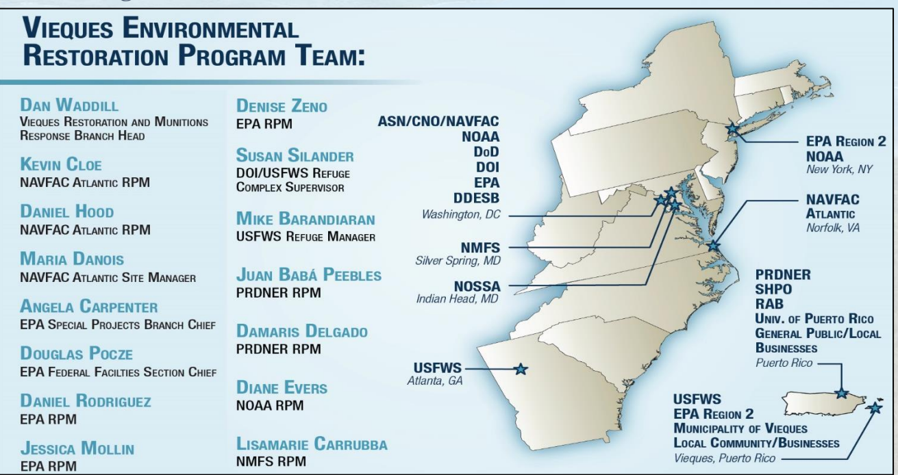
Figure 2. Due to unique regulatory, environmental, and natural and cultural resource conditions associated with Vieques, NAVFAC Atlantic teams with over a dozen Federal and Commonwealth agencies throughout the East Coast and Puerto Rico. To promote effective communications, the Vieques Environmental Restoration Program Team meets frequently among themselves and with the many other stakeholders, including the local community, academia, and scientific organizations.