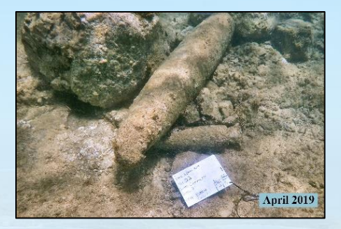
Figure 13. 2019 photograph demonstrating the munitions items have not moved over 13 years, even under the influence of such events as Hurricane Maria in 2017.

• State-of-the-Science Geophysics to Make Roads Safer – In order to support munitions clearance from approximately 30 miles of access roads throughout the former training areas, the Navy is using the MetalMapper 2x2 for Advanced Geophysical Classification (AGC). This state of the science technology was developed from the TEMTADS system used previously at the site. The MetalMapper 2x2 distinguishes munitions from scrap metal in the subsurface, thereby reducing the amount of digging required to clear the many miles of roads. The Navy and stakeholder agencies are using this technology to carry out removal actions that will support both current and planned road uses, with estimated cost savings of several million dollars.