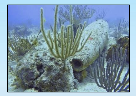
Figure 10. Abundant corals on and adjacent to a Mark 84 bomb. The Navy worked collaboratively with NMFS to develop methods for coral transplantation to avoid or minimize impacts to the marine ecology, especially threatened and endangered species and critical habitats.