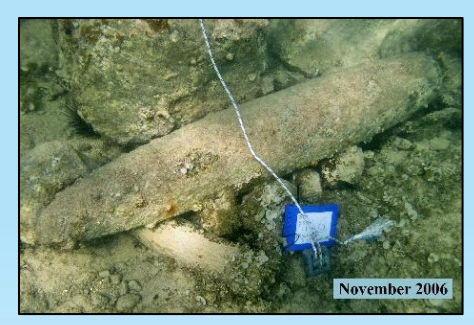
Figure 12. 2006 photograph of a Mark 82 general purpose bomb lying on top of a 5-inch projectile on the ocean floor.