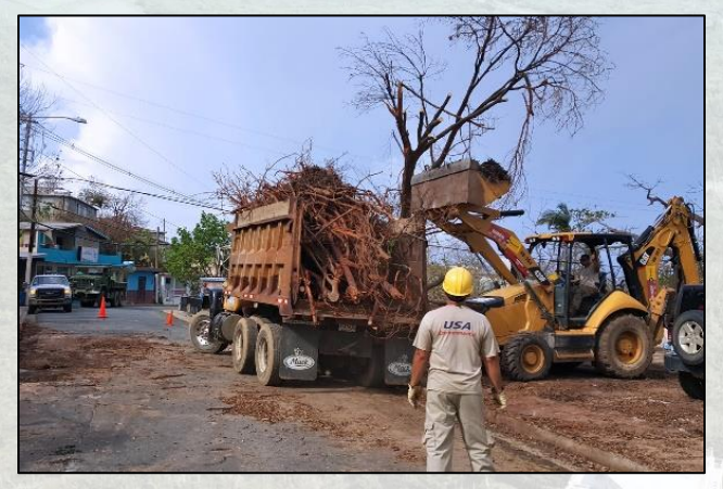
Figure 5. Immediately following Hurricane Maria's devastation, Vieques Restoration Team members volunteered their time to support emergency response in the community, including clearing debris and fallen trees from public areas and delivering munitions safety information along with much-needed supplies to Vieques residents.

The base of cleanup operations was rebuilt utilizing significant green and sustainable practices, such as old Conex shipping containers re-purposed for storage and maintenance, solar and LED lighting, energy efficient windows, on-demand water heaters, and repair/reuse of existing materials and equipment where possible. These sustainable approaches are expected to realize a cost savings of several hundred thousand dollars.