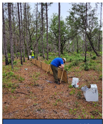
SCA Intern constructs drift fence for herpetofauna survey.

consistent with the military mission." Five stated goals, 17 objectives, and 16 projects constitute the INRMP. The INRMP combines the management of natural resources of 3 formerly independent commands into one organization and one document. The NASP Natural Resources Team also provides forestry and agricultural management assistance for NAS Whiting Field. Annual INRMP reviews and "Metrics" with the stakeholders have been conducted annually since 2002 with the exception of 2004 when it was canceled due to Hurricane Ivan. INRMP revisions were completed in 2018 and the Natural Resources Data Call has been completed every year since 2002. The team was able to meet or exceed all tracked metrics during the 2020 and 2021 Data Calls , with the only exception noted being that the Team is understaffed. Projects such as Biological Monitoring, Habitat Restoration, Beach Restoration and Shoreline Stabilization, Invasive and Exotic Species Control, Urban Forestry, and Forest Product Sales were all implemented to enhance land