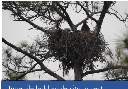
Juvenile bald eagle sits in nest.

Mission Enhancement: Land and natural resources management led directly to mission continuance at the base. The Natural Resources Team responded to an increasing wildlife hazard, Bird Aircraft Strike Hazard (BASH), near the airfield when two bald eagle pairs nested near the approach of RW/01 during two consecutive years. The Team coordinated with USFWS to obtain nest removal permits and with USDA to complete nest monitoring. Through further coordination with NASP Air Operations to limit the use of the runway in question for several months, the eaglets