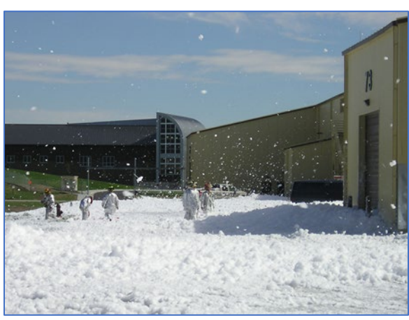
Historic Fire Suppression System at Dock 73

activities beginning in 2014. On May 19, 2016, the EPA established a lifetime Health Advisory level of 70 parts per trillion for a combined concentration of PFOA and PFOS in drinking water. This spurred sampling of off-Base private drinking water wells that were downgradient of FT001. To date, the PFOS/PFOA impacted groundwater and surface plumes extend into the community surrounding the Installation and continues downstream for at least 18 miles.