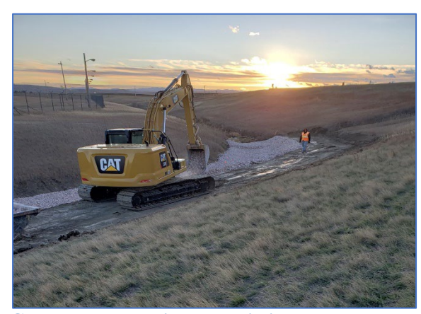
Green and Innovative Remediation

The Ellsworth ERP is at the forefront of remediation technology implementation, most notably for innovative technology associated with treating projects PFOS/PFOA. These emerging contaminants are toxic and difficult to treat because of their high stability and mobility. The Ellsworth ERP adeptly employs innovative techniques to simplify processes and to test new treatments for PFOS/PFOA. During the award period three demonstration/validation projects were initiated with estimated completion dates and determining next step outside the award period.