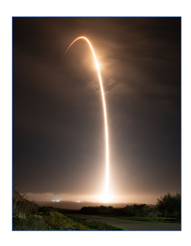
A SpaceX Falcon 9 rocket carrying NASA's first planetary defense test mission, the Double Asteroid Redirection Test (DART), launches from Space Launch Complex-4 at VSFB on November 23, 2021.

Encompassing over 99,000 acres along the central California coast, Vandenberg Space Force Base (VSFB) employs 2,892 military personnel, 1,143 Department of Defense (DoD) civilians, and 2,822 contractors. Space Launch Delta (SLD) 30, the host unit at VSFB, also manages four geographically separated units including Pillar Point Air Force Station. Primary missions include developing and testing Intercontinental Ballistic Missile (ICBM) systems, launching and tracking satellites, and supporting spaceflight operations in the Western Range, which begins at VSFB's coastline and extends to the western Pacific Ocean. SLD 30 supports West Coast launch activities for the U.S. Space Force (USSF), DoD, Missile Defense Agency, National Aeronautics and Space Administration (NASA), National Reconnaissance Organization, foreign nations, and numerous privately-owned launch companies.