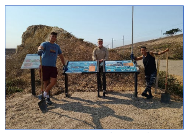
Team Vandenberg Hosts National Public Lands Day Events

museums, but adopted new ways of participating in community events to promote the installation's extensive and diverse heritage using video and teleconferencing. CRM staff maintain memberships in the Society for American Archaeology, Society for Historical Archaeology, Society for California Archaeology, and Register of Professional Archaeologists. The installation also maintains affiliation with the Santa Barbara Museum of Natural History, which houses the Central Coast Information Center of the California Historical Resources Information System, storing site records, survey reports, and excavation reports.