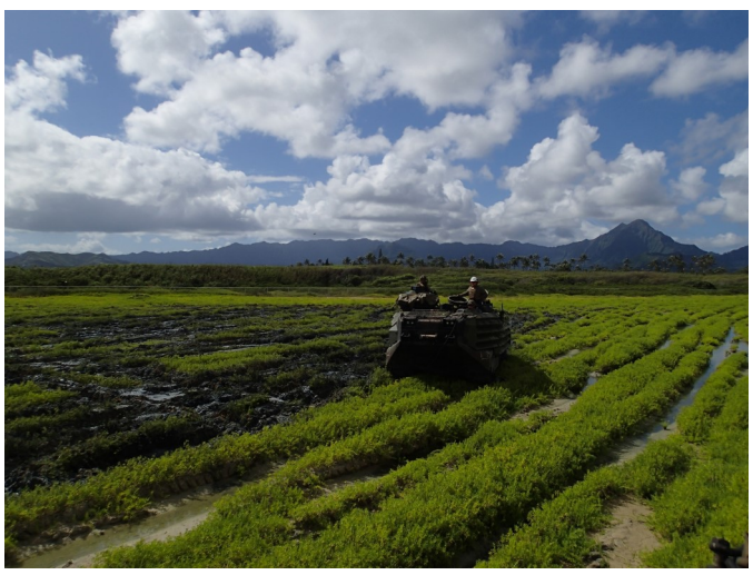
3rd Marine Regiment Combat Assault Company participating in the annual "Mud Ops" training event inside the Nu'upia Ponds Wildlife Management Area.