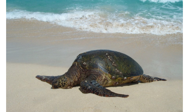
Threatened Hawaiian green sea turtle basking on Pyramid Rock beach, MCB Hawaii.

• MCB Hawaii has become a regular nesting habitat for Hawaiian sea turtles and hosted between 14 and 28 percent of all known nesting on Oahu, equating to the emergence of at least 1,468 sea turtles during the achievement period. Much of this success can be directly attributed to the natural resources staff's protection efforts including cordoning off every presumed nest with high-visibility rope and clear signage. In addition, natural resources staff nourished collaborative relationships with volunteers, Federal agencies, researchers, and DoD partners to protect nests and collect data that will improve adaptive management.