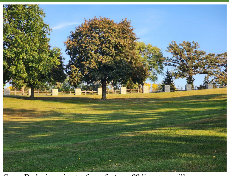
Camp Dodge's perimeter fence features 99 limestone pillars. Preservation of this unique feature involved meticulous handwork to restore the masonry.

Close collaboration with the State Historic Preservation Office (SHPO) is also essential to the CRM program's success; transparency and communication characterize this interagency relationship, which helped to streamline the CRM compliance processes for Camp Dodge's historic restoration projects. The overarching CRM strategy for Camp Dodge is guided by the training site's Integrated Cultural Resources Management Plan (ICRMP), which is undergoing