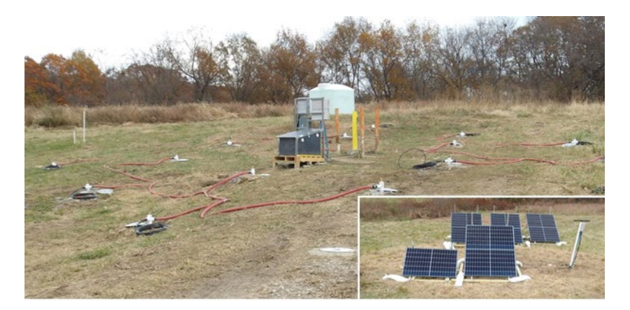
Figure 5 . The first ever application of electrokinetic-enhanced bioremediation (EK-bio) for explosives using solar power at LCAAP Area 11. The treatment reduced RDX groundwater contamination over 96% in less than 3-years. This was achieved from problem identification through implementation and confirmation monitoring for a sustainable green remediation approach to optimize restoration timeframes.

(titanium rods with a mixed metal oxide coating) evenly spaced vertically within the well screen (~5-20 feet below ground surface). The electrodes were powered by solar panels with batteries for nighttime operation, controllers, and associated wiring for a green remediation approach. The electrodes consumed ~45 amps of solar power at 55V DC, 24 hours a day. Concurrent with the applied electrokinetic field, ~12,500 gallons of dilute 3 weight percent (wt.%) sodium lactate solution was gravity feed into the treatment zone by March 2021. The 3 wt.% sodium lactate solution was gravity-fed through individual