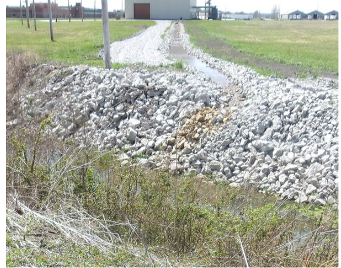
Figure 7. Through an extensive baseline characterization, metal translator values were generated that allowed the treated effluent from the pump-and-treat system to be diverted from the sanitary sewer to a newly constructed surface water discharge ditch, which saved the Army ~$340,000 annual.