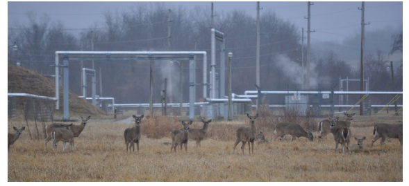
Figure 8. Some of LCAAP's fuzzier community members! One of our Environmental goals is to enrich and protect the health of the deer by maintaining Land Use Controls of the AOCs. The deer on the installation are part of a dynamic hunting program that engages team members to get out in nature and teach the next generation conservation.

The environmental restoration program is a key component of the mission at the LCAAP. The health and safety of personnel at the LCAAP, as well as the surrounding community is paramount. The environmental restoration program continues a robust monitoring program for vapor intrusion, surface water and sentry boundary groundwater monitoring across the entire installation to ensure that LCAAP's staff and local community receptors are not adversely impacted from legacy contaminants.