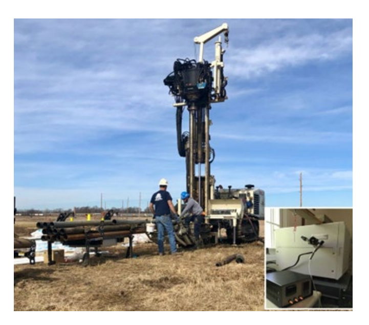
Figure 6. An expediated and dynamic characterization of Area 5 and Area 17D using whole-core soil sampling (WCSS) with an onsite direct sampling ion trap mass spectrometry (DSITMS) laboratory allowed LCAAP to identify an unknown groundwater source and establish detailed contamination assessment for targeted remediation that will optimize restoration timeframes.

By December 2021, ECC completed 18 borings (810 vertical feet) at Area 5 and analyzed 256 onsite samples; completed 36 borings (1,200 vertical feet) at Area 17D and analyzed 567 onsite samples to meet the proposed characterization DQOs (see Figure 6). ECC collected an additional 51 split samples for offsite laboratory analysis and