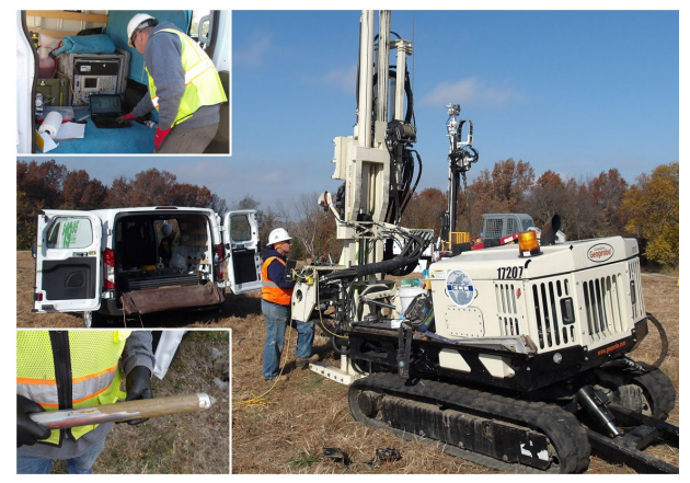
Figure 2. LCAAP conducted a high-resolution site assessment (HRSA) using cutting edge dye-enhanced laser induced fluorescence (DyeLIF) that generated over 103,000 readings to create a precise 3D model of the non-aqueous phase liquid (NAPL) contamination within Area 17B waste pits.