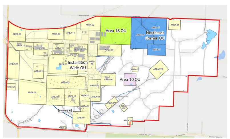
Figure 1. LCAAP is located in Independence, Missouri. Environmental Restoration has been ongoing since 1980. Optimization of protracted RA-O / LTM and ineffectual remedies is the focus of this mature program.

the environment. LCAAP established its environmental restoration program in 1980 and was subsequently added to the National Priorities List in 1987. LCAAP is divided into 36 discrete areas of concern (AOCs), and restoration is organized into four Operable Units (OUs) as depicted in Figure 1. Environmental restoration has been occurring at the LCAAP for over 40 years. Remedies for each OU were established by 2008, and the 36 AOCs are in either Remedial Action Operation (RA-O) or long-term management (LTM). Since extensive non-aqueous phase liquids (NAPL) are present at several AOCs, ongoing operations are focusing on optimizing