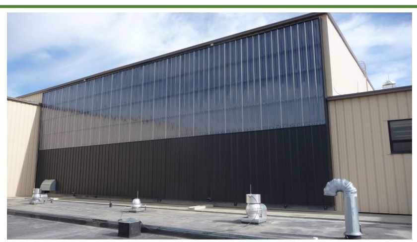
A passive heating solar wall. Energy projects from Energy manager and Planning and Programming efforts are identified through the Operations and Maintenance staff that manage each facility, then depending on cost are completed by that maintenance team for that facility or are passed to the Design and Project Management branch to manage as a typical project.

critical, not only in terms of energy use, but also in avoided utility costs as prices continue to rise precipitously. Ground source heat pumps are now in place at key facilities on Camp Rapid and the JFHQ building, as well as at the SDARNG's new Aviation Readiness Center, Watertown Readiness Center, and Mobridge Readiness Center. Over the course of FY21, these systems saved an estimated 1810 metric million BTU. The installation continues to target water consumption as well. working from a baseline set in