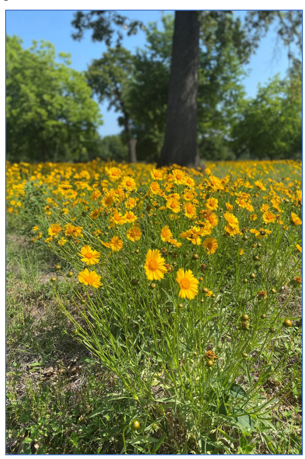
Natural Resources Pollinator Area Designated installation friendly habitat area for pollinators. A beautiful representation of balancing Robins AFB's commitment to the Air Force mission and sustaining the installation's natural resources.

Goal 8: Use the geographic information system and coordinated planning to facilitate informed and effective natural resources management and decision-making, and to promote natural resource education.