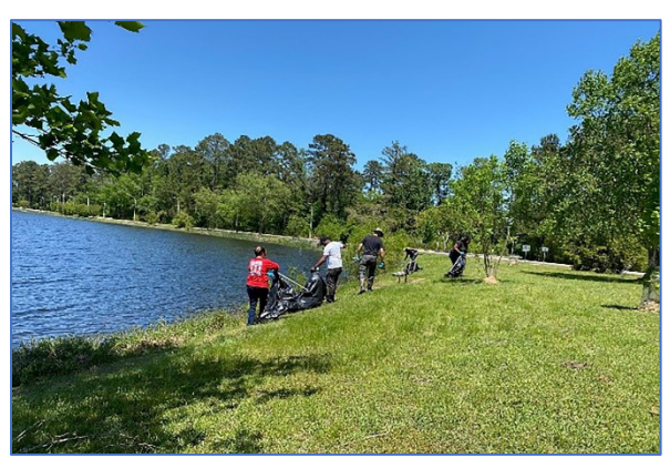
Waterways Clean-up at Scout Lake The Environmental Management Branch sponsored a clean-up at Scout Lake. The Environmental Management team gathered over 15 bags of trash and debris – one of many teams that contributed to more than 2 tons of trash removal.

throughout the installation and ensured its populace and the local community were aware of environmental activities in FY2021 and 2022. As a result of these efforts, the Robins AFB Environmental Management Branch received the 2022 KWRB Community Partnership Award.