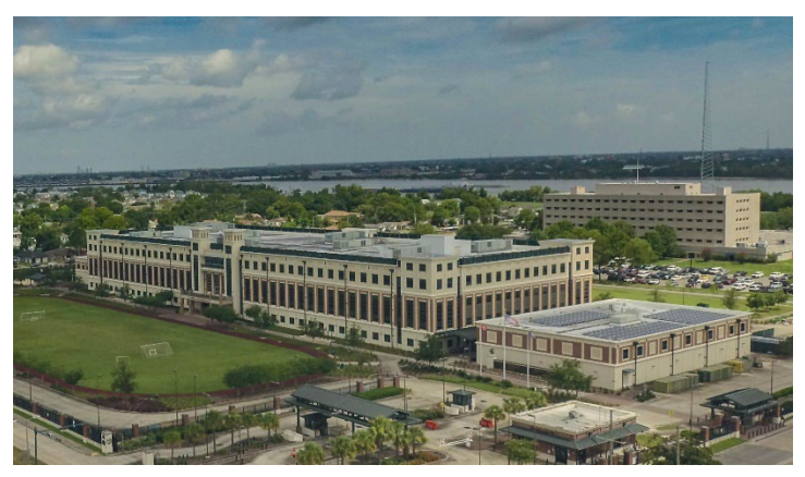
Building 1 and Supporting Solar Array 1

of 88 kilowatts (kW) to these two facilities, and each supports its respective building load. Currently, a project is underway to redesign the existing HVAC system with a built-up chilled water system. This design should further increase the sites energy resilience through the reduction in energy demand, thereby extending the functionality and effectiveness possible through the BCS.