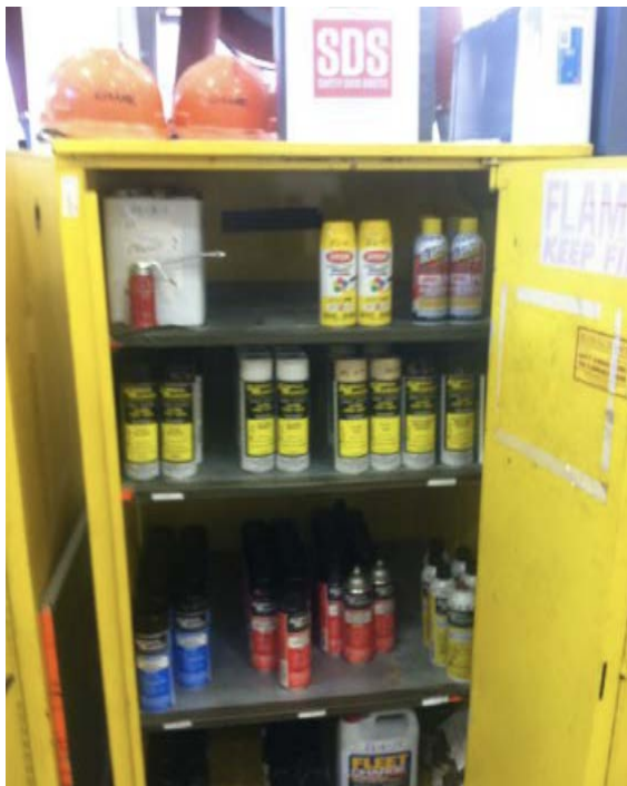
Flammable material storage cabinet at FMS #1. All materials at the facility are rigorously monitored and inventoried.

Material Management: FMS #1 conducts weekly inspections of controlled hazardous material and waste storage areas. The installation also conducts POL product inventories (mandated on an annual basis) at quarterly intervals to ensure accountability of manageable quantities and prevent excessive stock of materials. In addition, since 2008, the installation has reduced its universal and hazardous waste output by approximately 1½ tons.