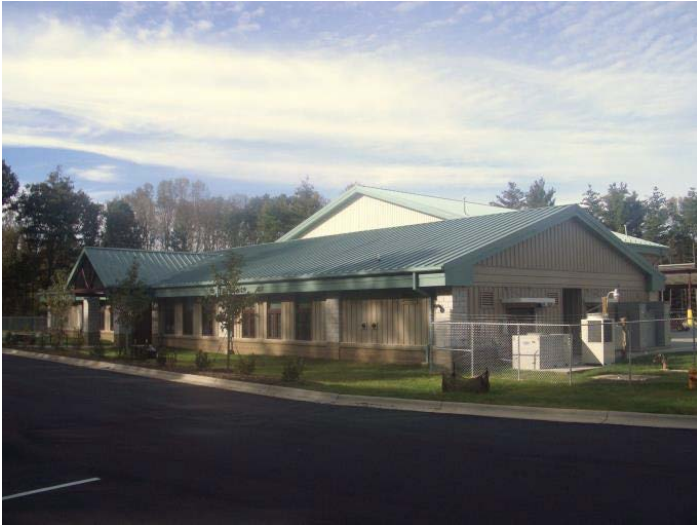
FMS #1, a premier industrial installation and environmental innovator in Asheville, NC.

a “good neighbor” to its citizens through policy adherence and a proactive philosophy of environmental protection.