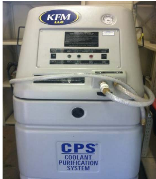
Onsite antifreeze recycling has significantly increased waste diversion and material reuse at FMS #1, where over 900 vehicles and equipment items are maintained.

FMS #1 first utilized antifreeze recycling with the acquisition of a coolant filtering machine that connects directly to vehicles to extract, clean and re-inject antifreeze in a closed loop. The system is self-monitoring and indicates the need for filter change via analog gauges, thus eliminating unnecessary maintenance processes that would generate hazardous waste. Since the initial process was introduced, the State Environmental Manager purchased recycling machines for the other maintenance facilities across the state. To date, FMS #1 has recycled more than 675 gallons. This process minimizes stocking of excessive quantities of replacement antifreeze, reduces waste generation and operator exposure to hazardous substances.