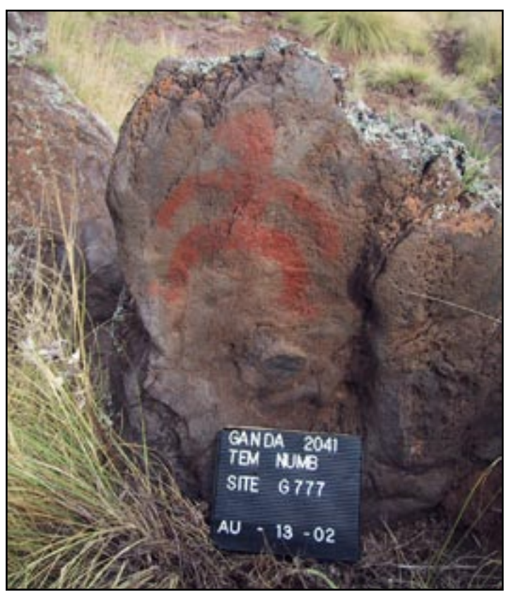
▲ One of two rare pictographs known to exist on Pohakuloa Training Area, serves as an example of the hundreds of cultural resources found on USAG-HI training lands. Thought to be a marker indicating a stream, it was discovered during a cultural resources survey.

Prior to 2001, USAG-HI completed Integrated Cultural Resource Management Plans (ICRMPs) for four training ranges, Fort Shafter, Wheeler Army Airfield, Schofield Barracks and Kilauea Military Camp. However, due to emerging Army organizational changes and installation facility