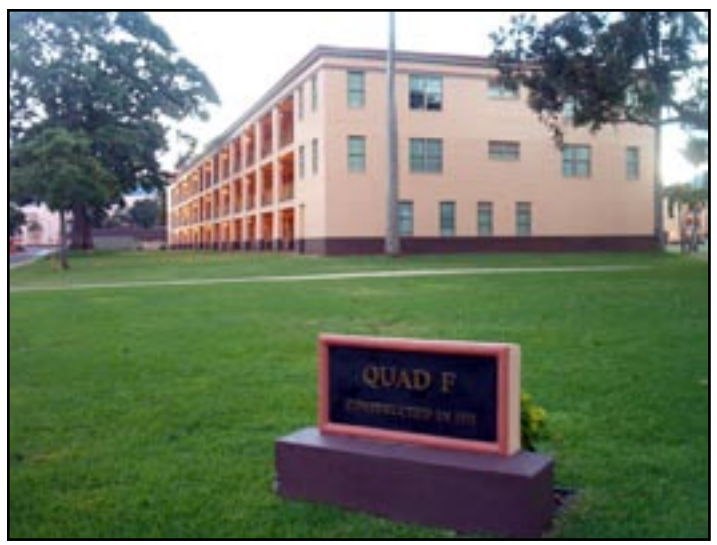
▲ The Quadrangle Barracks.

Additionally, the PA for the Garrison's Residential Community Initiative, the Army's largest housing privatization effort, covered 462 historic housing units located on four USAG-HI sub-installations. It