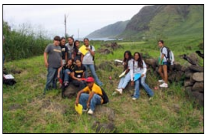
A group of students from Nanakuli High School pose while observing petroglyphs during a tour at Makua Military Reservation as part of an environmental awareness class supported by cultural resources staff supported in November 2004.

The Garrison funded, secured locations for and initiated design for two environmental/cultural visitors centers at Makua Military Reservation and PTA to educate the public on Army's environmental programs and aid in Soldier environmental and cultural awareness.