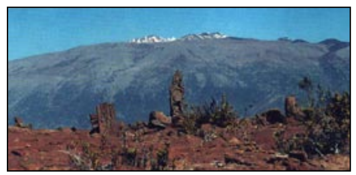
▲ A shrine at Pohakuloa Training Area is one of hundreds of religious sites under the care of the USAG-HI Cultural Resources Management staff.

The importance of USAG-HI's training facilities became evident in early 2004 when the Division deployed over 10,000 Soldiers to Iraq and Afghanistan. In addition, the past year has also seen thousands of Marine Corps, Air Force, Army Reserve and Army National Guard Units use USAG-HI facilities in preparation for deployment in support of the Global War on Terror.