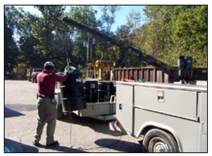
▲ As part of PPOC waste management efforts, hazardous waste personnel pick up waste from generator locations and transport to the 90-day accumulation point.

The Army currently owns 100 million square feet of unneeded building space on its installations, and is projected to spend $130 million per year over the next five years eliminating much of this excess infrastructure. Fort Campbell's Solid Waste/Recycling Program is positioned to operate and maintain Fort Campbell's World War II