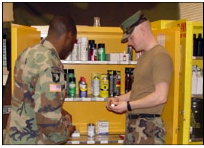
▲ Soldiers retrieve HAZMAT from their PPOC managed HAZMAT storage lockers.

relieving HAZMAT management from the unit and the Soldier. This was most recently evident when the PPOC efficiently packaged 141 unit contingency packages and handled 2,635 walk-in orders in support of mass emergency deployment of over 20,000 Campbell personnel. PPOC efficiency ensured no unit experienced delays due to packaging or material availability, in contrast to units across the country stopped at port due to improper packaging. PPOC staff followed up this comprehensive HAZMAT management by closing storage lockers and waste lockers of deployed units. These materials were brought to the centralized facility to be used by remaining reserve units on post.