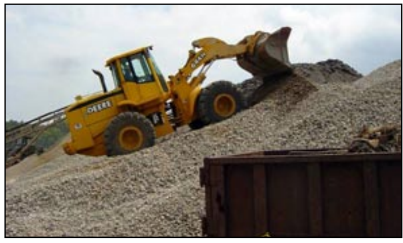
▲ C&D waste makes up 80 percent of Fort Campbell's total solid waste stream.

Deconstruction Program, which constitutes nearly 80 percent of the installation's construction and demolition (C&D) waste. The Solid Waste/Recycling Program office, staffed by two engineers and an environmental specialist, has made Fort Campbell a leader in waste reduction. It helps eliminate C&D waste under budget while making room on the installation for mission operations, modularity initiatives and frees up valuable resources for modernization of the Army.