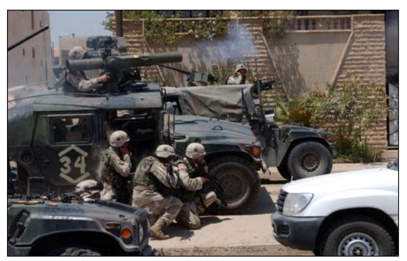
▲ Based out of Fort Campbell, KY, these Soldiers of the 101st Airborne Division rely on Pollution Prevention Operations Center hazardous material contingency packages to support them while fighting the Global War on Terror.

To meet this challenge, Fort Campbell took a collaborative approach toward Environmental Management System (EMS) implementation and hosted a Training and Sustainability Challenges Development Workshop in February 2003. The workshop, attended by the Garrison Commander, environmental staff, and the Army Deputy Chief