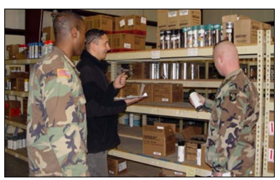
▲ PPOC Personnel provide safety, P2 and storage information for all HAZMAT raising awareness and ensuring compliance.

Fort Campbell personnel have identified many opportunities to improve waste management while enhancing readiness. PPOC programs are cornerstones of this effort by alleviating and